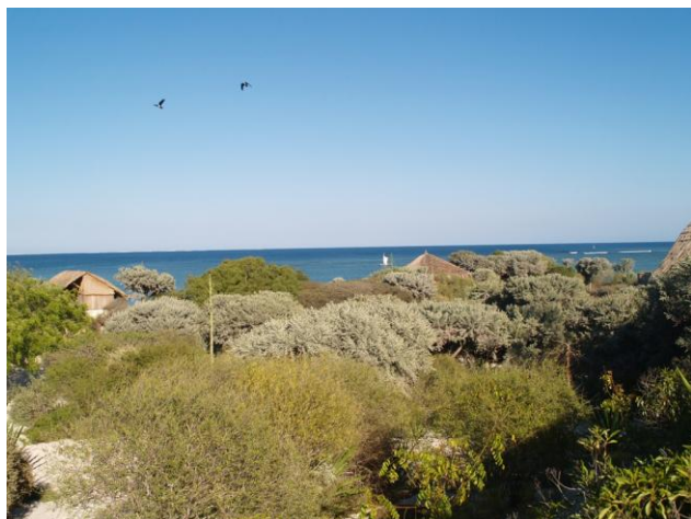
our lodge at Anakao

We spent 2 nights at the beautiful beach of Anakao village. Pleasant, laid back Resort. Littoral Rock Thrush in the Hotel grounds. And the starting point for Nosy Ve. To get there take a speed boat from Toliara (1 hour).