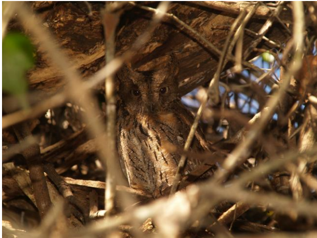
Totoroka Scops Owl

On the way from Isalo/Ranohira to Toliara. Zombitse is the last remaining transition forest between western and southern regions. It is home of a very range restricted endemic, Appert's Greenbul. Other specialities are Giant Coua, Coquerel's Coua, Banded Kestrel and Archbold's Newtonia. Try to stay at least one full day. Two mornings would do the place justice. There are 3 easy trails starting from the Park office/entrance. You can find accommodation in Sakaraha or stay in an Eco-Lodge 10km from the Park entrance.