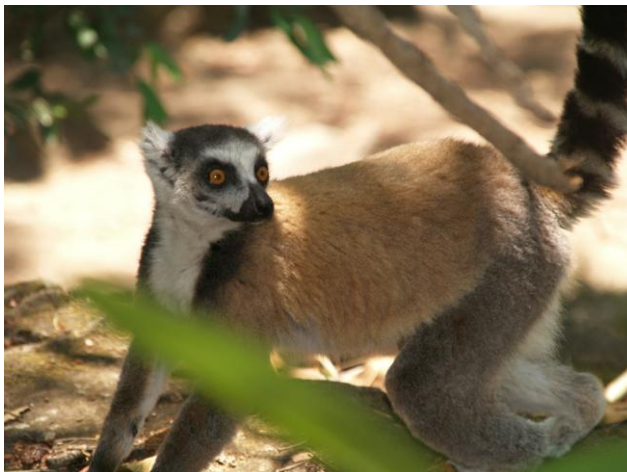
a Ring-tailed Lemur at Isalo NP