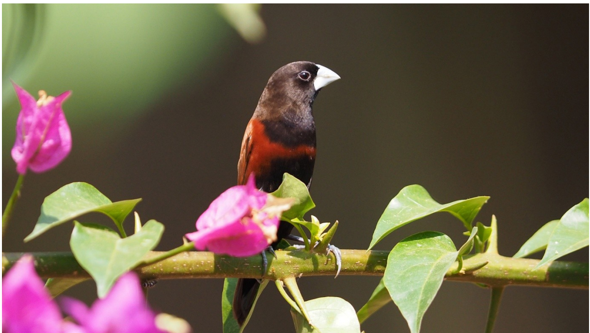
(Philippine) Pied Fantail, Striated Grassbird, Chestnut Munia