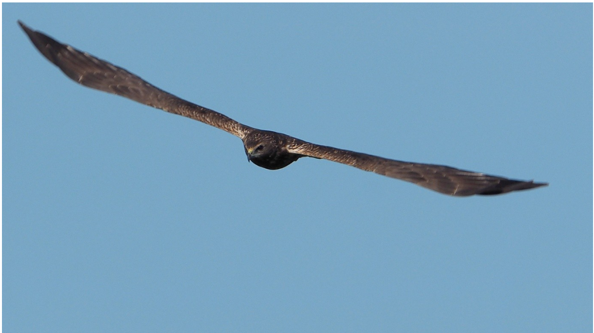
Philippine Duck, Buff-banded Rail, Eastern Marsh Harrier