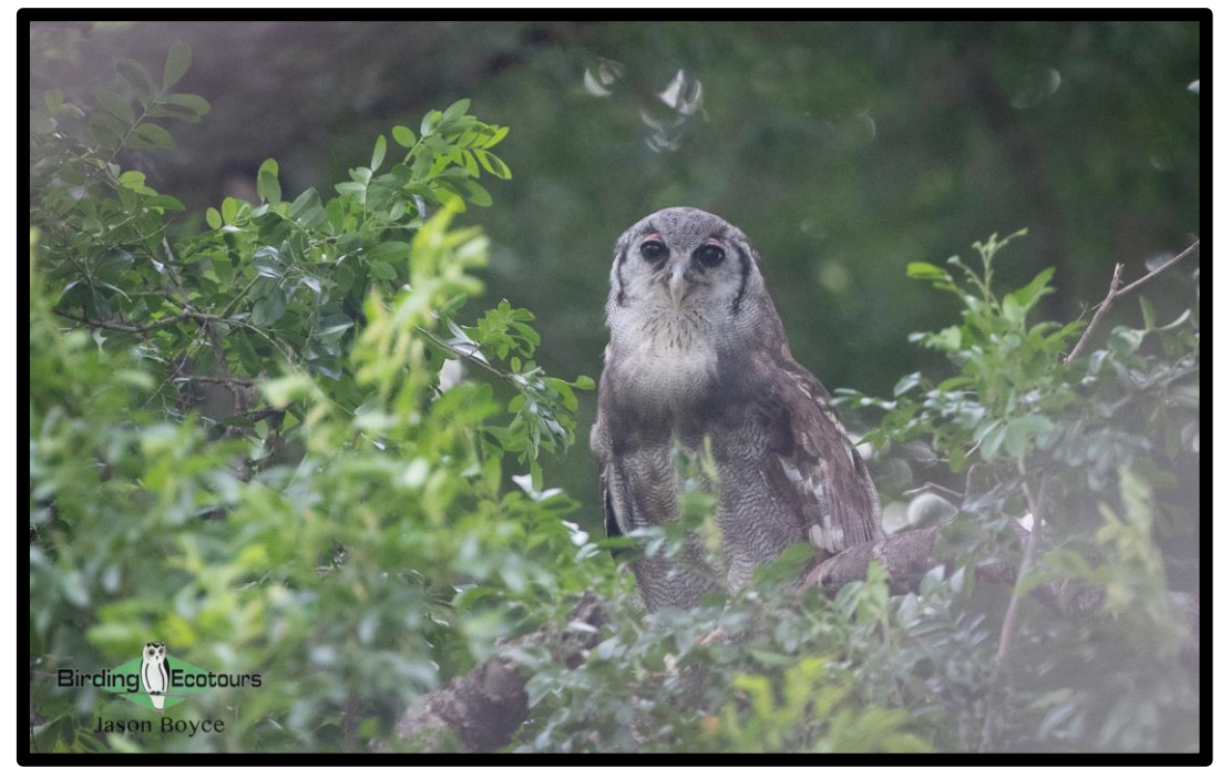
This Verreaux's Eagle-Owl showed nicely one late afternoon, puffing up his throat and neck when calling