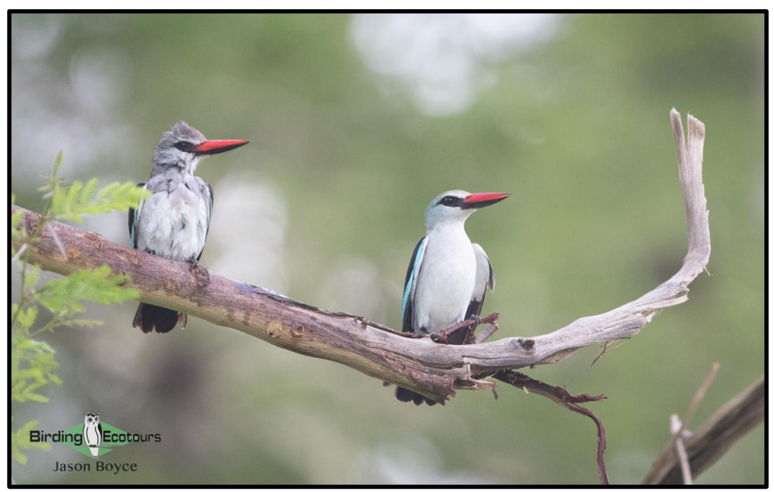
A pair of Woodland Kingfishers in the fever tree forest along the Limpopo River

It's common knowledge that South Africa has very much to offer as a birding destination, and the memory of this trip echoes those sentiments. With an itinerary set in one of South Africa's premier birding provinces, the Limpopo Province, we were getting ready for a birding extravaganza. The forests of Magoebaskloof would be our first stop, spending a day and a half in the area and targeting forest special after forest special as well as tricky range-restricted species such as Short-clawed Lark and Gurney's Sugarbird. Afterwards we would descend the eastern escarpment and head into Kruger National Park, where we would make our way to the northern sections. These included Punda Maria, Pafuri, and the Makuleke Concession – a mouthwatering birding itinerary that was sure to deliver.