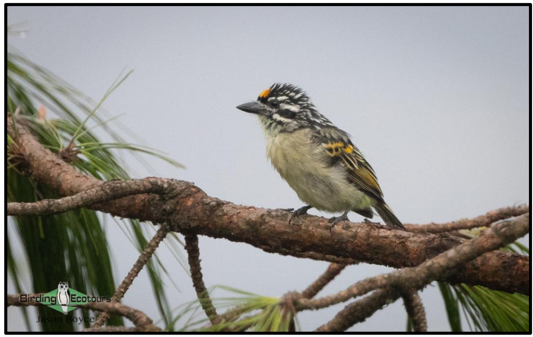
One of the first species of which we managed to get really nice pictures on this tour, Yellow fronted Tinkerbird