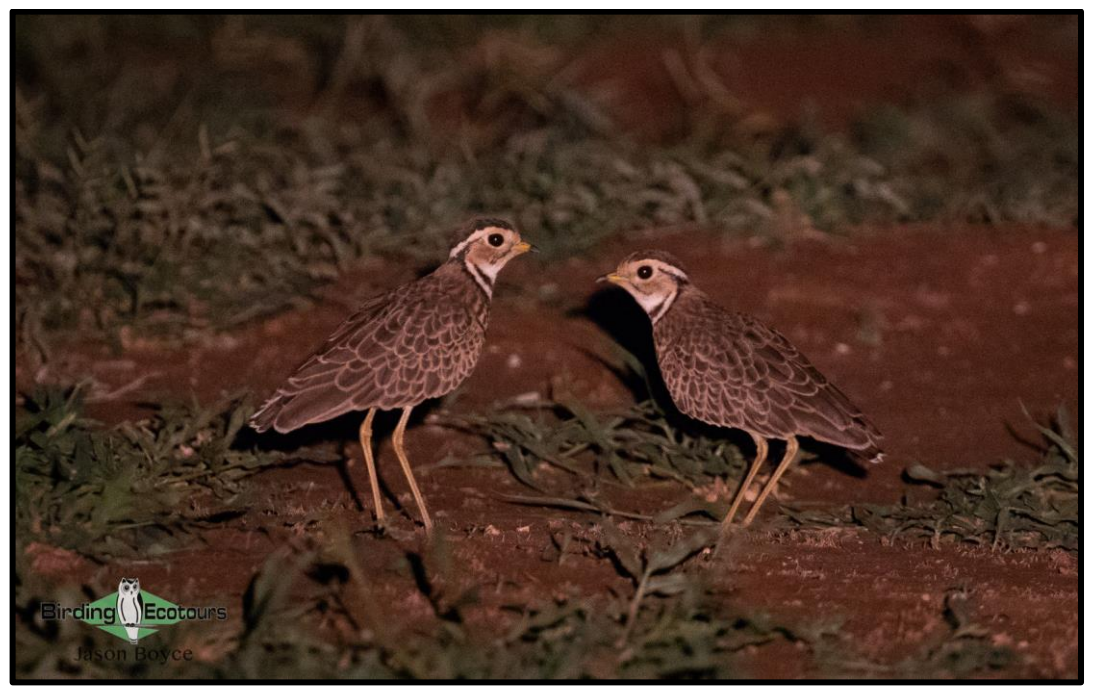
A lovely pair of Three-banded Coursers

are still rather pale and haven't grown the dark fur on their back yet. And a few meters on we noticed a couple of birds on the ground. "Could they be coursers?" we exclaimed, and, sure enough, they were a pair of Three-banded Coursers – well spotted!