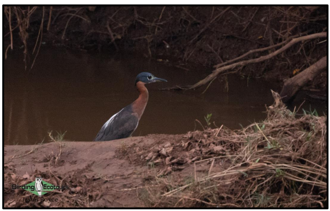
Just after sunset this incredible species landed on the bank in view from the Luvuvhu Bridge: White-backed Night Heron.

Little did we know but the best was yet to come: As the light faded a White-backed Night Heron flew in and landed on the sand bank below us – what a treat! It was truly great to see the white on the back showing clearly; this feature of the bird is often not visible.