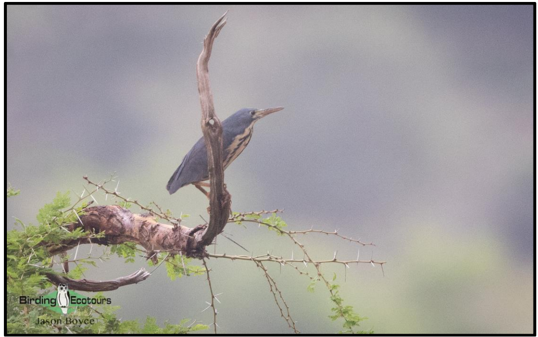
Dwarf Bittern is a fairly sporadic species, often occurring late in the season after good rainfalls.

We met in the afternoon again for a lovely high tea, after which we jumped on the cruiser and headed out again. We again drove east and birded from the vehicle. We enjoyed some casual sightings of a large herd of Cape Buffalo , this time boasting Yellow-billed Oxpecker , and White-browed Robin-Chat , Burchell's Coucal , a few Little Bee-eaters , White-winged Widowbird , Crowned Hornbill. Spotted Flycatcher and Red-backed Shrike flitted between the lower-hanging branches, while Southern Black Tit parties cruised by. We had a few good conversations and shared stories about the African bush and the Kruger National Park as we enjoyed our sundowners in the fever tree forest. On the way from the restaurant back to the rooms we were treated to sightings of both Thick-tailed Greater Galago and Cape Genet ! The former was just walking around on the wooden railings a mere few meters from us. It was incredible to see these nocturnal mammals up close.