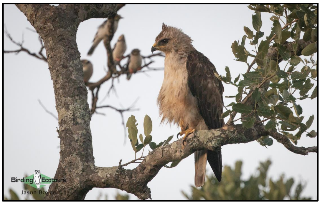
This Wahlberg's Eagle was minding his own business when a noisy group of White-crested Helmetshrikes (which can be seen in the background) started mobbing him.

in the Makuleke Concession from Pafuri Camp. The Mahoni Loop was alive with activity, and we encountered two different Wahlberg's Eagles right away; one of them was enduring some harassment from a party of White-crested Helmetshrikes . A little further on the loop we found a few Golden-breasted Buntings , Violet-backed Starling , African Hawk-Eagle , and Brown Snake Eagle , the latter two both perched up high on the ridge line. The Mahoni Loop has some superb scenery with a few really old Baobab trees, an awesome sight for any naturalist. A few Mosque Swallows were cruising around, and later in the morning we encountered a pair of the rather prized White-breasted Cuckooshrike , a really tough bird to pin down anywhere in South Africa. Later we managed really decent views of both Bennett's Woodpecker and Retz's Helmetshrike ; two species that hang out in the taller, mature woodland around Punda Maria.