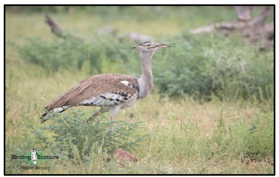
A true beast of a bird, Kori Bustard