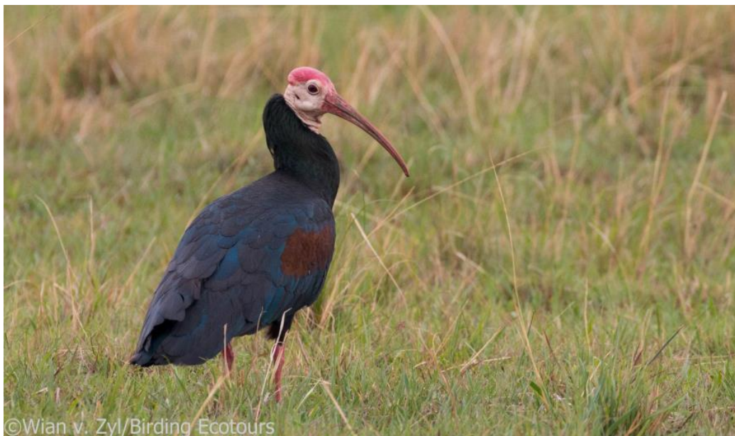
Southern Bald Ibis

After eventually getting smashing views of a female White-bellied Bustard we made our way back past the town to the village of Daggakraal. En route we managed to connect with Spike-heeled and Eastern Clapper Larks , Cape Bunting , Sentinel Rock Thrush , Black-winged Kite , Black-rumped Buttonquail , Red-throated Wryneck , Rock Kestrel , Banded Martin , Pale-crowned Cisticola , and Southern Red Bishop . At Daggakraal itself we spent about two hours walking, searching, and hoping before we connected with the highly localized and endangered Botha's Lark . We spent about half an hour with the bird as it fed closer and closer to us and even entertained us as we were eating our lunch in the field.