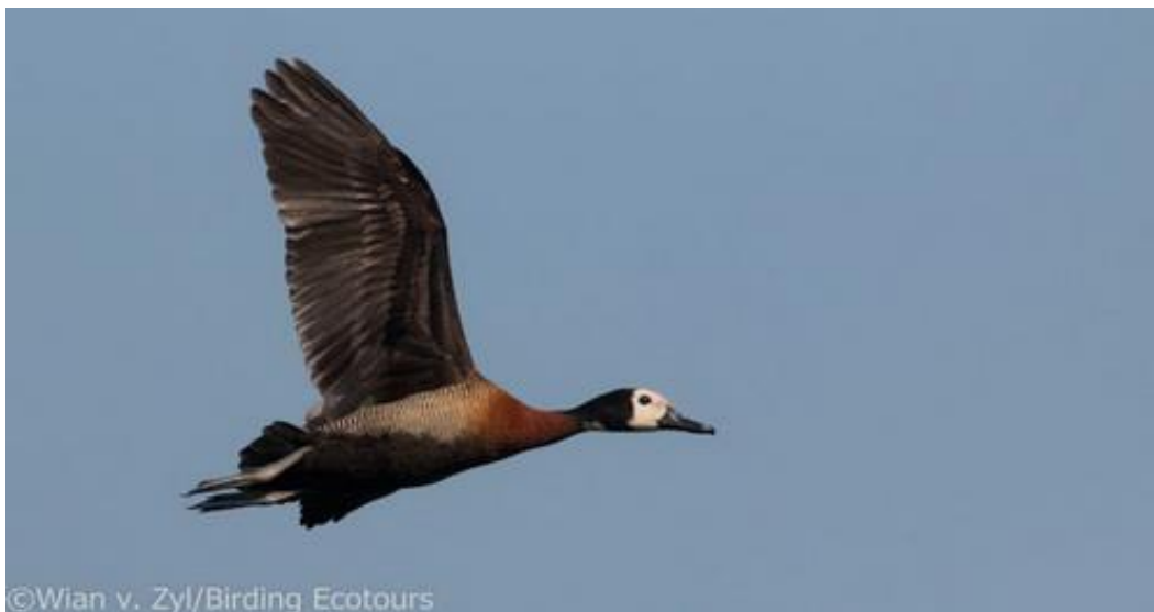
White-faced Whistling Duck

After breakfast and some grocery shopping for the next two nights we transferred to Mkhuze Game Reserve. En route we saw African Pied Wagtail , Fan-tailed Widowbird , African Green Pigeon , and Western Cattle Egret . Once we had arrived in this wonderfully birdy park, Violet-backed Starling , Common Scimitarbill , Red-billed Oxpecker , Brown Snake Eagle , Village Weaver , and Red-billed Quelea were soon and easily found. Highlights on our afternoon drive included Black-crowned Tchagra , Crowned Lapwing , Crested Francolin , Chinspot Batis , Pink-throated Twinspot (female), Trumpeter Hornbill , African Harrier-Hawk , Lesser Spotted Eagle , and Emerald-spotted Wood Dove . We ended the day with an owling walk in and around the camp, but we were very unsuccessful in our attempts to tick some nocturnal species.