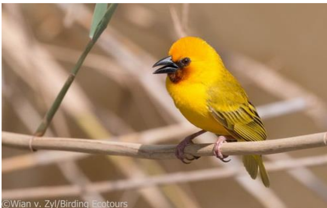
Southern Brown-throated Weaver

Sunbird, Livingstone's Turaco, Green Malkoha, and Grey Waxbill. We then continued to the St Lucia sewage ponds on the outskirts of town, where we easily connected with Grey Heron, Hamerkop, Black Crake, Common Moorhen, Black-winged Stilt, White-faced Whistling Duck, Ruff, African Sacred Ibis, and more. Sadly, birding in the iSimangaliso Wetland Park proved to be a little less productive than anticipated, but we still enjoyed sightings of African Wattled Lapwing, White-fronted Bee-eater, Red-billed Oxpecker, Brown Snake Eagle, Rufous-winged Cisticola, Grey-rumped Swallow, Yellow-breasted Apalis, and brief views of Green Twinspot, to name a few. Other birds for the day included nesting Southern Brown-throated Weavers, a Common Sandpiper on the back of a Hippopotamus, and plenty of Common Terns. After our lunch break in Cape Vidal, when we were about to leave, we were amazed by the sight of a pod of Humpback Whales very close to shore splashing about and playing in the water, breaching every so often, and leaving a crowd of spectators on the beach in awe and wonder.