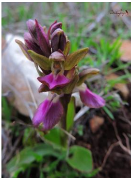
Fan-lipped Orchid ( Orchis collina )