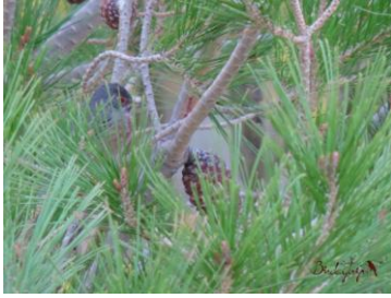
Dartford Warbler ( Sylvia undata )