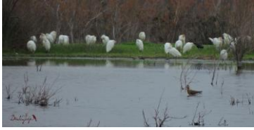
Black-tailed Godwit ( Limosa limosa ) and Cattle Egrets ( Bubulcus ibis )