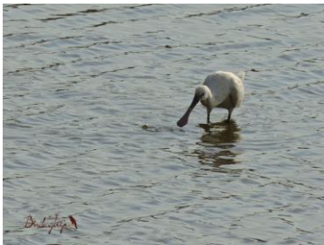
Spoonbill ( Platalea leucorodia )