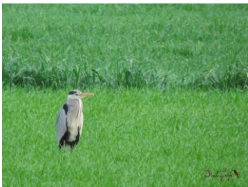
Grey Heron ( Ardea cinerea )