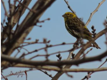
Serin ( Serinus serinus )