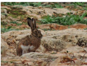
Iberian Hare ( Lepus granatensis )