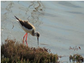
Black-winged Stilt ( Himantopus himantopus )