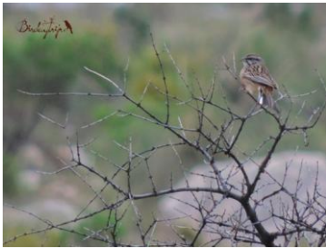
Rock Bunting ( Emberiza cia )