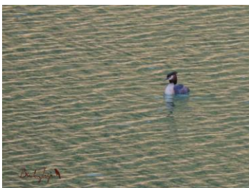
Great Crested Grebe ( Podiceps cristatus )