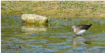
Green Sandpiper ( Tringa ochropus )