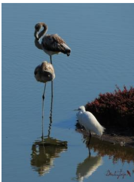
Greater Flamingos ( Phoenicopterus roseus ) and Little Egrete ( Egretta garzetta )