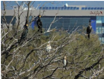
Booted Eagle ( Aquila pennata ) resting among Cormorants ( Phalacrocorax carbo )