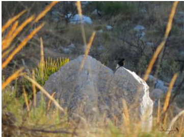
Black Wheatear ( Oenanthe leucura )