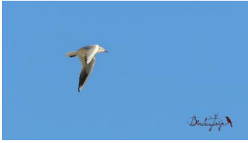
Black-headed Gull ( Chroicocephalus ridibundus )