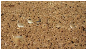
Little Bustards ( Tetrax tetrax )