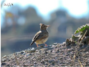
Crested Lark ( Galerida cristata )