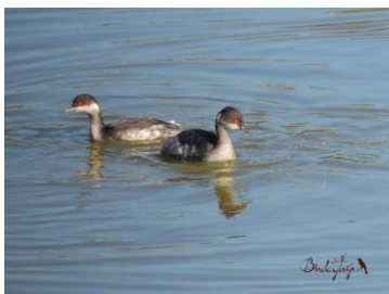
Black-necked Grebes ( Podiceps nigricollis )

I then went for victory to a cliff where the Eagle Owls live near Archidona and the owl was already hooting when I got down the car! What a great end for a marvelous day... and night!