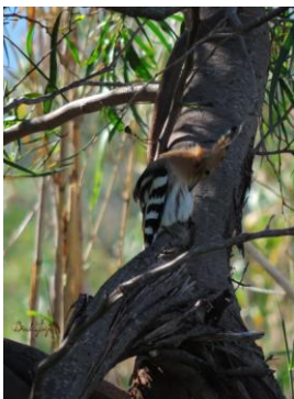
Hoopoe ( Upupa epops )