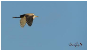
Grey Heron ( Ardea cinerea )