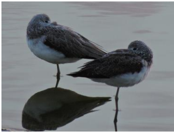
Greenshank ( Tringa nebularia )