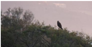
Marsh Harrier ( Circus aeruginosus )