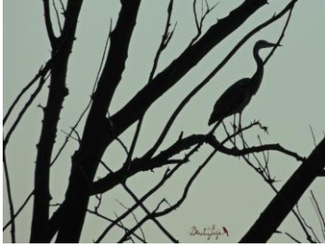
Grey Heron ( Ardea cinerea )