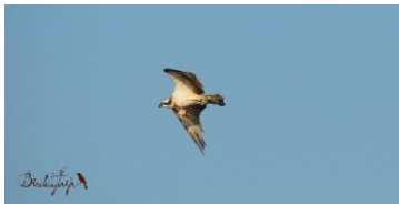
Osprey (Pandion haliaetus)

The Wallcreeper? As I use to say, there has to be a reason to come back!