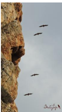
Griffon Vultures ( Gyps fulvus )