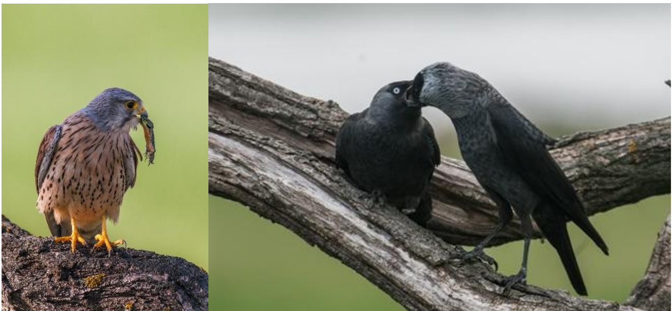
European Kestrel & Eurasian Jackdaw by Zoltan Oroszi