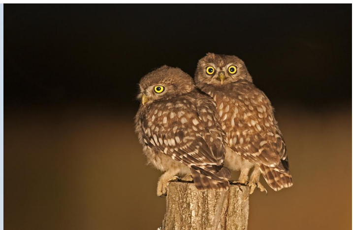
Little Owl photo by Andy Morffew ; Little Owls by Tibor Horvath