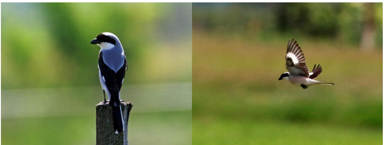
Lesser Grey Shrike at Kondor