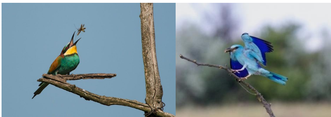
European Bee-eater & Eurasian Roller from mobile hides