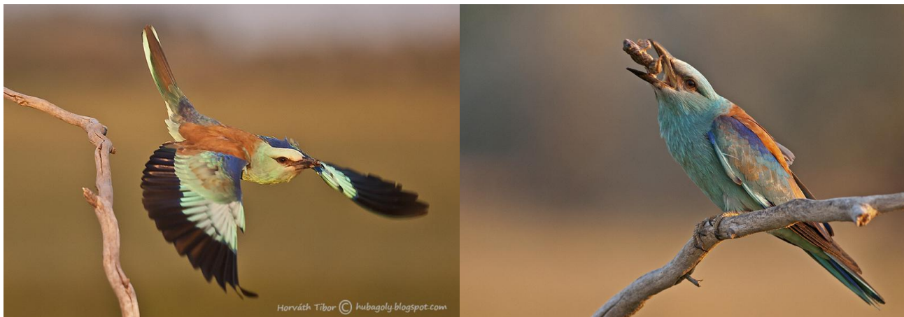
Eurasian Rollers from mobile hides