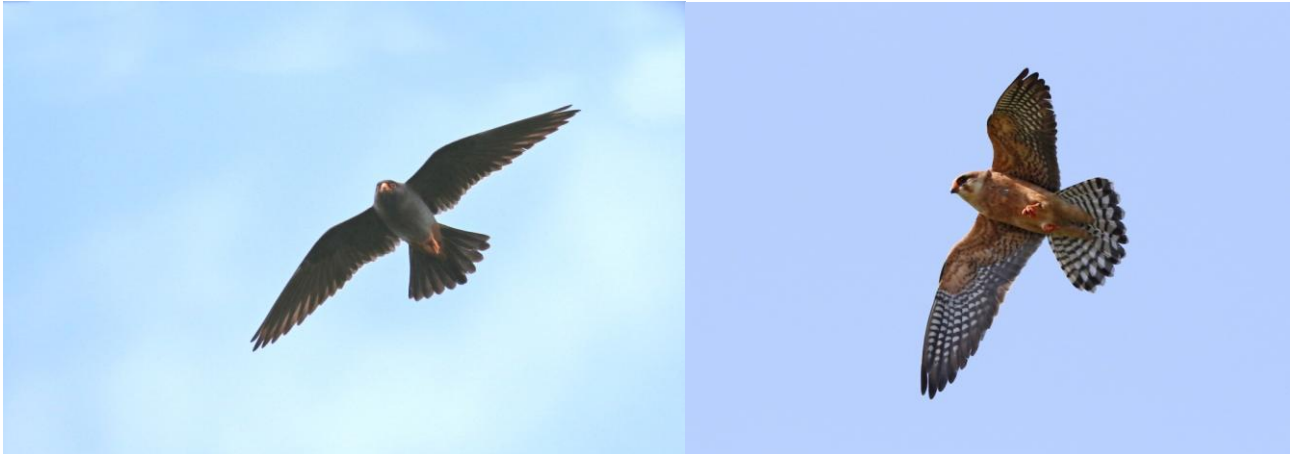
Red-footed Falcon male & female at Kondor