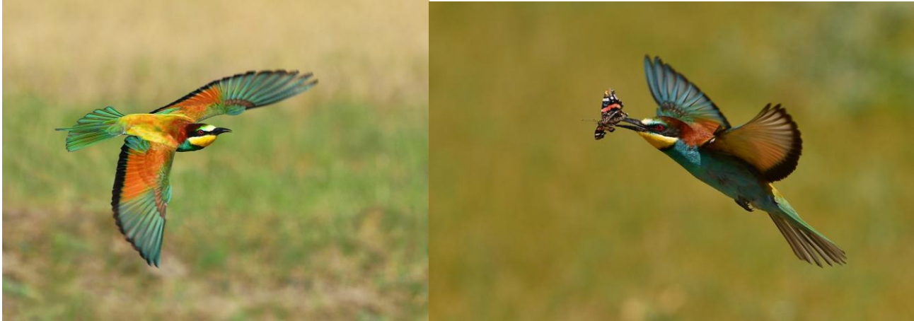
European Bee-eater, mobile hide