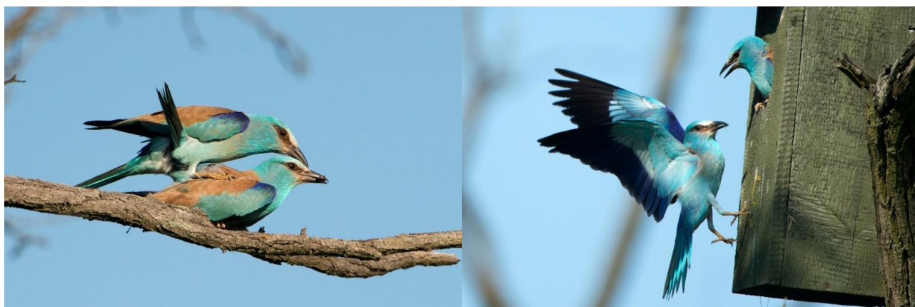
Eurasian Roller from mobile hides