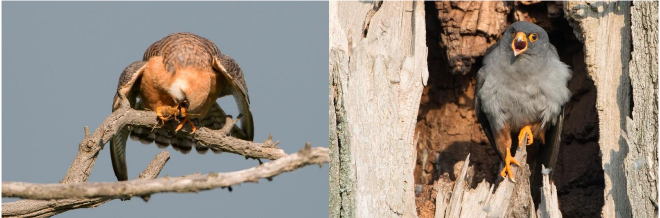
Red-footed Falcon female and male by Joerg Mager