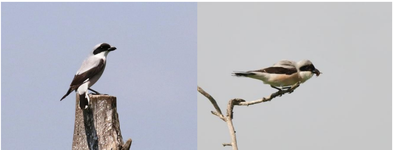
Lesser Grey Shrike