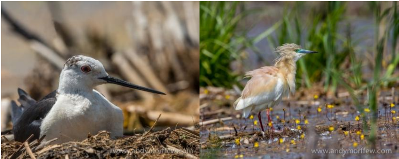
Black-winged Stilt & Squacco Heron