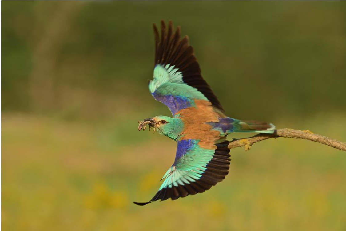
Eurasian Roller photo by Eric Muller, mobile hide