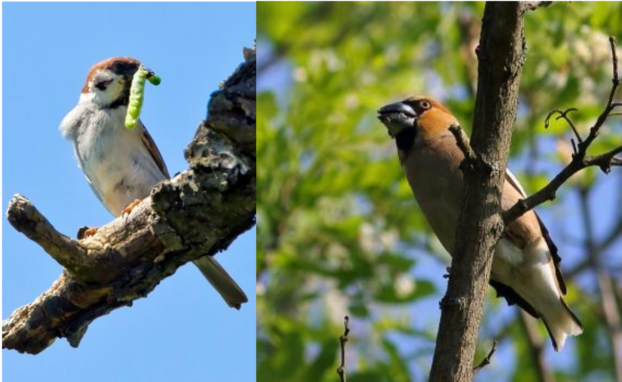
Tree Sparrow & Hawfinch