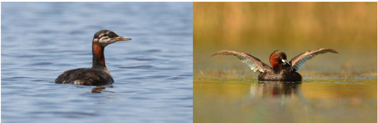
Red-necked Grebe ; Ferruginous Duck