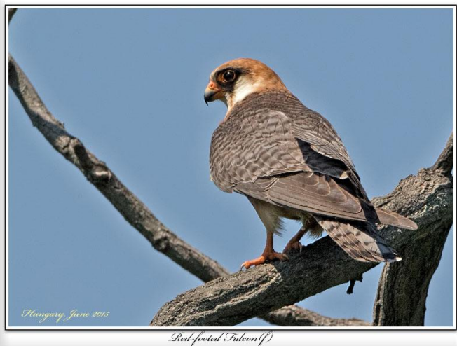
Red-footed Falcon male & female by Chris Massie-Taylor