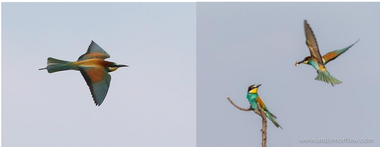
European Bee-eater