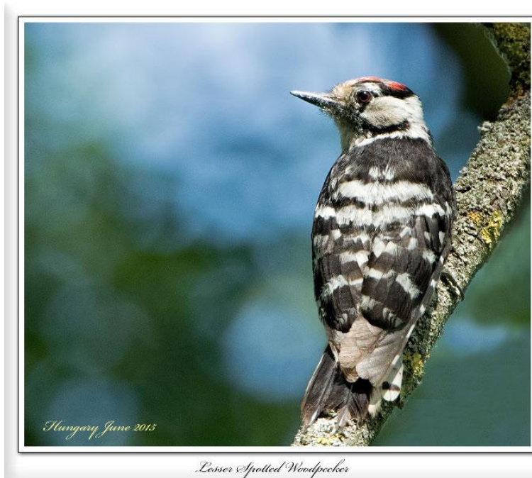
Lesser Spotted Woodpecker