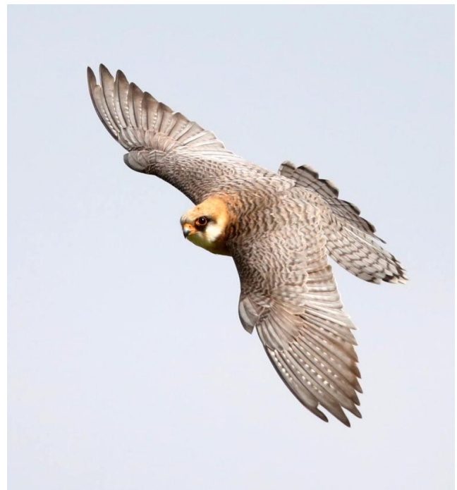
Red-footed Falcon female by

Park: Pygmy Cormorant, Great White Egret, Little Egret, Grey Heron, Purple Heron, Squacco Heron, Bittern, Little Bittern, Spoonbill, Sparrowhawk, Red-footed Falcon, Black-winged Stilt, Avocet, Little Ringed Plover, Lapwing, Dunlin, Curlew Sandpiper, Ruff, Marsh Sandpiper, Wood Sandpiper, White-winged Tern, Whiskered Tern, Turtle Dove, Common Cuckoo, European Bee-eater, European Roller, Lesser Spotted Woodpecker, Middle Spotted Woodpecker, Great Spotted Woodpecker, Little Owl, Golden Oriole, European Hoopoe, Common Redstart, Black Redstart, Blackcap, Lesser Whitethroat, Long-tailed Tit Northern form, Nuthatch, Red-backed Shrike, Lesser Grey Shrike, Tree Sparrow, Hawfinch, Chaffinch, Goldfinch, Greenfinch, Yellowhammer