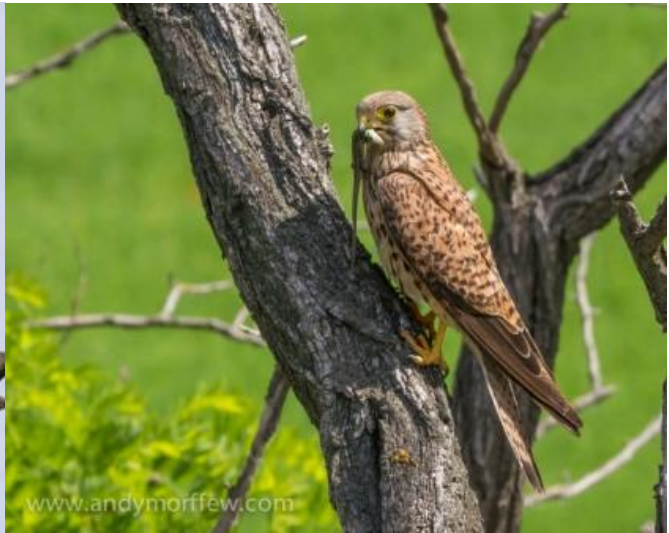
Eurasian Kestrel female