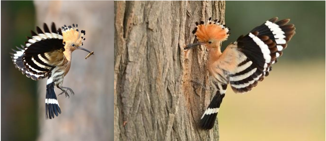
European Hoopoes from mobile hides