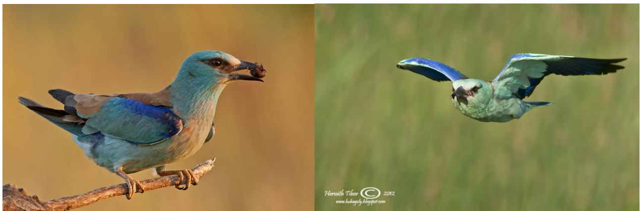
Eurasian Roller