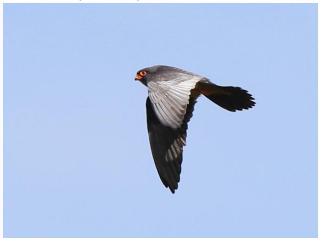
Red-footed Falcon males at Kondor