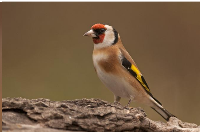
Winter Wren & European Goldfinch