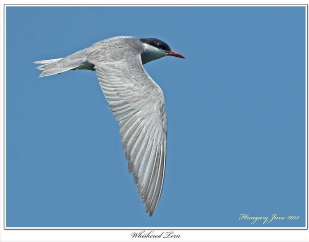
Pygmy Cormorant & Whiskered Tern