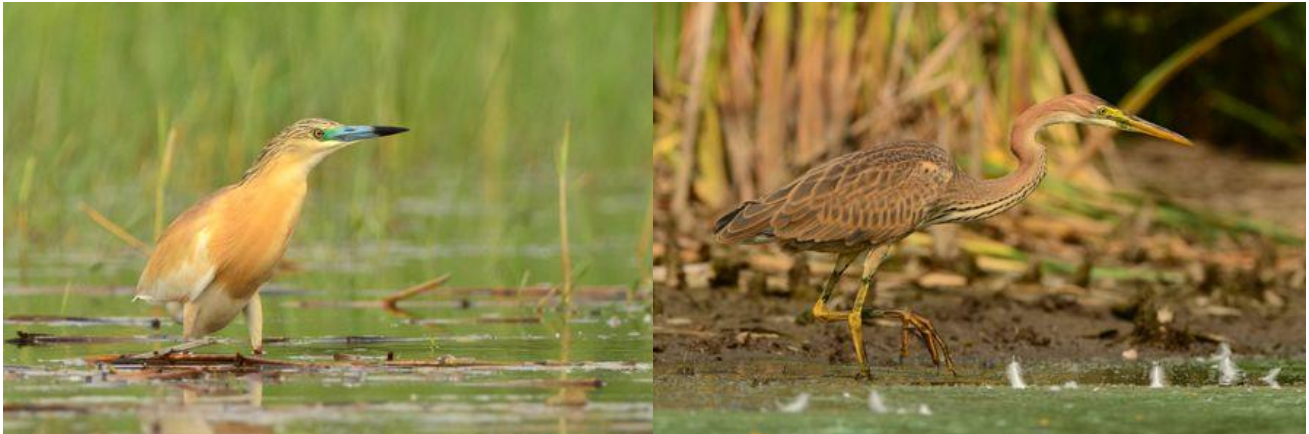
Squacco Heron & Purple Heron