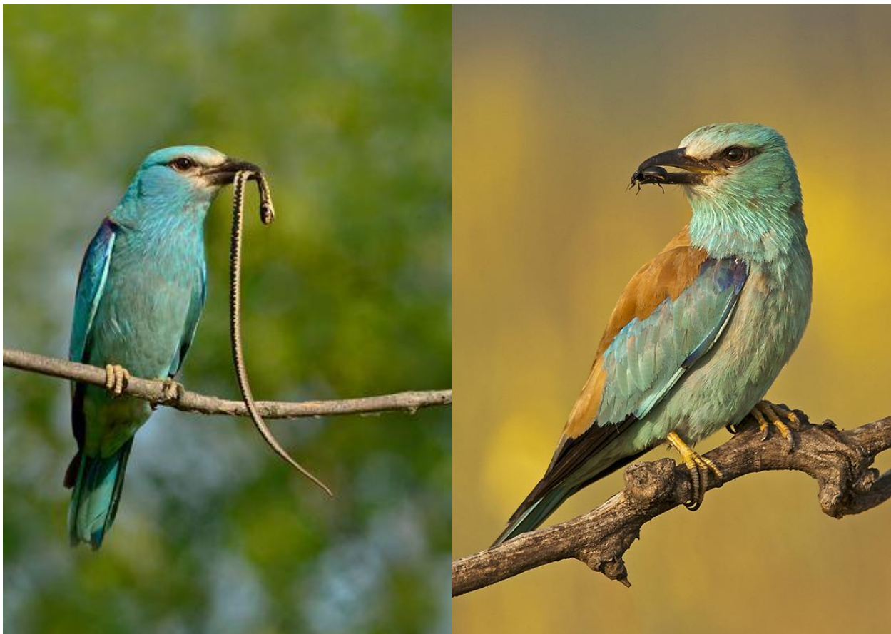
Eurasian Rollers from mobile hides