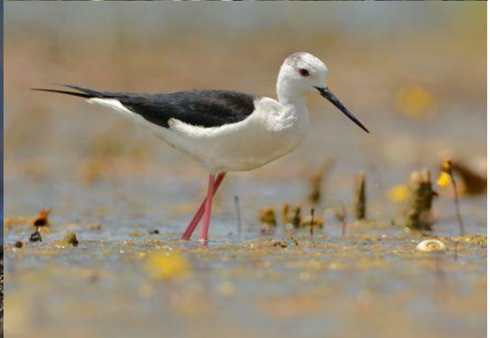
Black-winged Stilt by Tibor Horvath & Eric Muller; Blue-headed Wagtail female by Eric Muller at top