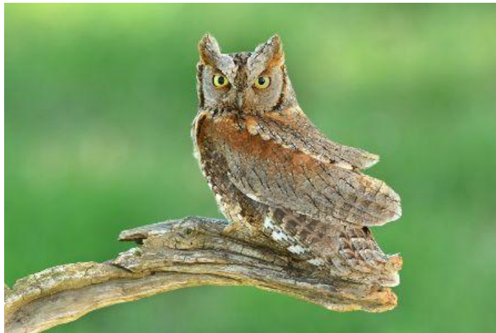
Scops Owl