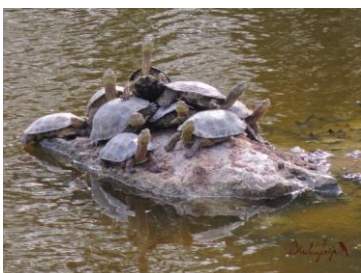
Spanish Terrapins ( Mauremys leprosa )