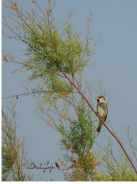
Spanish Sparrow ( Passer hispaniolensis )