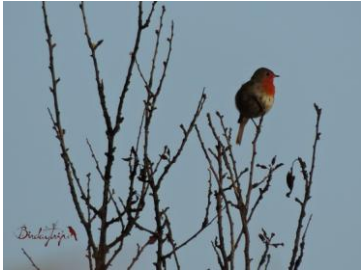
Robin ( Erithacus rubecula )