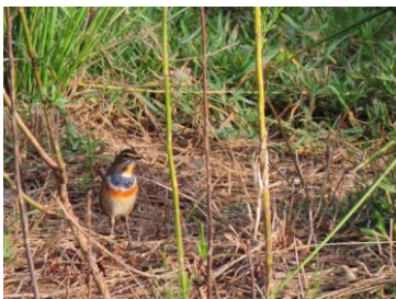
Bluethroat ( Luscinia svecica ssp. cyanecula )

We ticked some new species on the list like Common Waxbill and Red-legged Partridge and could even have a glimpse of an Egyptian Mongoose sneaking in the reeds. Finally, to put a brilliant end to the day, we had wonderful views of several Bluethroats.