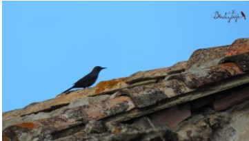
Blue Rock Thrush ( Monticola solitarius )