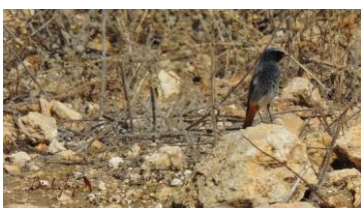
Black Redstart ( Phoenicurus ochruros )