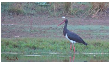
Black Stork ( Ciconia nigra )