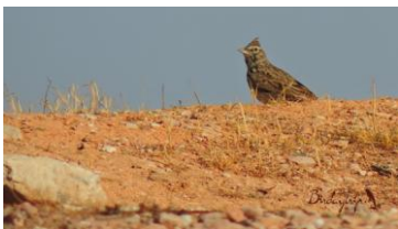
Thekla Lark ( Galerida theklae )