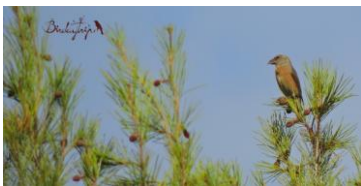
Common Crossbill ( Loxia curvirostra )