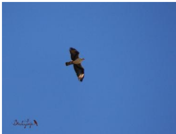
Bonelli's Eagle ( Aquila fasciata )

We have visited Alora on our way back to Malaga, where we had great views of common and Lesser Kestrels.