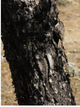
Short-toed Treecreeper ( Certhia brachydactyla )