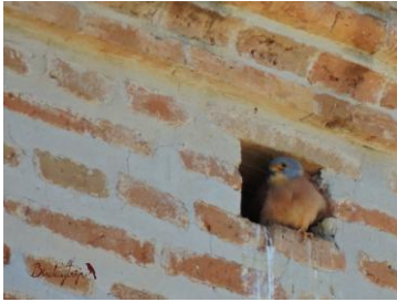
Lesser Kestrel ( Falco naumanni )