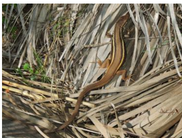
Large Psammodromus ( Psammodromus algirus )