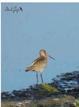
Bar-tailed Godwit ( Limosa lapponica )