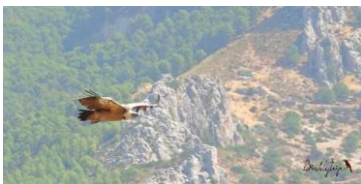
Griffon Vulture ( Gyps fulvus )