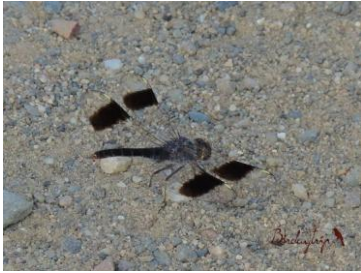
Banded Groundling ( Brachythemis impartita )