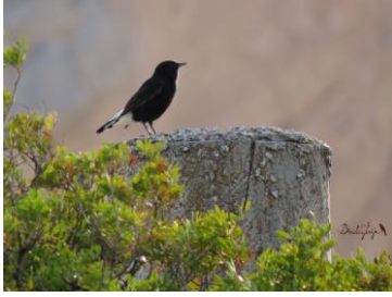
Black Wheatear ( Oenanthe leucura )