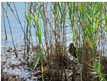
First Snipe ( Gallinago gallinago ) of the season!!!