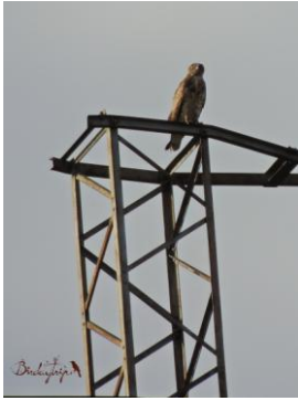
Short-toed Eagle ( Circaetus gallicus )