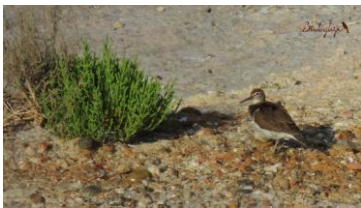
Common Sandpiper ( Actitis hypoleucos )