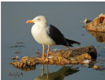
Lesser Black-backed Gull ( Larus fuscus )