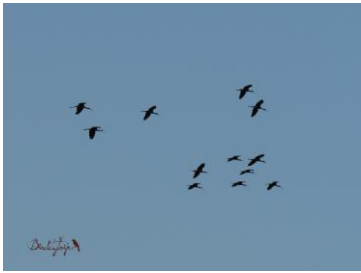
Glossy Ibis ( Plegadis falcinellus )