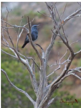
Blue Rock Thrush ( Monticola solitarius )