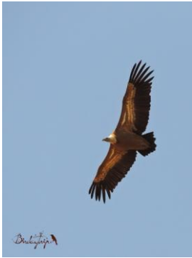
Griffon Vulture ( Gyps fulvus )