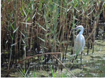
Little Egret ( Egretta garzetta )