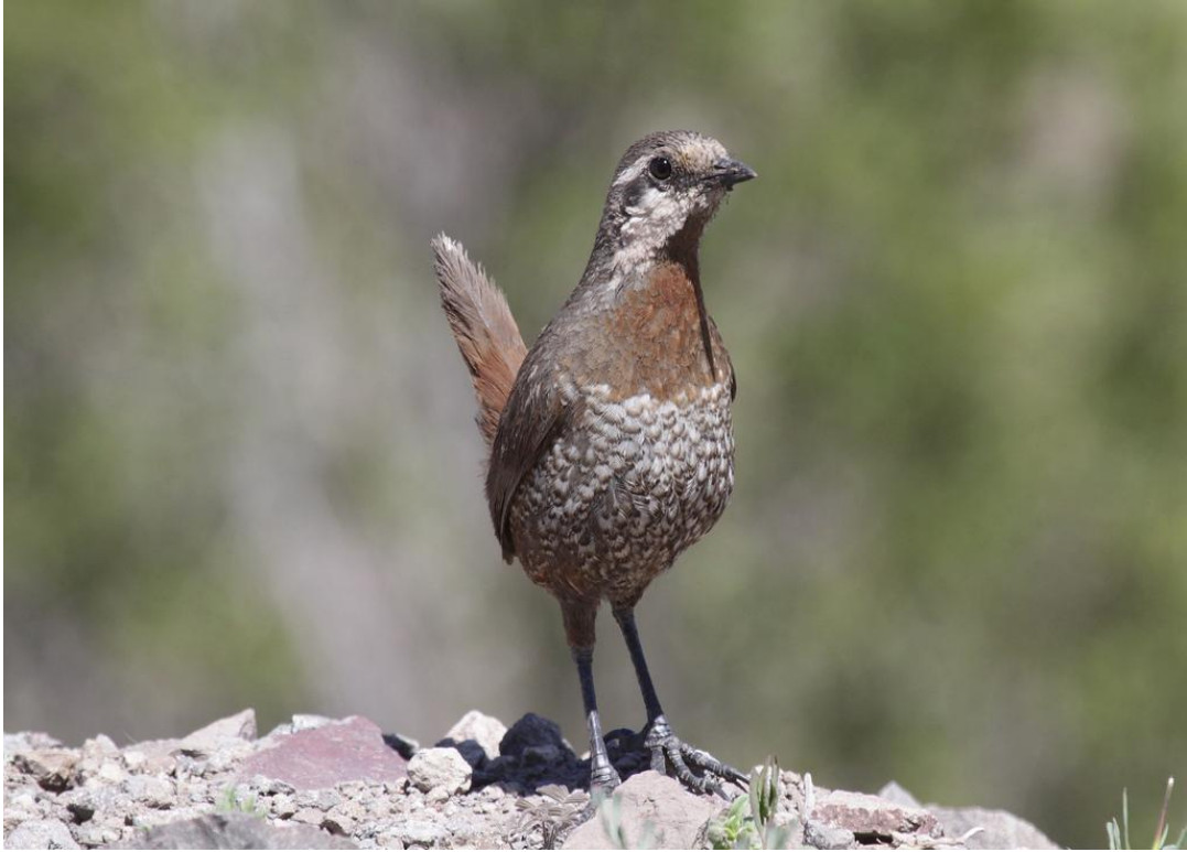
The Moustached Turca is a common Chilean endemic, easily seen around Santiago.