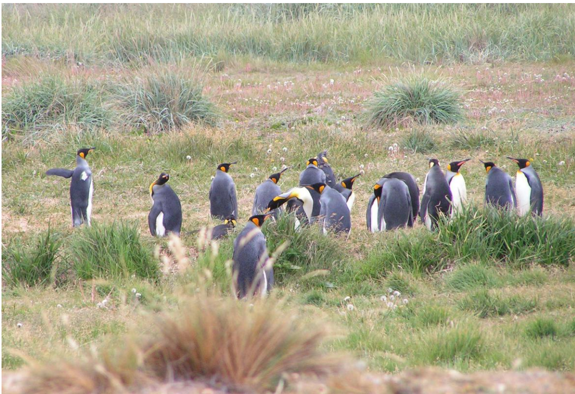
King Penguin in Tierra del Fuego (picture: Martine Fombarlet)

http://www.flickr.com/photos/fabrice-schmitt/