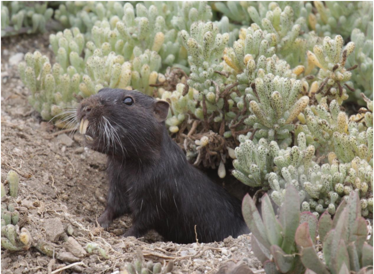
The Coruro, a relatively common mammal in Central Chile, living in huge colonies with sometimes hundreds of burrows

A nice adult seen in the foothill above Lampa.