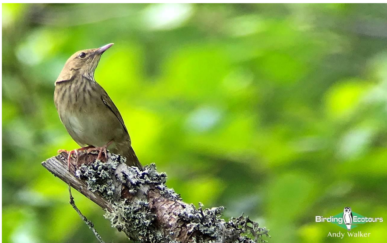
The often skulking River Warbler was making the most of the good weather.

A short rain shower (no surprise there, given the weather we'd been having) gave us a break and a late breakfast. Afterwards the sun broke out, and it finally got warm for the first time since our arrival in Warsaw almost a week earlier. We headed straight for a good viewpoint and were duly rewarded with flyover Lesser Spotted Eagle, European Honey Buzzard, Common Buzzard , and White Stork . Bushes nearby held a very showy (occasionally) River Warbler and Icterine Warbler present, while the nearby reedbed was full of singing Savi's, Great Reed, Eurasian Reed , and Sedge Warblers . Red-backed Shrike , nesting White Wagtail , and Common Rosefinch were also present and showing well.