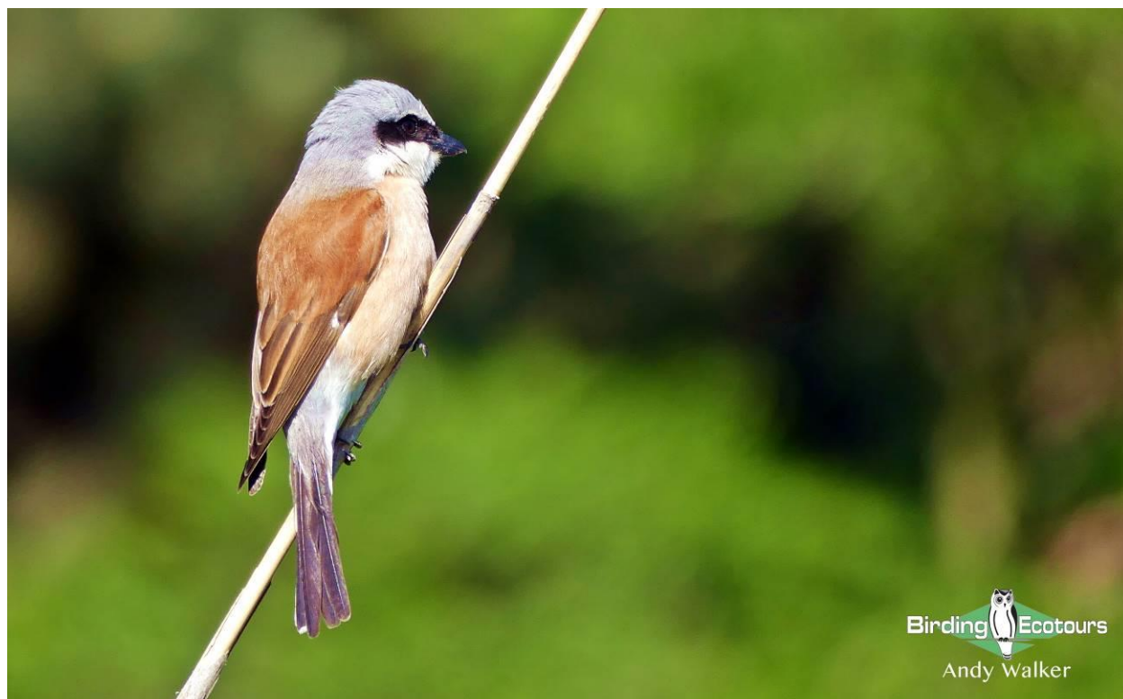
Stunning male Red-backed Shrike showing very well

After a long day in the vehicle the previous day it was nice to have a long walk through the countryside today. We headed along the west side of the mouth of the Vistula River to the point where this long river enters the Baltic Sea. Warblers were very much in evidence in the forest, scrub, and wetlands, with Common Chiffchaff , Lesser and Common Whitethroats , Willow Wood , Icterine , Sedge , Eurasian Reed , Great Reed , and Garden Warblers , and Eurasian Blackcap all seen. Eurasian Golden Oriole was singing and calling but elusive as ever. Common Rosefinches and Red-backed Shrikes were much more obliging, as were European Serin , visibly migrating Coal Tits , and Spotted Flycatcher .