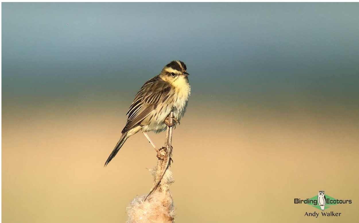
Aquatic Warbler, one of the star birds of the trip

An early start (our first in glorious sunny weather for a week) was the order of the day to head into the marsh to target one particular bird, the globally threatened (Vulnerable) Aquatic Warbler . Approximately 85% of the global population of this species breed in Poland, with 25% of these breeding in the Biebrza Marshes. We found some suitable habitat and in no time at all were enjoying watching this small Acrocephalus warbler, along with its close relative, but much more common Sedge Warbler . Here we also had good views of reeling Common Grasshopper Warbler , Common Reed Bunting , Whinchat , Common Snipe , and Northern Lapwing , all set to the haunting calls of Common Crane and joyous calls of Common Cuckoo .