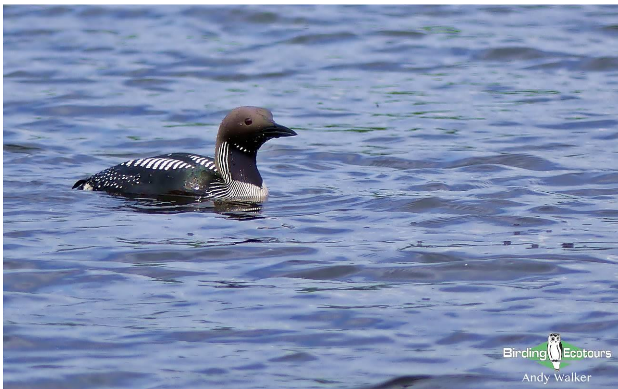
Black-throated Loon looking splendid in breeding plumage

We continued our journey to Dojlidy Fish Ponds near Białystok, where the star bird was a summer-plumaged Black-throated Loon . What an absolutely stunning-looking bird, and a nice surprise! Eurasian Bitterns were booming but remained hidden, though we did get great views of two pairs of Common Cranes . Several ducks were present, and we had very nice observations of Garganey , Tufted Duck , and Eurasian Wigeon , while Great Crested and Red-necked Grebes were also seen. Common Rosefinches were very vocal, as were Great Reed and Sedge Warblers .