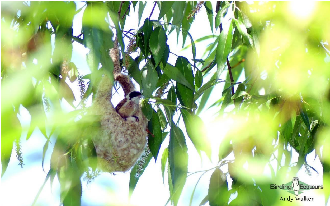
Eurasian Penduline Tit at its beautifully constructed nest

A late start was the order of the day, so after breakfast we headed north through the valley, where we took a nice walk along a boardwalk through a marsh, finding an array of interesting species such as Eurasian Penduline Tit , Bluethroat , Marsh Warbler (mimicking a range of other species), Savi's Warbler , White-tailed Eagle , Western Marsh Harrier , Garganey , and a very distant and high up Black Stork , conclusive but not the greatest of views of this beauty. Most interesting of the sightings above was that of the Eurasian Penduline Tit , which we found at its incredible nest – this has to be one of the best nest structures out there!