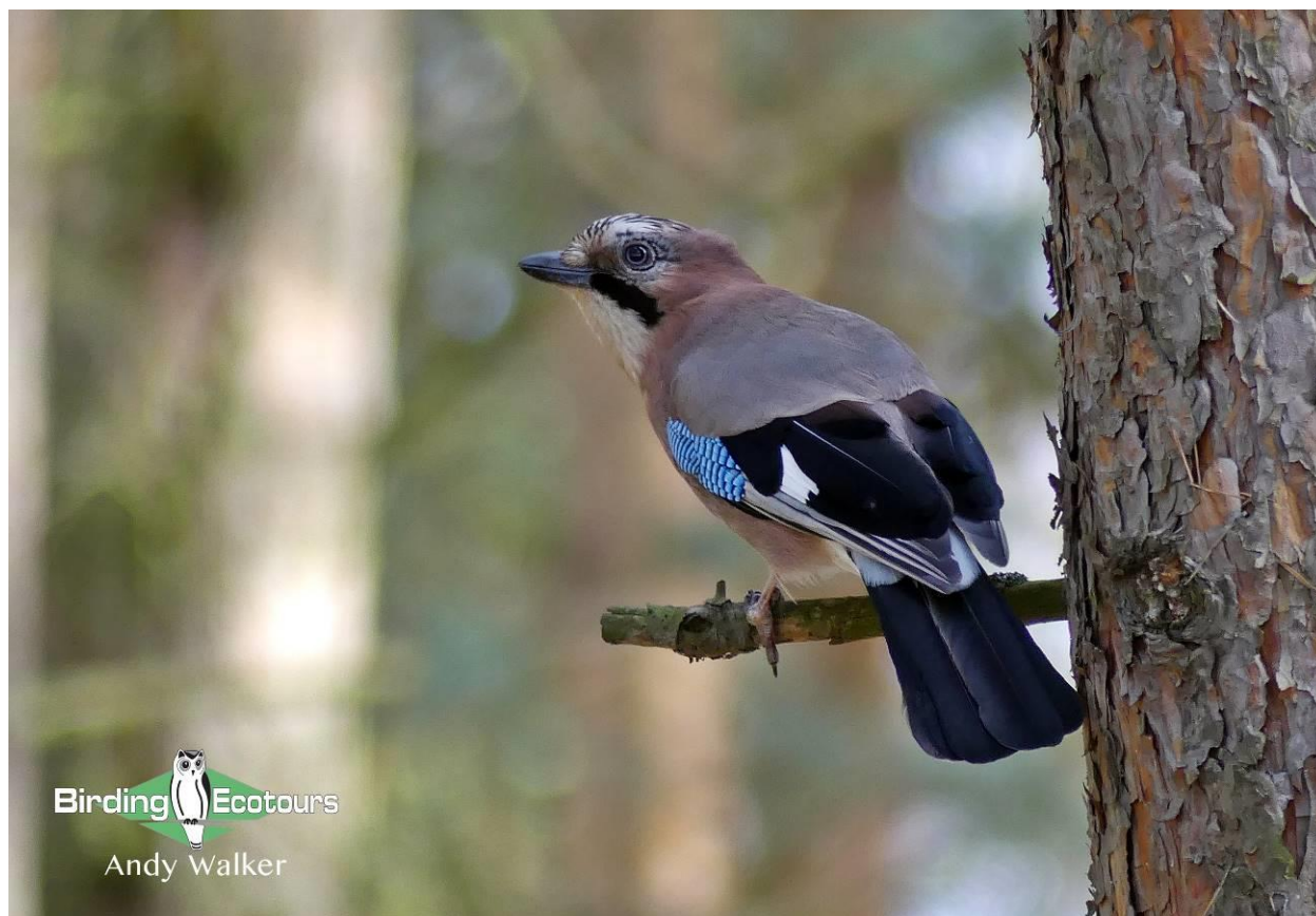
Very confiding Eurasian Jays were found along the Baltic Coast.

We went for an early morning walk in some wetlands and forest along the Baltic Coast, seeing many of the same birds as on the previous day, with a couple of new birds thrown in, such as Common Goldeneye and Willow Tit . A few birds gave nice photographic opportunities, particularly Eurasian Jay . Our walk through the alder/willow carr woodland was rapid due to the number of hungry mosquitoes, but we did note Eurasian Golden Oriole , Icterine Warbler , Lesser Whitethroat , Marsh Warbler , and Tree Pipit . A Common Cuckoo was lurking around the edge of the reedbed, presumably eyeing up the Eurasian Reed Warblers or Sedge Warblers , though the local Common Chaffinches were also very much on edge.