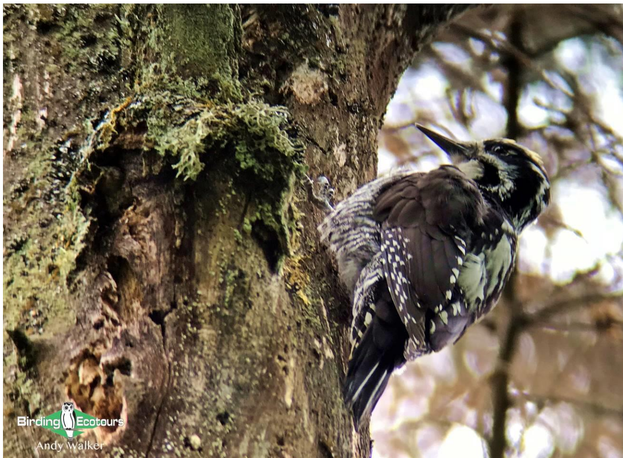
Eurasian Three-toed Woodpecker

After breakfast a forest walk gave us some fantastic views of a male Eurasian Three-toed Woodpecker ; we watched him for ages drumming on some very loud trees! Other birds seen in this area included European Crested Tit , a brief Black Woodpecker , Eurasian Sparrowhawk , and Red (Common) Crossbill . Unfortunately, Hazel Grouse remained a 'heard only' bird. The rain came down at lunchtime, so we spent some time relaxing in the hotel, listening to Song Thrush and Eurasian Golden Oriole singing in the rain!