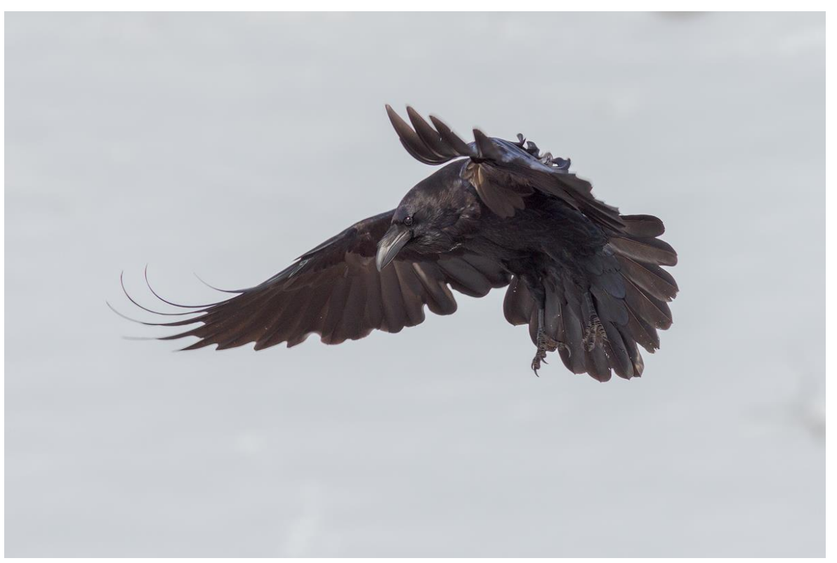
Raven in flight

year. We were up by 7 a.m. and did not lose any time for travelling so it was very convenient to sleep in the hide. At the end of day 3 our local driver came over to pick us up for a shower in a guest house at the foot of the mountains.