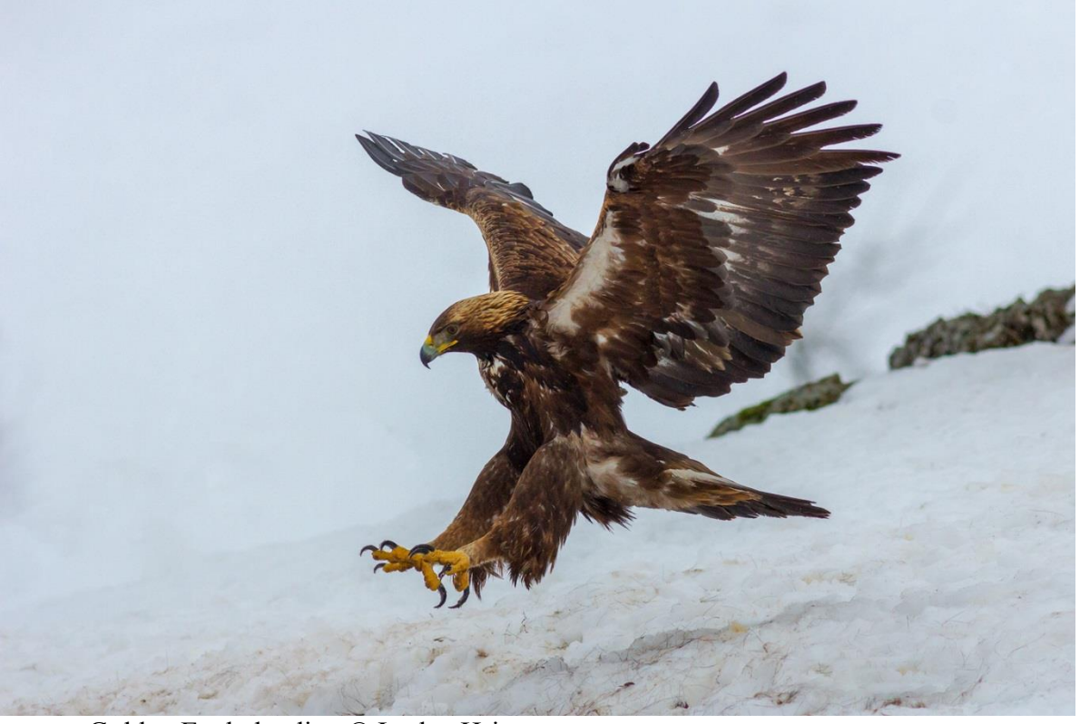
Golden Eagle landing