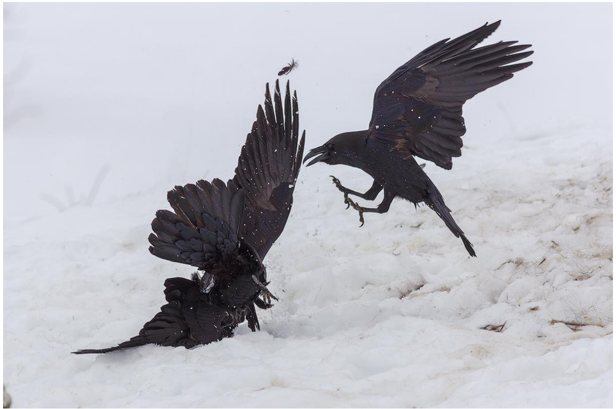
Raven dispute