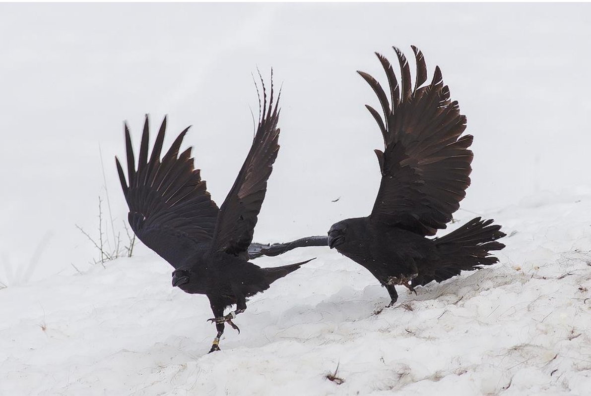
Raven's dance © Iordan Hristov