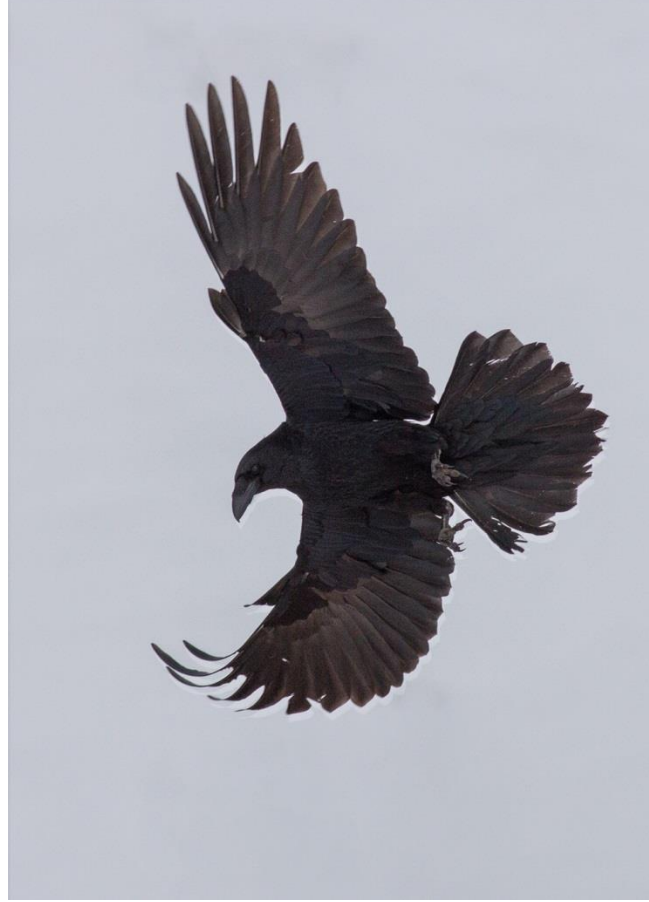
The flight of the raven