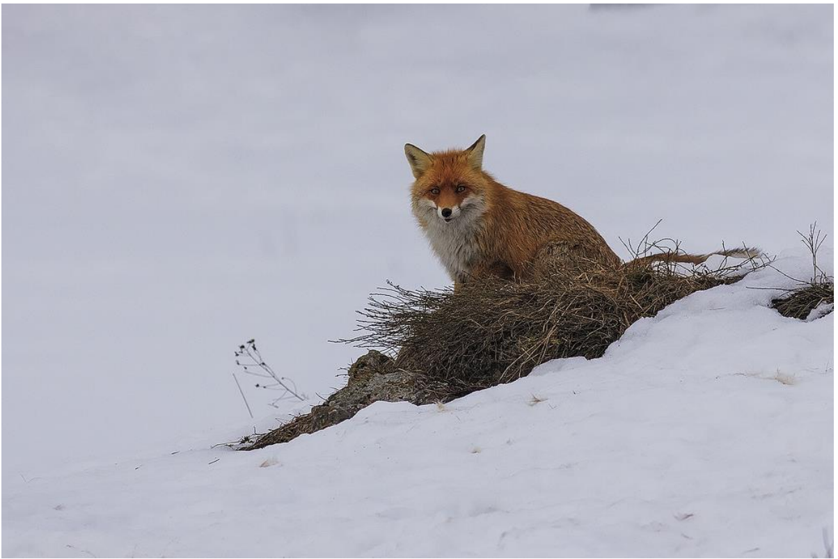
Red fox photography