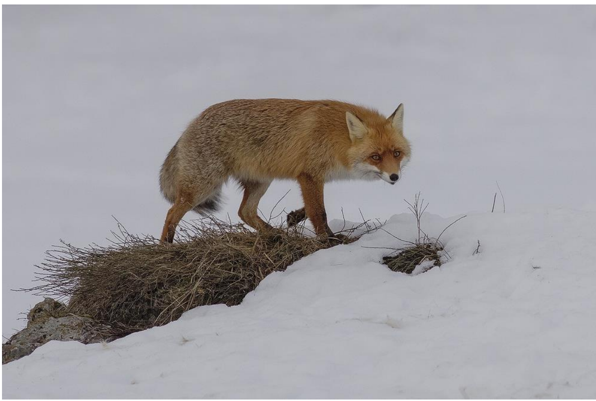
Red fox photography

As for the wolves, we could only see prints in the snow. Two-three animals are patrolling the area but we had no luck. Hopefully we will manage it next time!