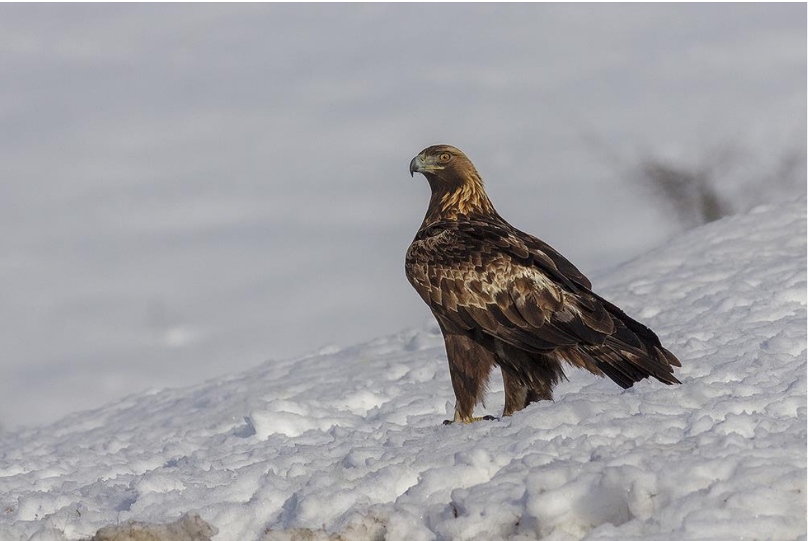
Golden Eagle portrait