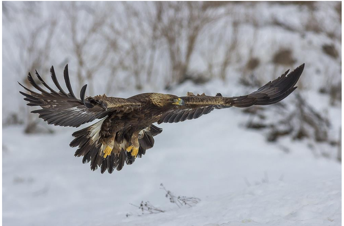
Golden Eagle landing