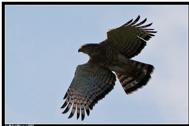
Southern Banded Snake Eagle

We then tried our luck at getting better views of the Livingstone's Turaco , which was a success, and also stumbled across a Yellow-rumped Tinkerbird nest.