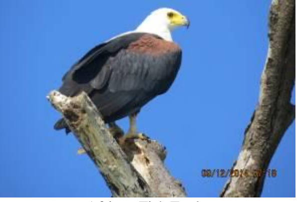
African Fish Eagle