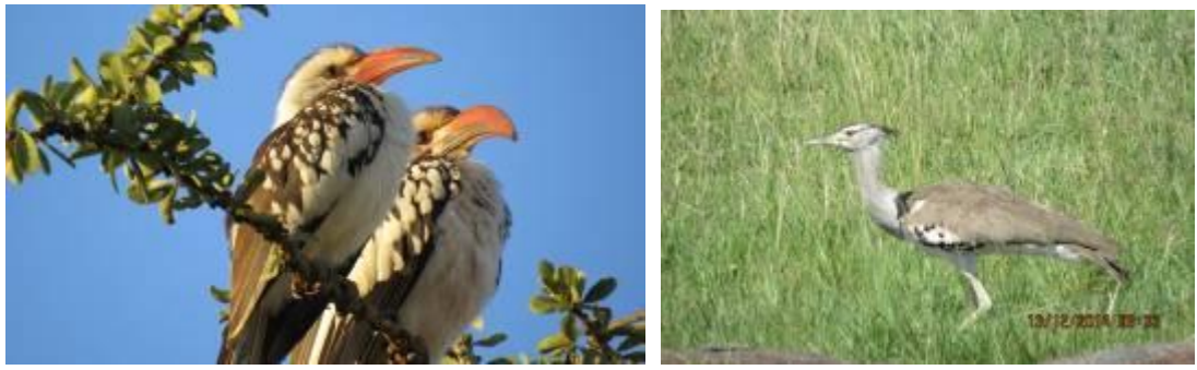
Northern Red-billed Hornbill