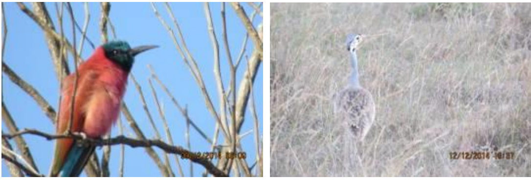
Northern Carmine Bee-eater