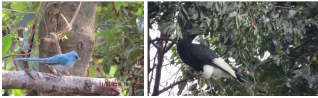
African Blue Flycatcher

The following day was spent hiking on forest trails. We started with the fish pond area, where we saw White-spotted Flufftail and Grey-winged Robin-Chat . A few meters south of the lodge along the main road we came across a flock of both Great Blue Turacos and Ross's Turacos feeding together in the same trees.