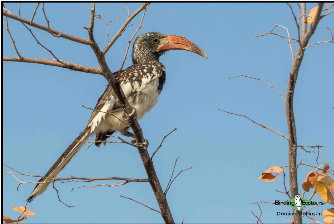
Monteiro's Hornbill was one of six hornbill species seen on this tour.

We then took a drive north along the coast to Swakopmund, stopping at the guano platform en route for a full suite of marine Cormorants ( Bank , Crowned , Cape , and White-breasted ), and then headed inland into the Namib Desert. In the desert bird numbers were really low; however, we did encounter a few extremely confiding Tractrac Chats and a small group of Gray's Larks (a Namibian near-endemic bird). Farther along we found good numbers of the impressive, desert-adapted plant Welwitschia mirabilis . After a long, successful day we enjoyed a seafood dinner before packing it in for the evening.