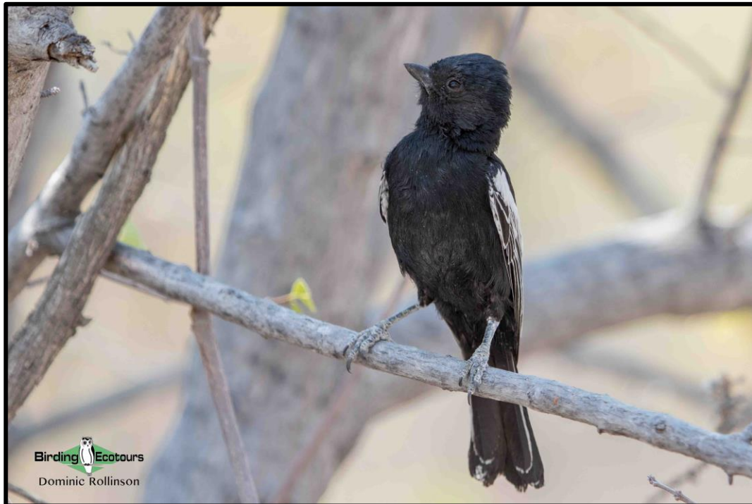
We had fantastic views of Carp's Tit in Etosha National Park.

This custom tour was put together for the Golden Gate Audubon Society and was designed to include a broad diversity of birds (including many Namibian near-endemics) and other wildlife. We traveled from the Namib Desert in the west to the panhandle of the Okavango Delta in the east. As the tour covered a good cross-section of Namibia and Botswana we also took in some truly impressive scenery and amazing African sunsets. We saw 296 species (and an additional four species were heard only) on this 12-day tour, including such highlights as African Pygmy Goose, Hartlaub's Spurfowl, Rüppell's Korhaan, Cape Gannet, White-backed Night Heron, Bank, Crowned, and Cape Cormorants, Ayres's Hawk-Eagle, Wattled and Blue Cranes, Burchell's and Double-banded Coursers, Rock Pratincole, African Skimmer, Burchell's Sandgrouse, Coppery-tailed Coucal, Racket-tailed Roller, Violet Wood Hoopoe, Damara Red-billed, Bradfield's, and Monteiro's Hornbills, Pygmy and Red-necked Falcons, Rüppell's Parrot, Carp's Tit, Gray's, Dune, Stark's, Karoo Long-billed, and Pink-billed Larks, Mosque Swallow, Rockrunner, Bare-cheeked Babbler, Orange River White-eye, and many others.