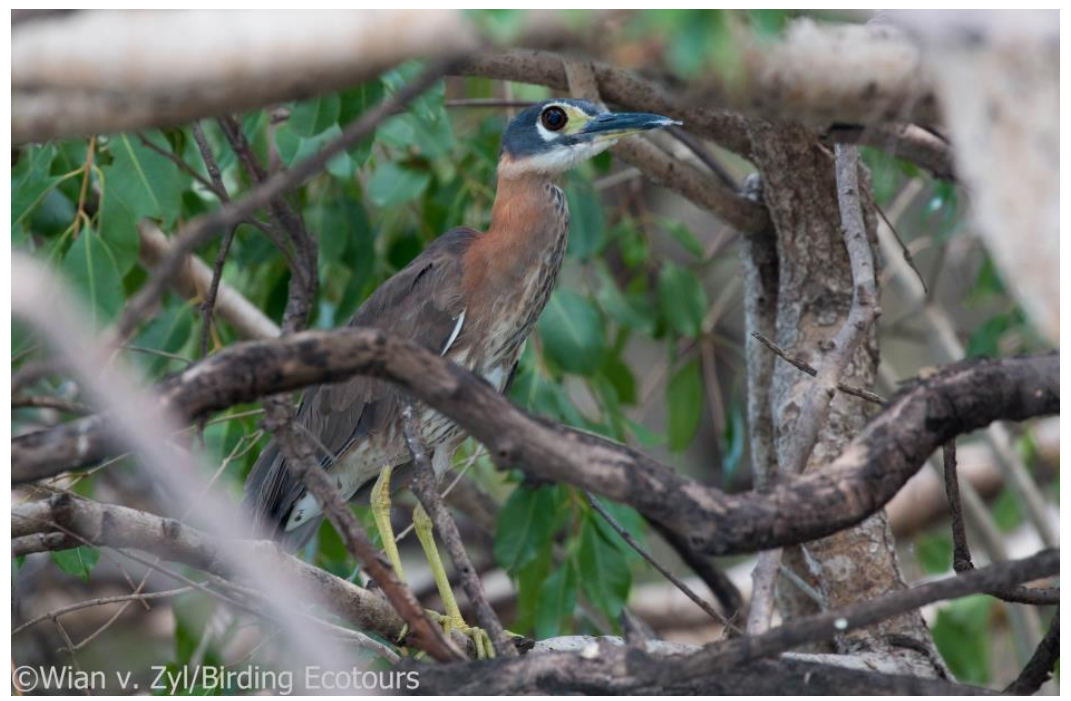
White-backed Night Heron

White-backed Night Heron, African Pygmy Kingfisher, Water Thick-knee, Rock Pratincole, African Darter, African Skimmer, Hadada Ibis, African Fish Eagle, Blue-cheeked Bee-eater, White-faced Whistling Duck, Common Greenshank, and Kittlitz's Plover among many others.