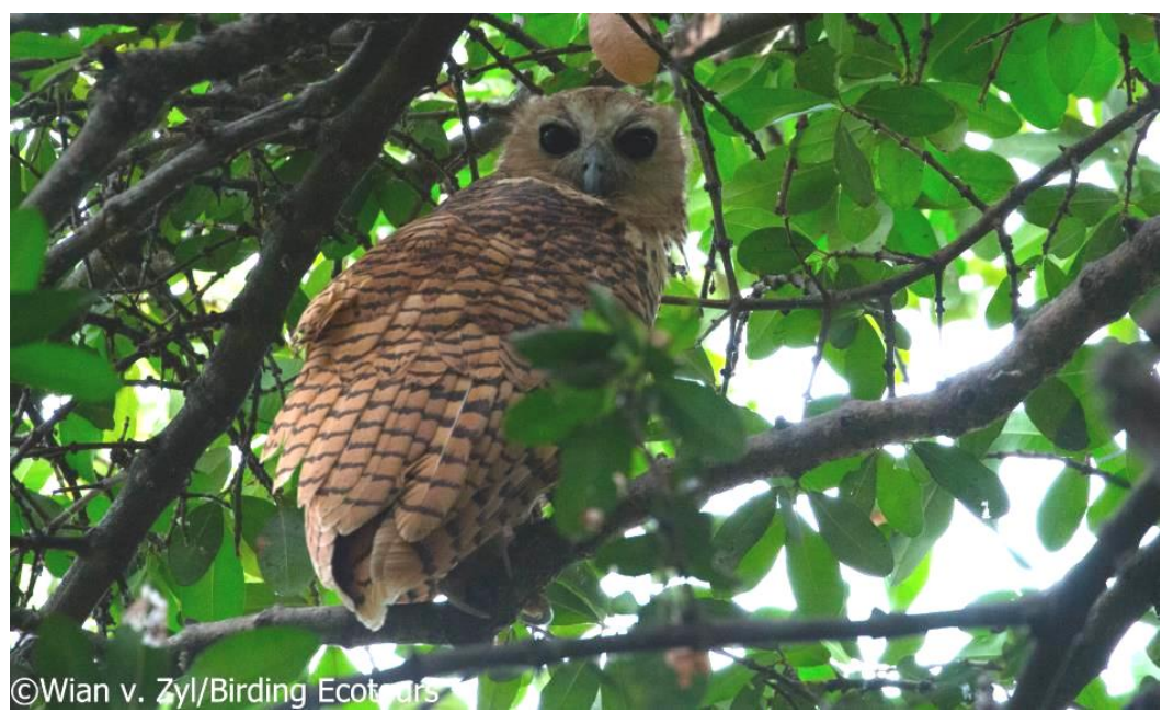
Pel's Fishing Owl

were Grey-headed Kingfisher, Collared Pratincole, Hamerkop, Black-winged Kite, Western Osprey, and brief views of Greater Swamp Warbler.