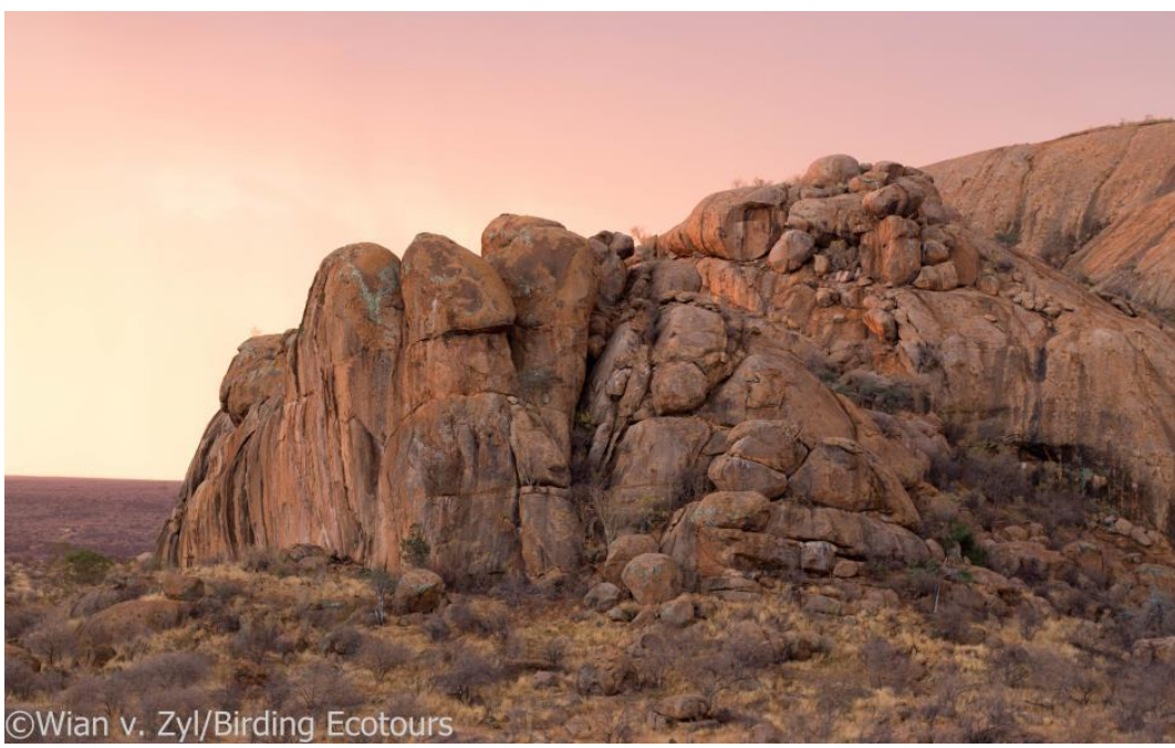
Central Namibia Escarpment