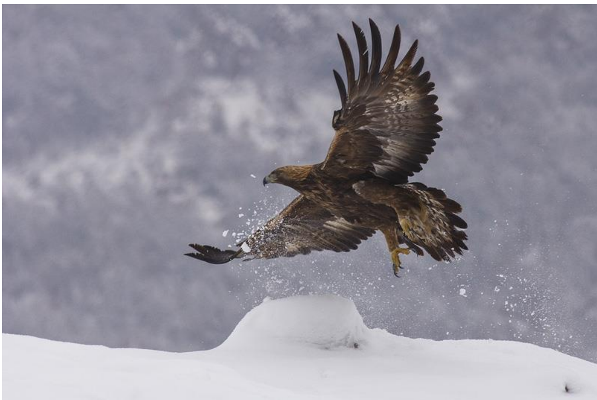
Golden Eagle hide photography