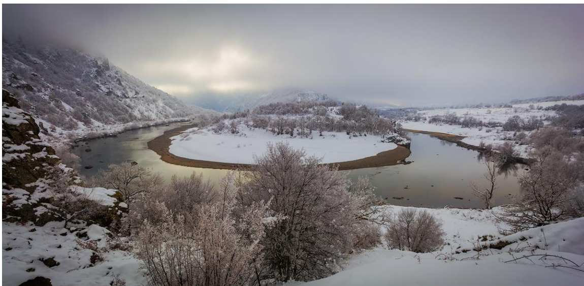
Arda river

Mist had closed the sky but creating very special atmosphere. Light was occasionally penetrating through the mist giving some nice rays.