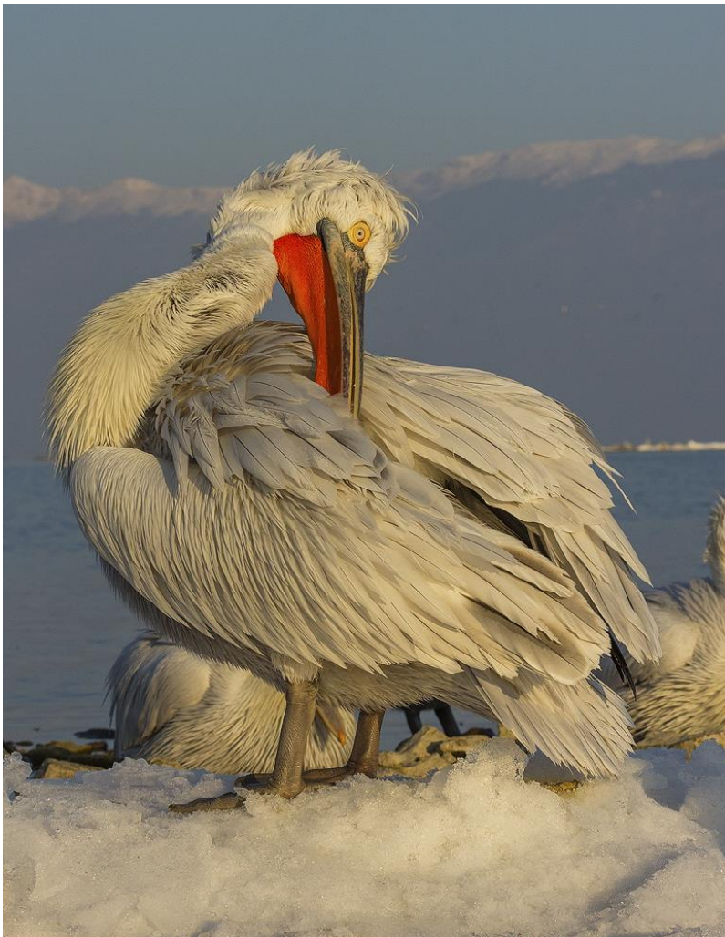
Dalmatian Pelican