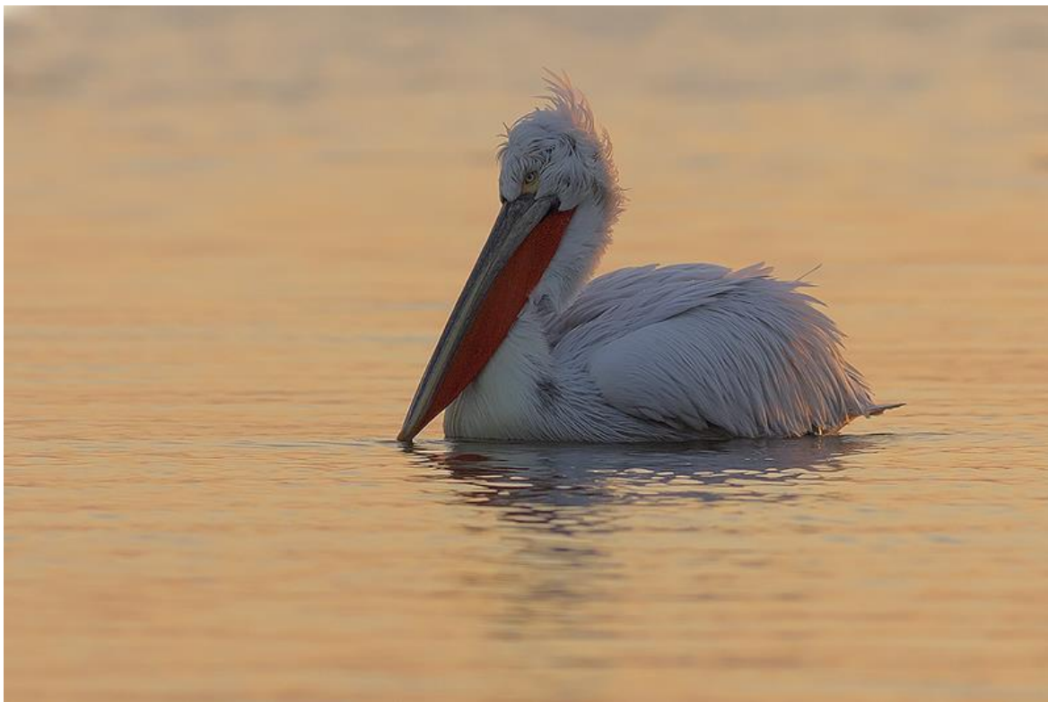
Dalmatian Pelican backlit