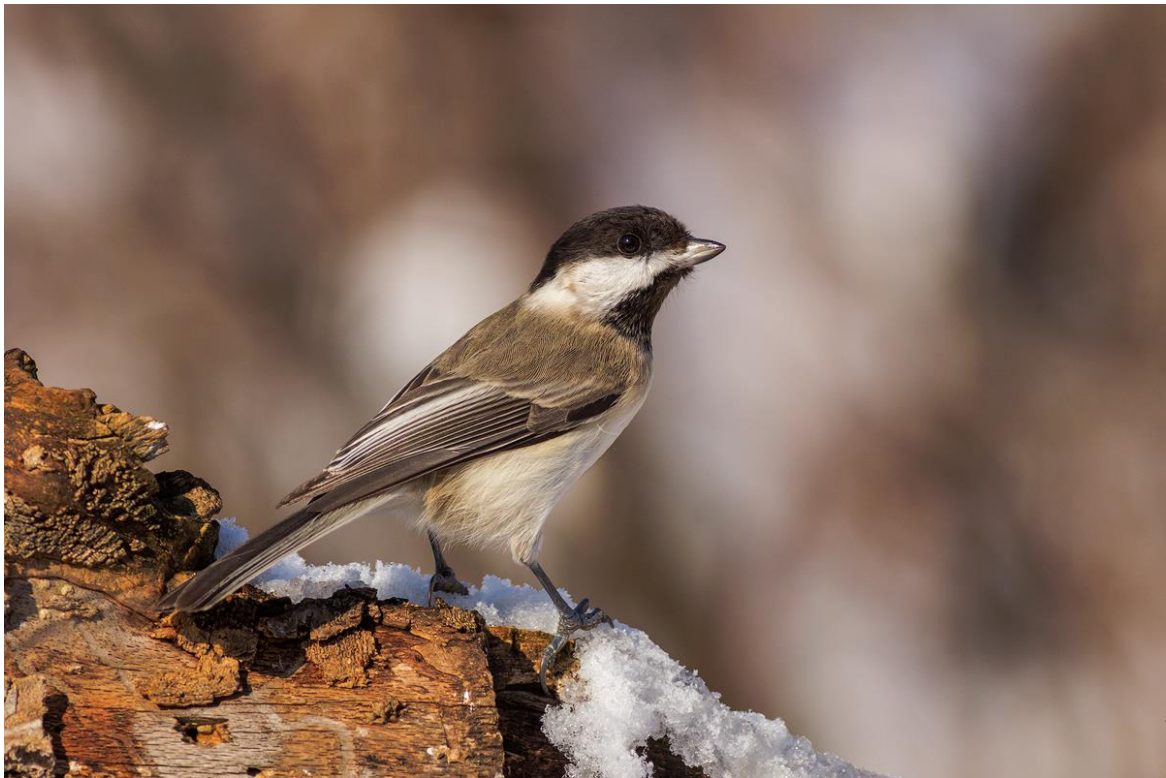
Sombre Tit

On the following morning we entered a small hide for garden birds and managed to take some good pictures of Sombre Tit, Syrian woodpecker, Brambling and some other more common birds. At lunch time we headed towards our pelicans.