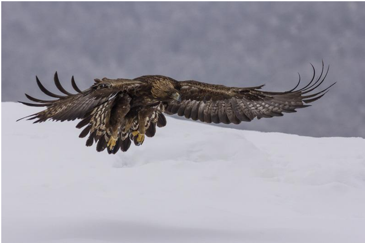
Golden Eagle landing

On the following day we wanted to do something else. We had enough of the Golden Eagles and our French photographers were happy to experiment with a new hide made for birds in flight. Another early start for an exciting day and the alarm clocks rang at 4,30 a.m.! In an hour we arrived in a very cozy hide with a large panoramic one way mirror window allowing us to observe the whole area. The hide was on the top of a small mount allowing birds of prey to circle around it. For the day we had a group of 15+ Griffon Vultures and some distant views of Common Buzzard but not many pictures. Anyway, we were very happy with the eagles from the previous day. Everyone was very excited.