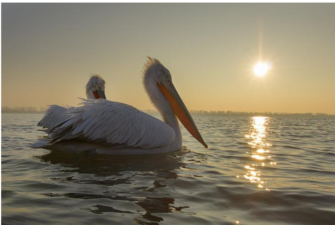
Dalmatian Pelican at first light