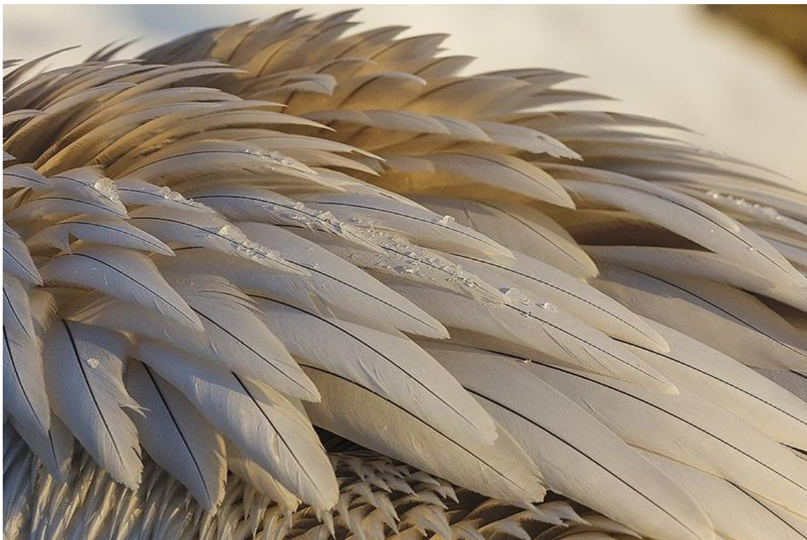
Dalmatian Pelican feathers