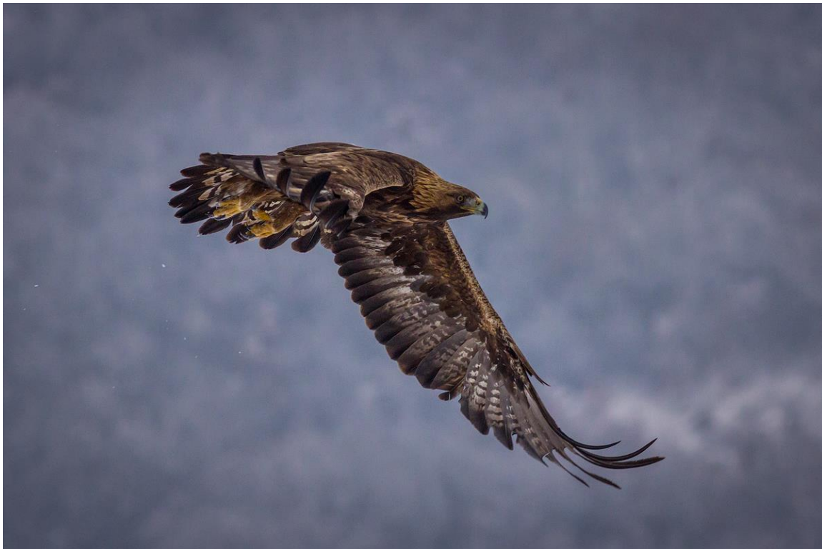
Golden Eagle hide photography © Iordan Hristov

On the following day we had to enter and exit the hide in the dark. It was going to be a full day full of excitement. We had all the three birds landing at different times, two birds together, calls of the juvenile bird and very active behavior. We got what we wanted and still had a spare day.