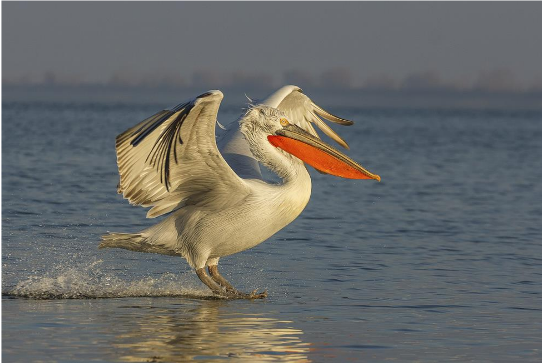
Dalmatian Pelican © Iordan Hristov