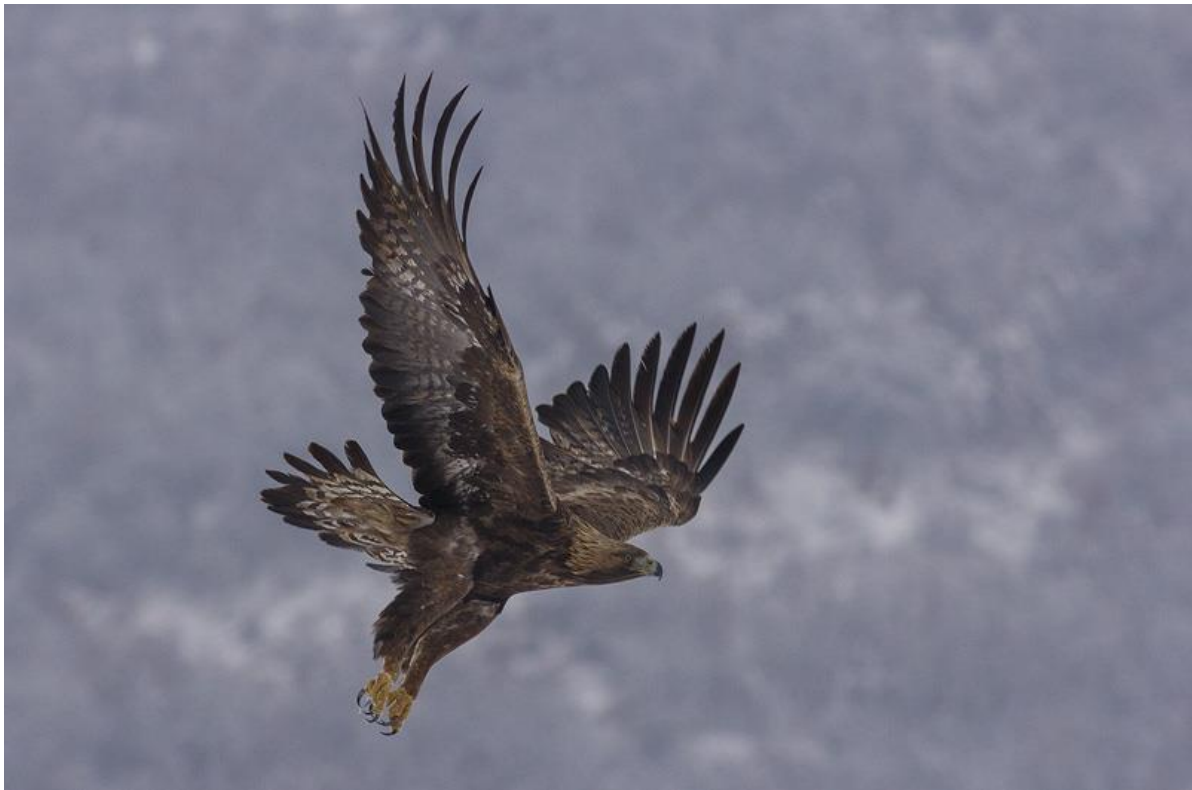
Golden Eagle flight