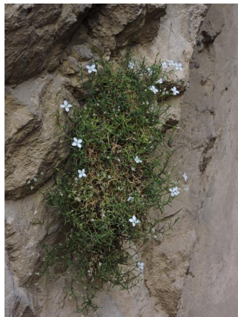
Moehringia tommasinii at one of only three sites.

There were some birds to see, especially on the first pools, including wigeon , ruff , the only common snipe(s) of the holiday, pygmy cormorants and, particularly beautiful, a flock of about 25 great white egrets , most with the 'aigrettes' that were almost their downfall a century-and-a-half ago and in breeding plumage and some already with the red legs associated with breeding birds. Again there were house martins present and the very early March arrival now seems standard practice for these birds.