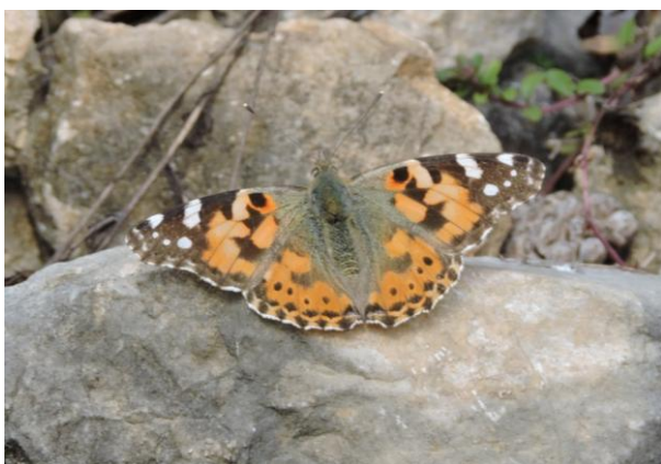
A painted lady: a surprise arrival close to the hotel (PT).

After breakfast a tour of the area around the hotel was in order. A brief stop at the large rock behind the hotel seemed to yield a wallcreeper, it was, after all, a bird climbing about on the rockface, flicking its wings, but it was not to be, just a blue rock thrush and the only red visible was Paul's red face! After brief views of a Eurasian nuthatch and a calling short-toed treecreeper we encountered a territorial fight between three lesser spotted woodpeckers that included the strange, slow bat-like courtship flight that this species engages in at this time of year. Both green and grey-headed woodpeckers were heard but not seen and a hawfinch gave brief views and a small flock of house martins visited the colony on the nearby aqueduct pump-house.