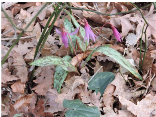
Dogstooth violets, a rare species in the Karst (PT).

Finishing the loop around the lake, we began to cross the old flood plain or polje . There was a lot of bird activity in a cultivated field on our right and a cursory check revealed chaffinches and tree sparrows , a flock of about 40 linnets together with large numbers of starlings and a dozen or so fieldfares . Fieldfares are common breeders around the lake but unlike mistle thrushes (also seen) they do not defend winter territories and wander locally, mixing with members of the same species that arrive from further afield.