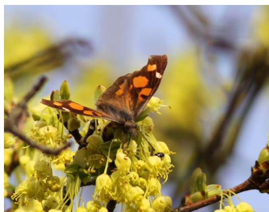
A nettle-tree butterfly feeding on the spring flowers of Montpelier maple (MK).

Making the climb up to the quarry yielded a singing male cirl bunting and, in a small suntrap with a willow bush or two in flower, several butterflies including at least four painted ladies , a couple of peacocks , a nettle-tree butterfly , a clouded yellow and a brimstone together with a couple of violet carpenter bees , a wall lizard (but which species?) and a hummingbird hawkmoth which posed nicely on a rock. Not something you usually see later in the year when it is warmer. Large numbers of migrant Lepidoptera had passed through Malta three days earlier and the painted ladies were probably the vanguard of a much wider invasion. Unfortunately, when we arrived up at the quarry there were no wallcreepers to be seen and we consoled