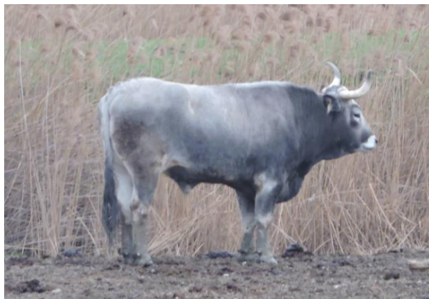
A symbol of Istria, the Istrian Ox or Podolica type Boškarin

Crossing back into Italy, we headed towards the Lake of Doberdò in a final but ultimately vain search for Black Woodpecker. Along the way the first barn swallows of the year crossed the road in front of the van. Again the wind was blowing hard and keeping all the woodpeckers out-of-sight and completely out-of-earshot. Cutting our losses we headed towards the nature reserve of Isola della Cona, a huge wetland reserve (2,200 hectares) at the mouth of River Isonzo.