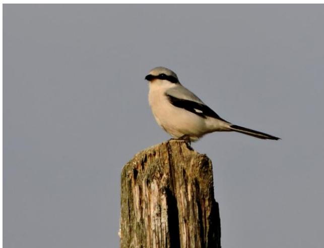
Lots of Great Grey Shrikes were seen during the week (PT).

The lake was extremely high. Up to the level of the road in places, and any birds that there were ( coots , great crested grebes , pochards , tufted ducks and a flock of five ferruginous ducks , were 'diluted' across about 30 square kilometres of shallow water. Arriving at the imaginatively named island of Otok (meaning 'island' in Slovene) we walked around a nice patch of mixed woodland dotted with clearings. Even though it was windy there were a few birds including nice views of marsh tit , goldcrest and, finally, a decent view of a grey-headed woodpecker , admirably photographed by Mike Kempton in spite of the very poor light conditions, and showing its strange reptilian character (see cover picture).