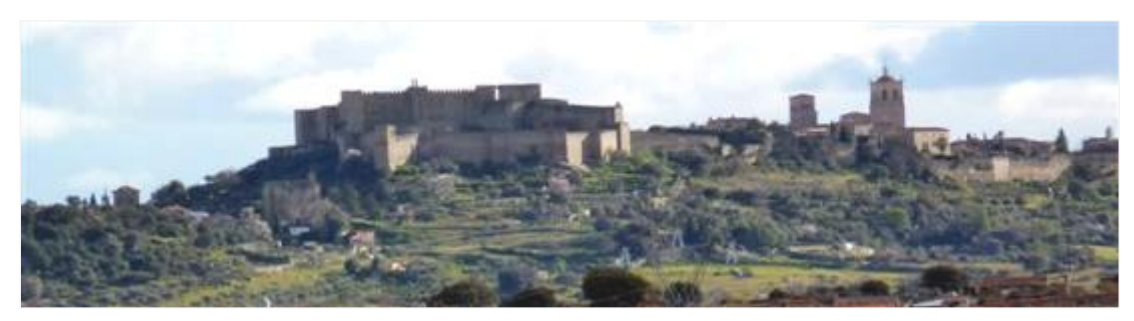
Trujillo from the granite Berrocal.

Heading east, our luck was in again as a great spotted cuckoo flew through the scrub on the right of the minibus. We stopped to search for it: Howard seemed to have a great knack of finding wherever it perched in the mixed cork oak and retama scrub. A little farther along the same road we paused to admire a large flock of Spanish sparrows on fence wires and bushes. Our final stop was in the Berrocal , the area of granite outcrops on which Trujillo is built. Pink patches of storksbill were as expected, but Mavis also found some early blooms of the unusual star-of-Bethlehem Ornithogalum concinnum .