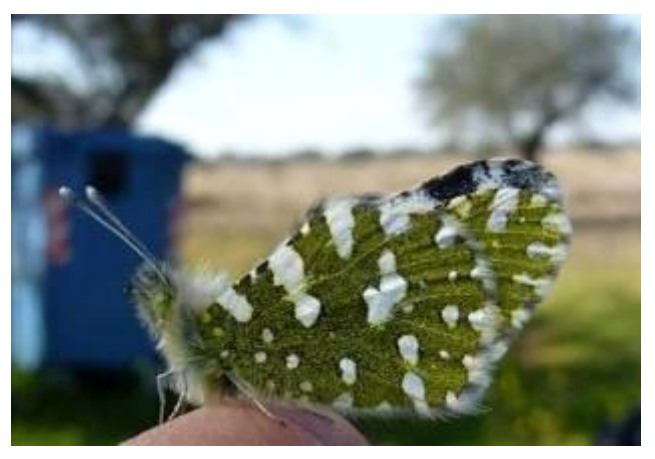
Western dappled white