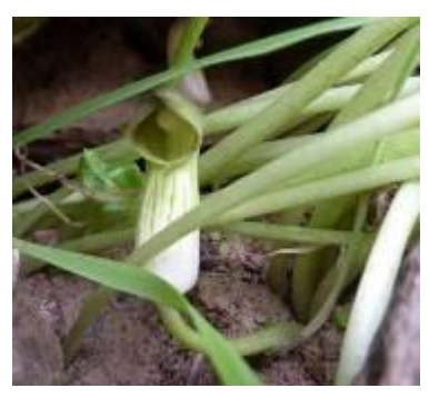
L to R: Wall pennywort (navelwort) growing in a cork oak's bark at the Finca; henbit deadnettle; friar's cowl Arisarum simorrhinum

It was my first visit to the new reservoir at Alcollarín, and what a great place it is – and very easy to enjoy. The first small car park was right by the dam wall, and immediately there were dozens of great crested grebes, lots of black-headed gulls and many hundreds of shovelers on the water. Close in there were noisy dabchicks and better still were three black-necked grebes: the one we had in the scope showed its fiercely red eyes. Crested larks foraged on the stony ground in front us, and other birds putting in an appearance included stonechats, black redstart, several chiffchaffs and the greenest of greenfinches. There was a constant movement of white wagtails over the water and two marsh harriers came past from opposite directions.