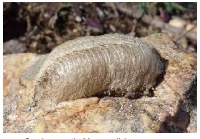
Praying mantis Mantis religiosa egg case