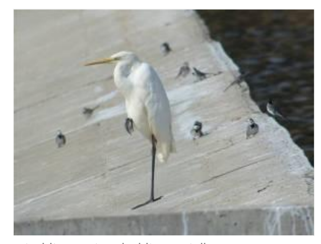
Birdwatching at Alcollarín reservoir; great white egret and white wagtails.

We returned along the reservoir's side and drove over the dam wall and as far as the track allowed along the other side. On this side were heard then found wigeons, a dozen or so shelducks and couple of pintails, though the best sighting was probably a dense and mobile flock of Spanish sparrows. We returned across the dam where a swallow and a crag martin flew over us.