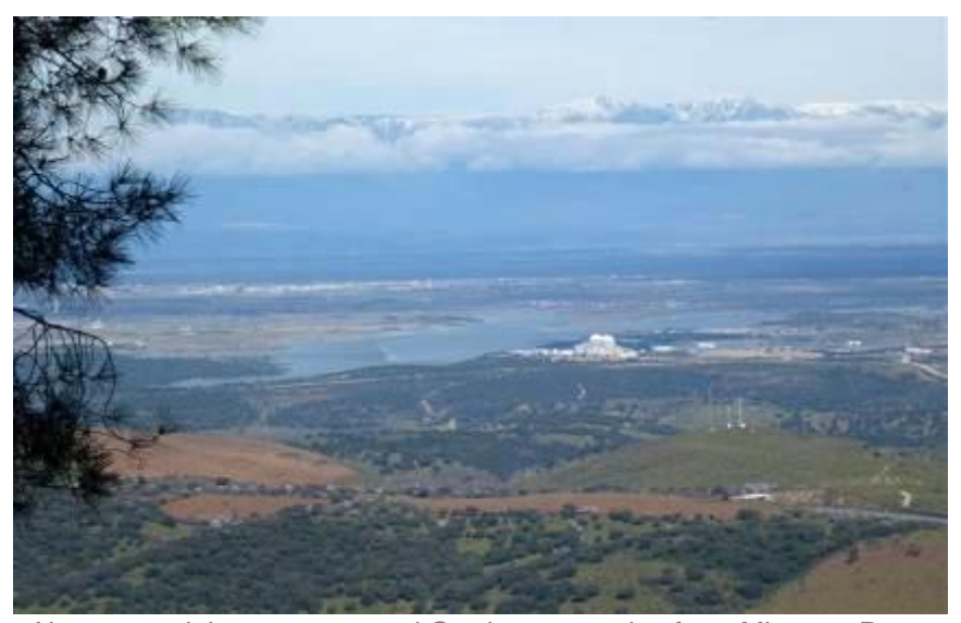
Almaraz and the snow-capped Gredos mountains from Miravete Pass.

Three lesser spotted woodpeckers together before breakfast highlighted what a remarkable week it had been for this species that is now so hard to find in the UK.