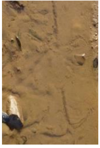
Cranes, and crane footprints in a puddle.