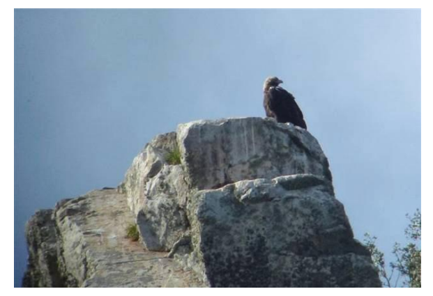
Azure-winged magpies are returning to the picnic site in Monfragüe NP. Spanish imperial eagle.

Our final stop was at the Portilla del Tiétar, another impressive set of cliffs beside the flooded Tajo. Alongside the road were dozens of pale yellow angel's tears narcissi: in the scrub were flowering pink-coloured Spanish heath and rosemary. There were the inevitable griffons and two high-flying black storks and we found the tiny crucifer shepherd's cress. Then an eagle flew in: a fine Spanish imperial eagle landed on a rock on the top of the Portilla del Tiétar, allowing lots of time for excellent views for everyone. After enjoying another distant blue rock thrush, and once Jan had enthused some local visitors about the eagle, we set off back towards home. There were a few cranes in the dehesa along the way.