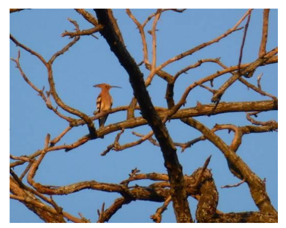
First light at the Finca: a lesser spotted woodpecker and a hoopoe in the same tree.

The drive north took us through the granite berrocal north of Trujillo then extensive dehesa under which we saw the complete set of livestock: pigs, cows, sheep and goats. Averil caught sight of a black-shouldered kite, as did Mavis on the return journey.