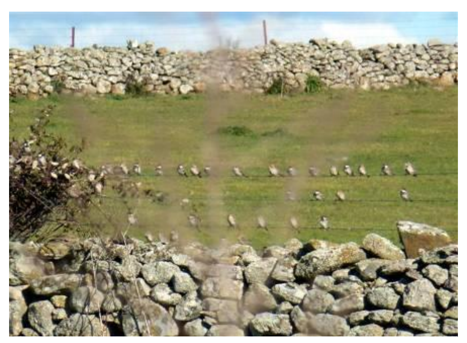
Spanish sparrows – a holiday highlight.

We stopped at a service station to fill the minibus's tank and grab a quick coffee, and were soon back at the airport with a splendid week and 1302 kilometres behind us. There was time to drop bags and eat our picnics before going though security for a smooth and on-time easyJet flight home.