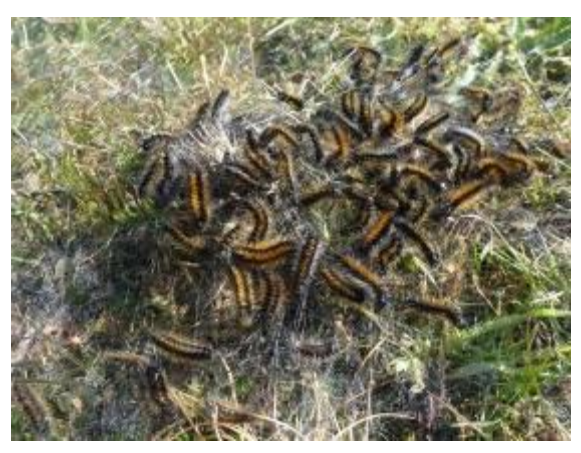
Caterpillars of the tiger moth or winter webworm Ocnognyna boetica

Pine processionary moth Thaumetopoea pityocampa tents