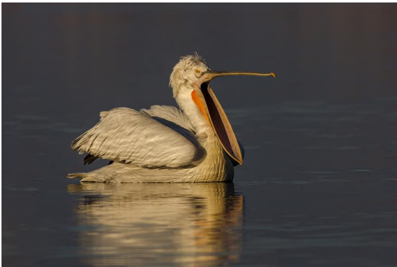
Dalmatian Pelican