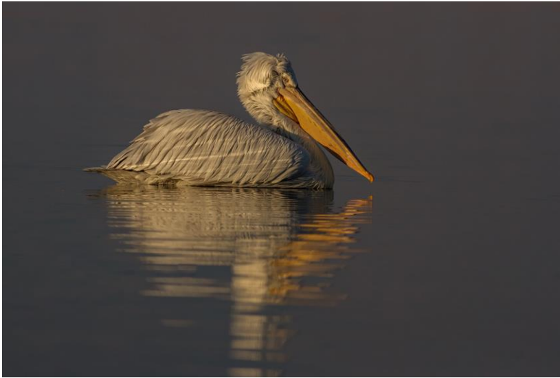
Dalmatian Pelican