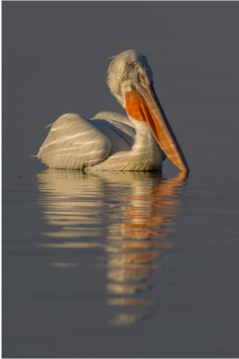
Dalmatian Pelican