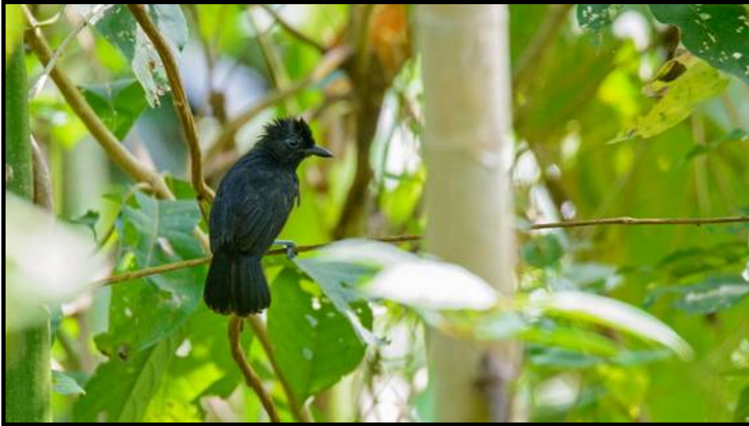
Black Antshrike