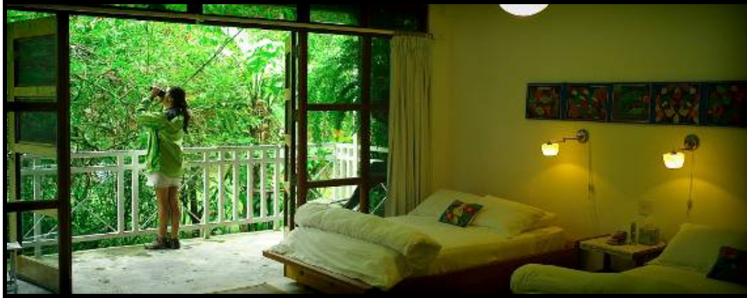
Canopy Lodge

Our time in the Canopy Family lodges ended, and we took a flight to the Bocas del Toro Province in the northeast of the country. Our next task was to investigate a new place called Tranquilo Bay Eco Adventure Lodge, which is supposed to hold a large list of birds and whose owner, Jim Kimball, had generously been inviting us for the last two years. We didn't have much information, only that the place was located on Bastimentos Island in the Bocas del Toro archipelago and could harbor birds of the Caribbean rainforest and mangrove specialists.