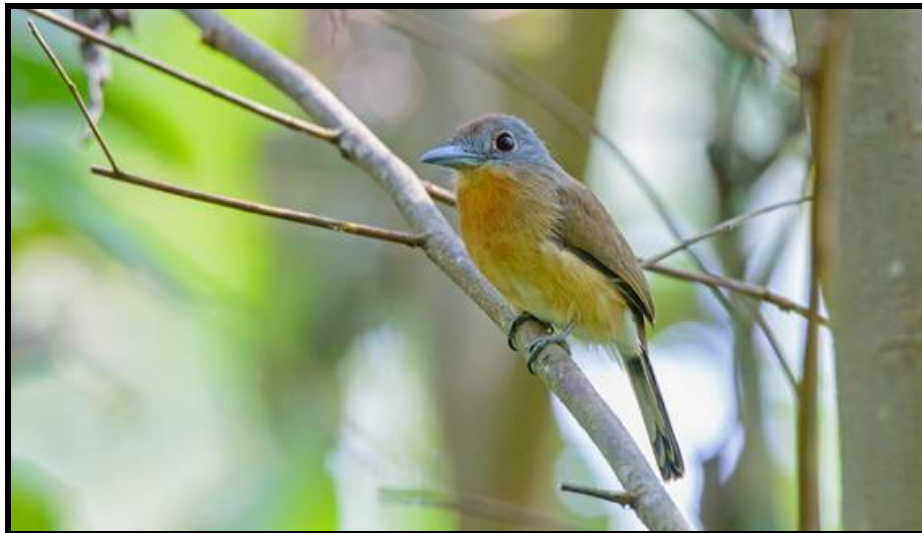
Grey-cheeked Nunlet

Grey-cheeked Nunlet Nonnula frontalis Excellent views along the El Salto Road in the Darien. A near-endemic, found in Panama and Colombia