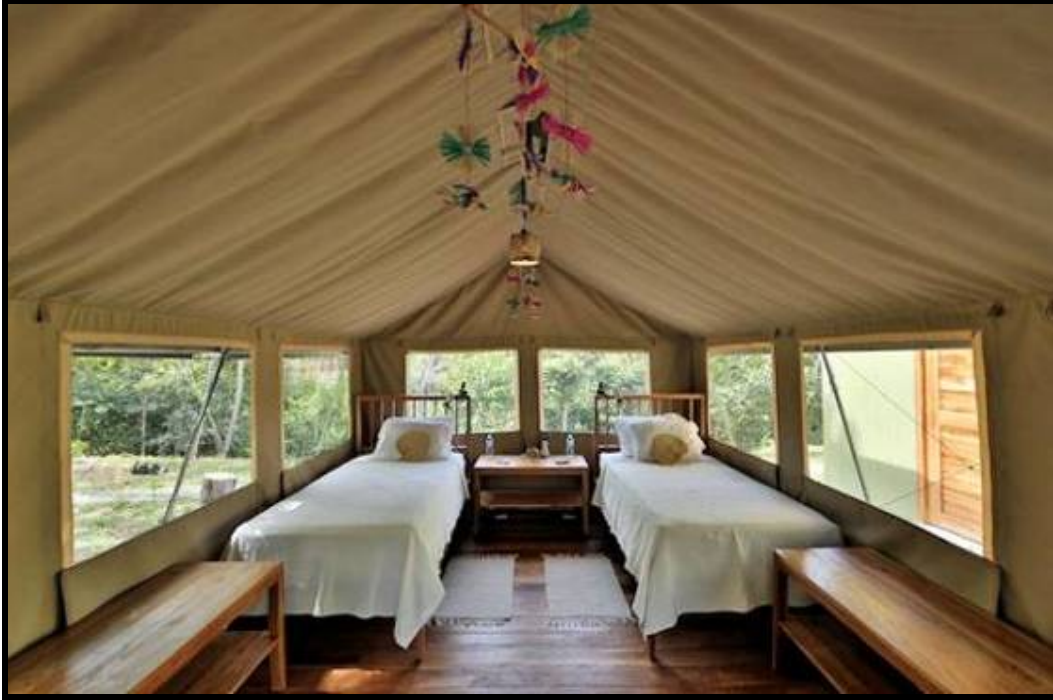
Canopy Camp

Pirre Mountain in search of Panamanian endemics, but today the airstrip in Cana has been abandoned, and there are no logistics at all. We spent three nights and four days in the Darien, using the camp as our base to explore the surroundings. We were happy with Canopy Camp, and we think that many of our clients will love it.