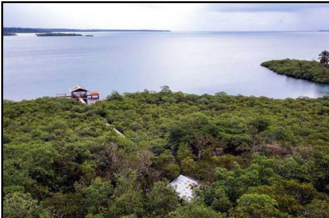
Tranquilo Bay