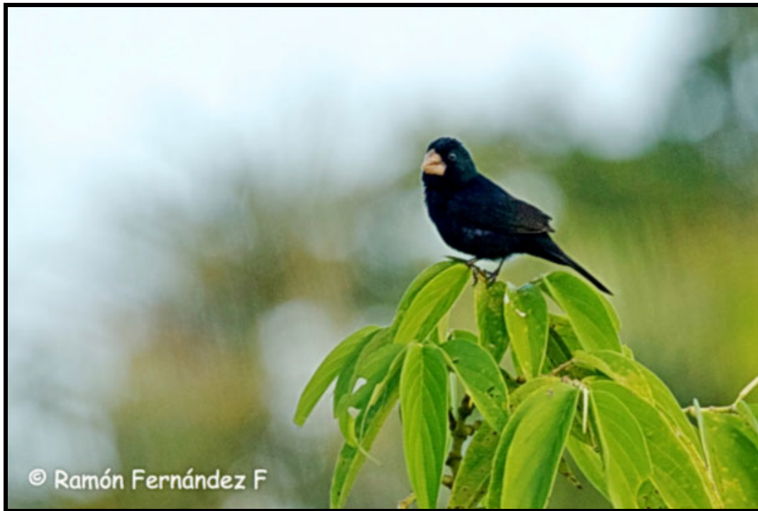
Nicaraguan Seed Finch

Nicaraguan Seed Finch Oryzoborus nuttingi Awesome views of this regional endemic during the boat ride through the Tranquilo Bay canal. One of the targets in Bocas del Toro. Found from Nicaragua to W Panama