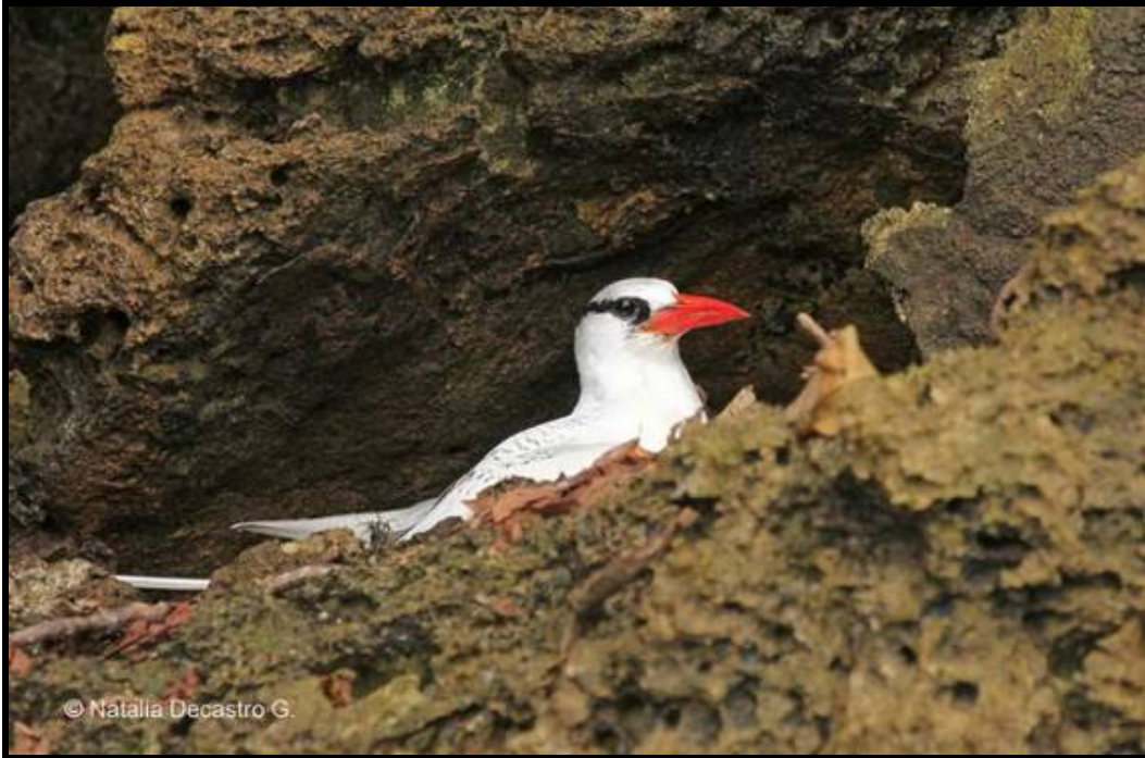
Red-billed Tropicbird