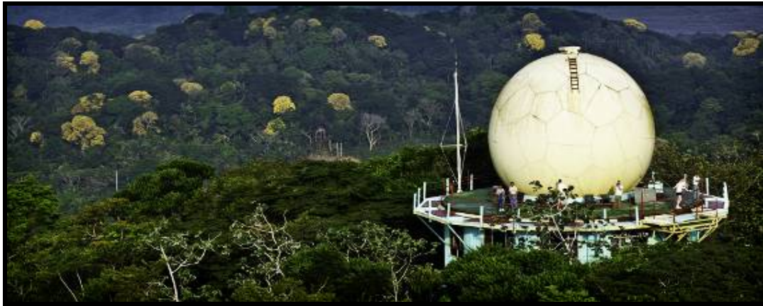
Canopy Tower

Birding Ecotours had the opportunity to return to Panama this year as part of a scouting trip to visit the Canopy Family lodges with the main idea to create a tour which can mix the three main accommodation facilities they have. The famous Canopy Tower was built in 1965 by the US Air Force to house powerful radar used in the defense of the Panama Canal. The tower played this role until 1995 and in 1999 was converted into a lodge for ecotourism and birdwatching. With its 360° view from the top of the tower the views of the Soberanía National Park are truly outstanding. Guests are able to visit the tower at dawn before breakfast and are enchanted by the calls of Slaty-backed and Collared Forest Falcons and views of Brown-hooded Parrot , Red-lored Amazon , Blue-headed Parrot , Green Honeycreeper , Plain-colored Tanager , Red-legged Honeycreeper , and with luck and persistence even the elusive Green Shrike-Vireo . We used the lodge as a base for a total of three nights, which allowed us to explore all its surroundings, including famous birding spots like the Pipeline Road and Summit Ponds.