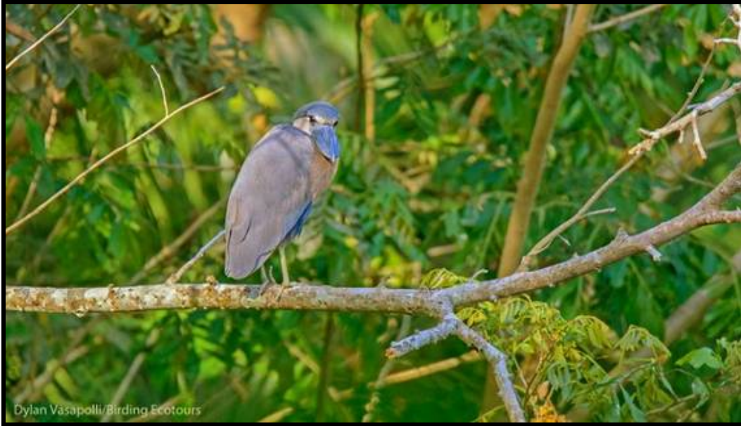
Boat-billed Heron