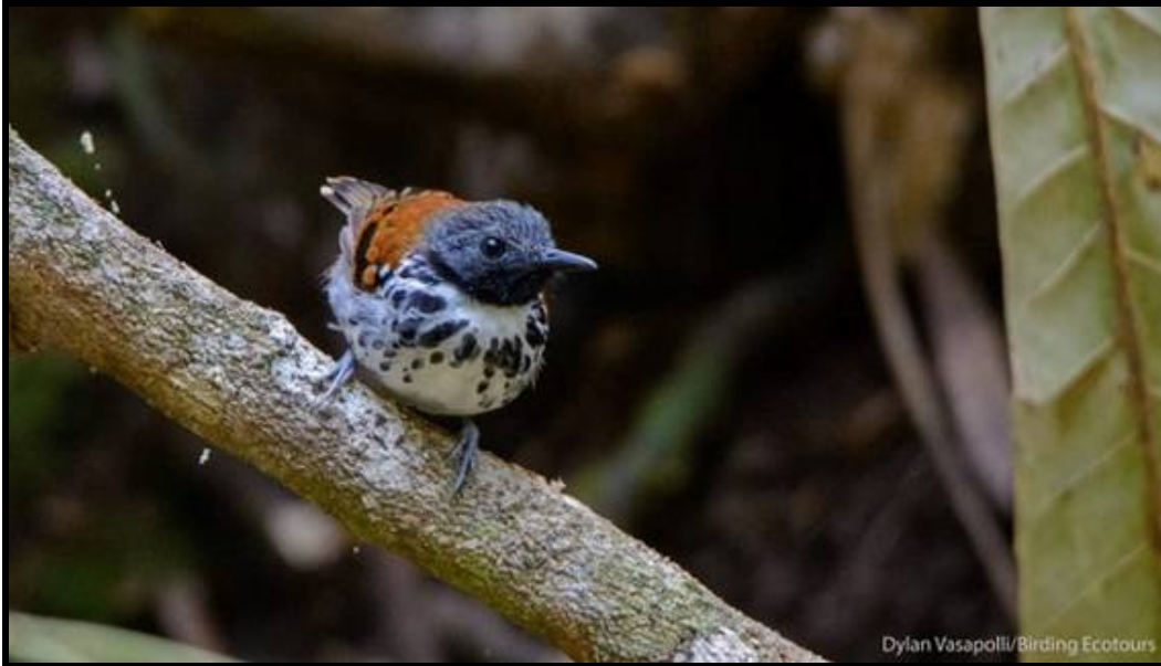
Spotted Antbird