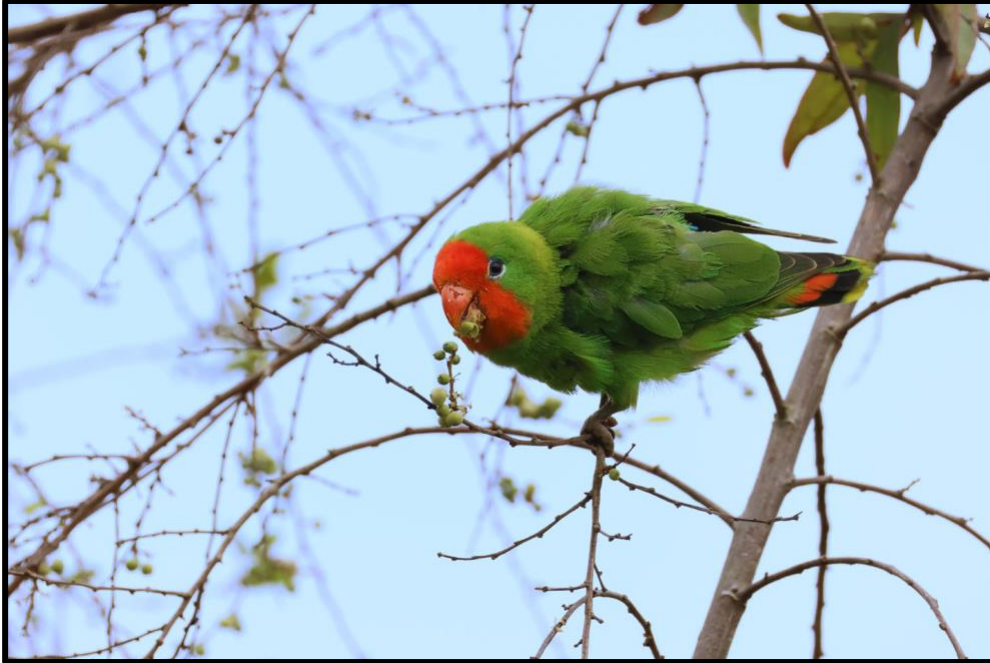
Vibrant Red-headed Lovebirds gave us stunning views at the boat launch area

Returning to the boat launch, we were greeted by a Grey Crowned Crane flying low overhead, after which we disembarked and had our breakfast at the launch site, attempting (and failing) to not get distracted by the hive of bird activity around us. Some notable mentions from around the boat launch included Brown-throated Wattle-eye , Red-chested Sunbird , Black-headed , Black-necked , Village and Slender-billed Weavers , African Blue Flycatcher , Klaas's Cuckoo , Angola Swallow , Northern Grey-headed Sparrow , African Pied Wagtail , Green White-eye , Superb Sunbird , Black-and-white Mannikin , the skulking Grey-capped Warbler and a group of vivid Red-headed Lovebirds . After breakfast, we made our way towards the ferry that would take us back to Entebbe across one of Lake Victoria's bays. We made a few stops en route to the ferry port, which got us Black-and-white Shrike-flycatcher , Red-faced Cisticola , Yellow-fronted Tinkerbird , Western Banded Snake Eagle , White-browed Coucal , Striped Kingfisher , Red-shouldered Cuckooshrike , Green-throated Sunbird , Green Crombec and Village Indigobird .