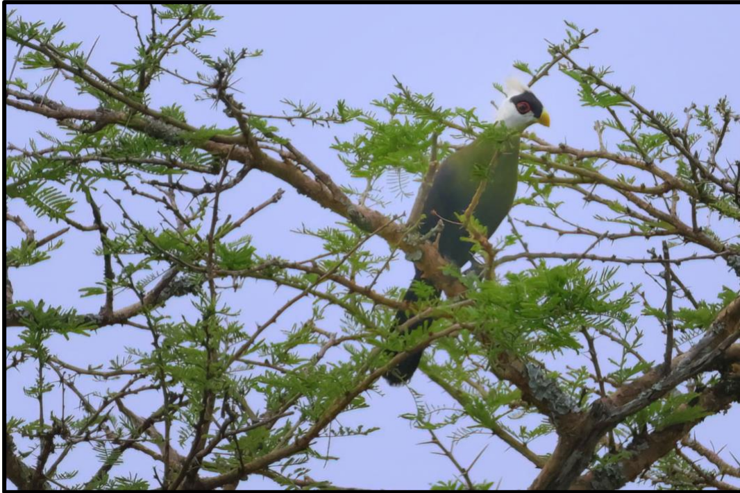
We were treated to multiple White-crested Turacos at Ziwa, truly spectacular birds!

Wood Hoopoe, Gabar Goshawk, African Grey Hornbill, Black Cuckooshrike, Northern Puffback, Black-headed Gonolek, Meyer's Parrot, Double-toothed and Spot-flanked Barbets, African Pygmy Kingfisher and the dashing White-crested Turaco . Leaving the reserve was also a difficult task, as there was good birding all along the entrance track. We were treated to brief views of a family of Abyssinian Ground Hornbills as we were driving towards the gate, while the village farmlands outside the gate delivered Black-winged Bishop, Crimson-rumped Waxbill, Beautiful Sunbird, Red-cheeked Cordon-bleu, White-headed Barbet and Blue-spotted Wood Dove .