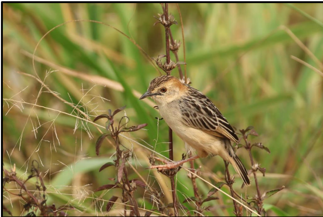
Stout Cisticolas abound in the grasslands in Queen Elizabeth National Park.

We decided to have another go at birding the entrance road into Bwindi from Buhoma to try rack up some more forest species. It was cloudy and relatively quiet, but we managed to get some notable species like White-tailed Ant Thrush , Plain Greenbul , Many-colored Bushshrike , Pink-footed Puffback , Sooty Flycatcher , Fraser's Rufous Thrush , African Broadbill (including one at a nest) and a female Bar-tailed Trogon . Before leaving Buhoma, we stopped at a nearby African Wood Owl roost and also visited the Buhoma pangolin rescue center. This center is home to a number of Common African Pangolins that have been rescued from poachers and are being rehabilitated back into the forests in Bwindi. Although they weren't wild, it was still fascinating to witness these strange scaly mammals in real life, and to support such an imperative local conservation initiative. Birding around the pangolin center was also quite enjoyable, with Blue-spotted Wood Dove , White-chinned Prinia , Ross's Turaco , Cinnamon-chested Bee-eater , African Harrier-Hawk and Mackinnon's Shrike all in evidence. We made one last stop in the Buhoma farmlands before reaching the main road, where we had great views of a singing Red-throated Wryneck .