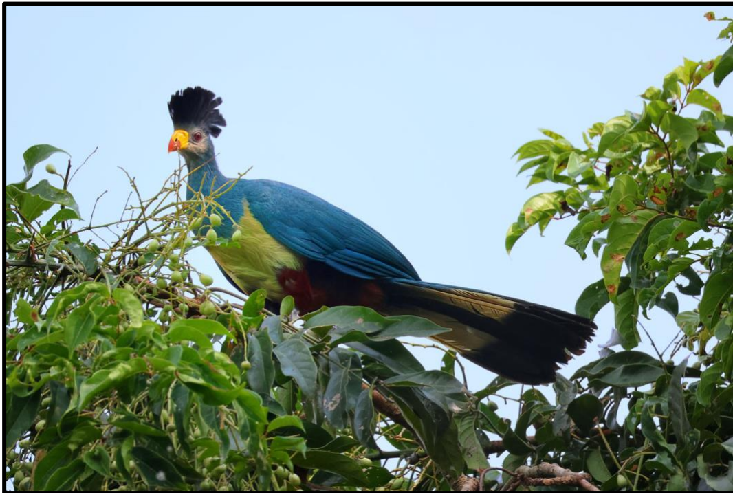
Groups of flamboyant Great Blue Turacos were a constant presence on this tour.

We then returned home for a delicious dinner and a good rest for traveling to our next base the following day.