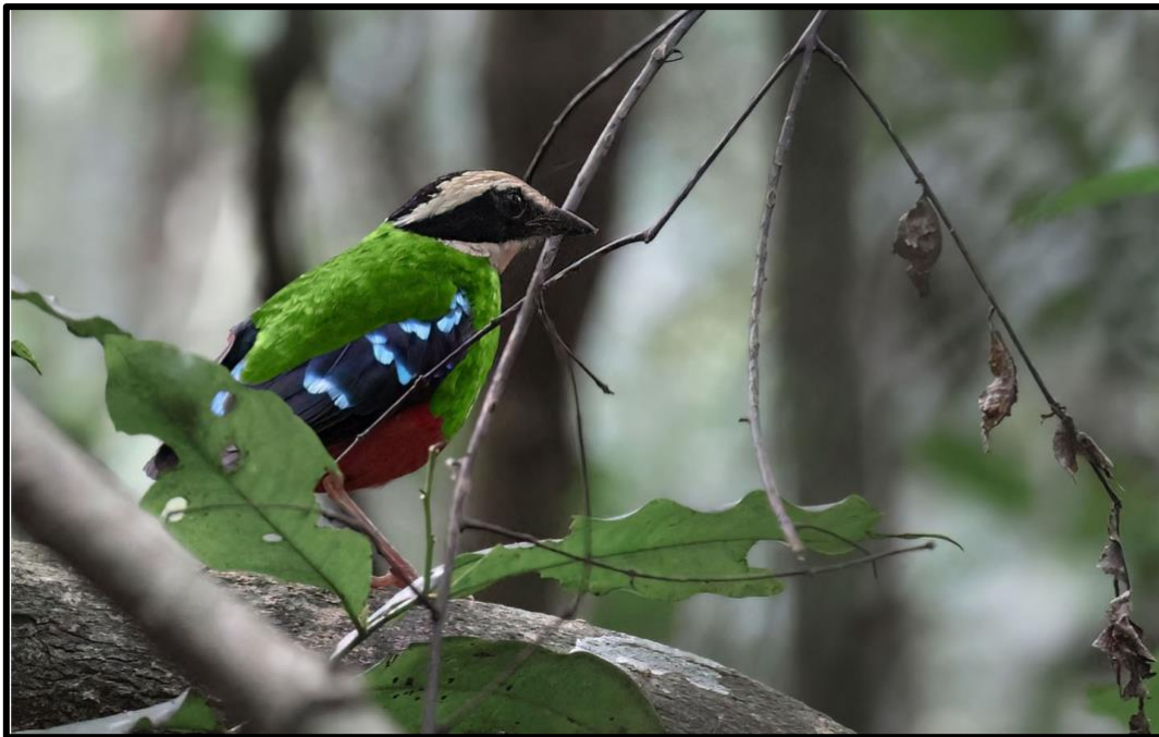
It took a while, but we eventually managed breathtaking views of Green-breasted Pitta.