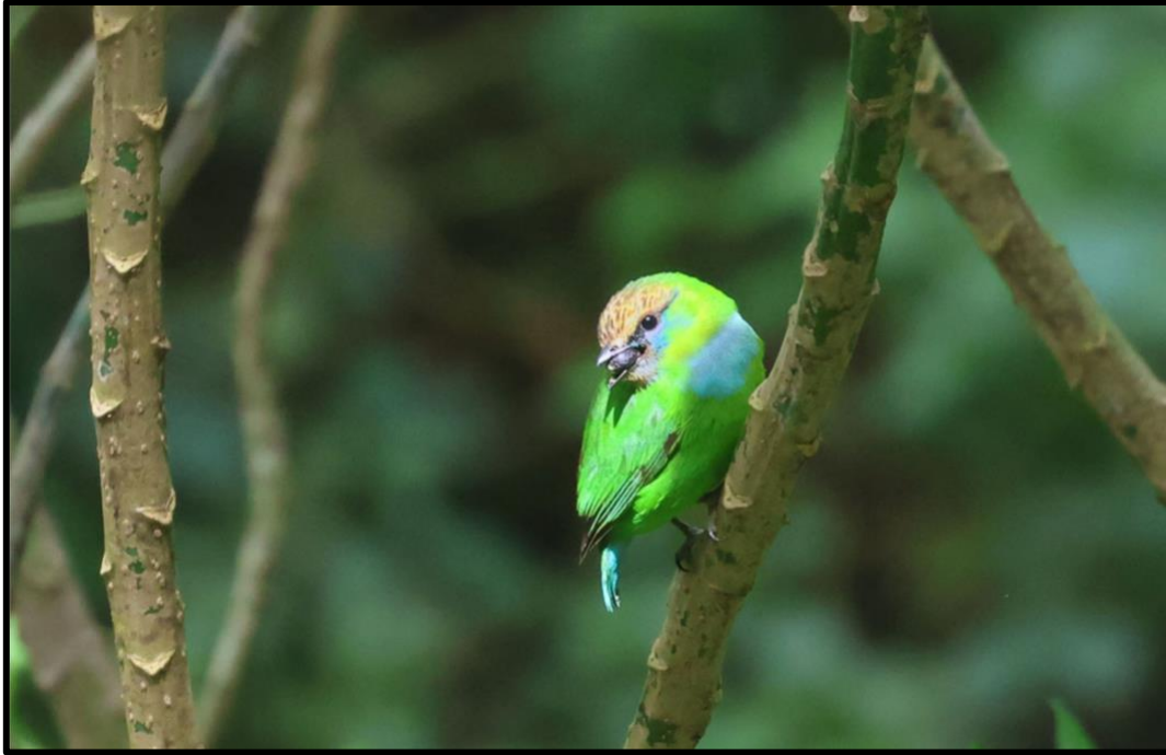
Watching a pair of Grauer's Broadbills ferrying berries to their fledgling at eye-level was a major highlight!

endemics. These included Rwenzori and Mountain Masked Apalises , Strange Weaver , Stripe-breasted Tit , Regal Sunbird , Yellow-streaked Greenbul , White-browed Crombec and the first of many Black Saw-wings . The last find of the day was a Black-fronted Duiker walking in the road near the Ruhija gate.