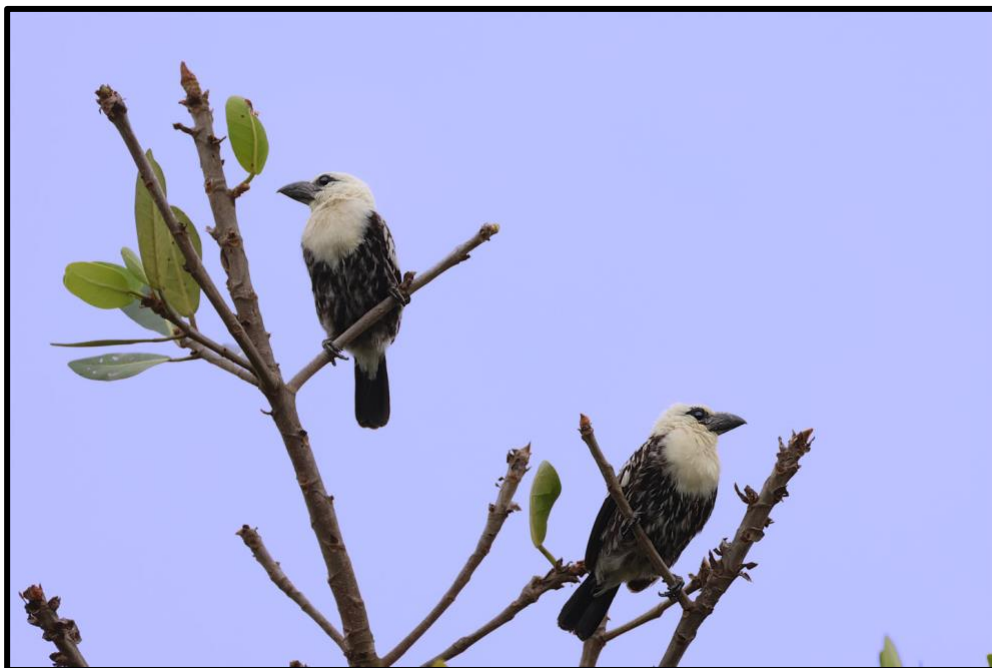
A duetting pair of White-headed Barbets was a pleasant distraction.

Today was a full day spent in the bird-rich savannah and woodlands of Lake Mburo National Park. Upon reaching the park gate, we added Red-headed Weaver and Greater Blue-eared Starling to our trip list before venturing south down the main park road that takes you towards the lake. The bush here was bustling with activity, and new species we managed to find during the morning included Emerald-spotted Wood Dove , Long-tailed Cisticola , Buff-bellied Warbler , Nubian, African Grey and Bearded Woodpecker , White-winged Black Tit , Ashy Flycatcher , Pale Flycatcher , Grey Tit-Flycatcher , Pearl-spotted Owlet , Verreaux's Eagle-Owl , Bateleur , Crested Francolin , Greater Honeyguide , Crested and Black-collared Barbet . Mammals also abound in this reserve, with plentiful sightings of Waterbuck (here of the defassa subspecies), Plains Zebra , (Rothschild's) Northern Giraffe , Impala , Warthog , Olive Baboon and Tantalus Monkey , supplemented by smaller numbers of Tsessebe (known locally as Topi), Common Dwarf Mongoose , Bushbuck and a single group of Common Eland . We then returned to the lodge for lunch, trying not to get distracted by the great birding around the viewing deck. Lappet-faced Vulture , Little Spotted Woodpecker and White-headed Barbet were new trip birds seen here, and we had more views of Black-chested Snake Eagle , Red-headed Lovebird and Double-toothed Barbet .