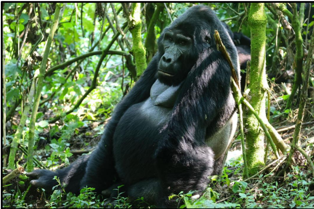
Spending time with this group of Western Gorillas in Bwindi was a bucket-list experience!

Black Bee-eater. A large mixed troop of Red-tailed and Blue Monkeys was also a treat as was a group of seven Great Blue Turacos drinking at a forest pool next to the road. We then continued towards Buhoma, with some of the village farmland areas en route delivering good species like African Woolly-necked Stork , Singing Cisticola and Variable Sunbird . In the town of Buhoma itself, the telephone lines were adorned with large numbers of Angolan Swallows along with a few Red-breasted Swallows . After checking in at our accommodation, we had a short birding stint along the entrance road into Bwindi Forest. The trees around the gate played host to tons of sunbirds, with Purple-breasted , Bronzy , Little Green , Olive-bellied , Northern Double-collared , Blue-throated Brown , Green-throated and Collared Sunbirds all in evidence. Just past the gate we managed to connect with the shy Grey-winged Robin-Chat , a noisy group of White-chinned Prinias and a pair of Bocage's Bushshrikes .