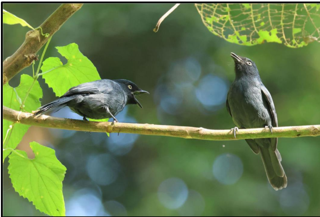
Yellow-eyed Black Flycatcher was just one of a plethora of Albertine Rift endemics seen in Bwindi