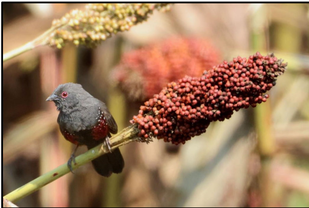
Dusky Twinspot is only found on the Albertine Rift and Angolan Escarpment (photo Hari Viswanathan).

This morning, we birded the forests that flank the road entering Ruhija from the south. We had driven this road when we arrived at Ruhija, but never got the chance to bird it properly. The morning activity was bustling all along the drive, new additions including Mountain Yellow Warbler , Rwenzori Hill Babbler , Western Tinkerbird , Sharpe's Starling , Grey Cuckooshrike , White-starred Robin , Cinnamon Bracken Warbler , Purple-breasted and Blue-headed Sunbirds , Kandt's Waxbill and Yellow-billed Barbet . We only heard Handsome Spurfowl here unfortunately, but we were consoled on our way out of Ruhija in the nearby sorghum fields. Here we found large numbers of seed-eating birds that were gorging themselves on the ripe crops growing on the slope. These included large numbers of Black-and-white Mannikin and Baglafaecht Weaver , as well as smaller numbers of Streaky Seedeater , Yellow-crowned Canary , Black-crowned , Yellow-bellied and Common Waxbills as well as our main target: a pair of Dusky Twinspots . A distant Red-chested Flufftail was also heard calling in the nearby wetlands.