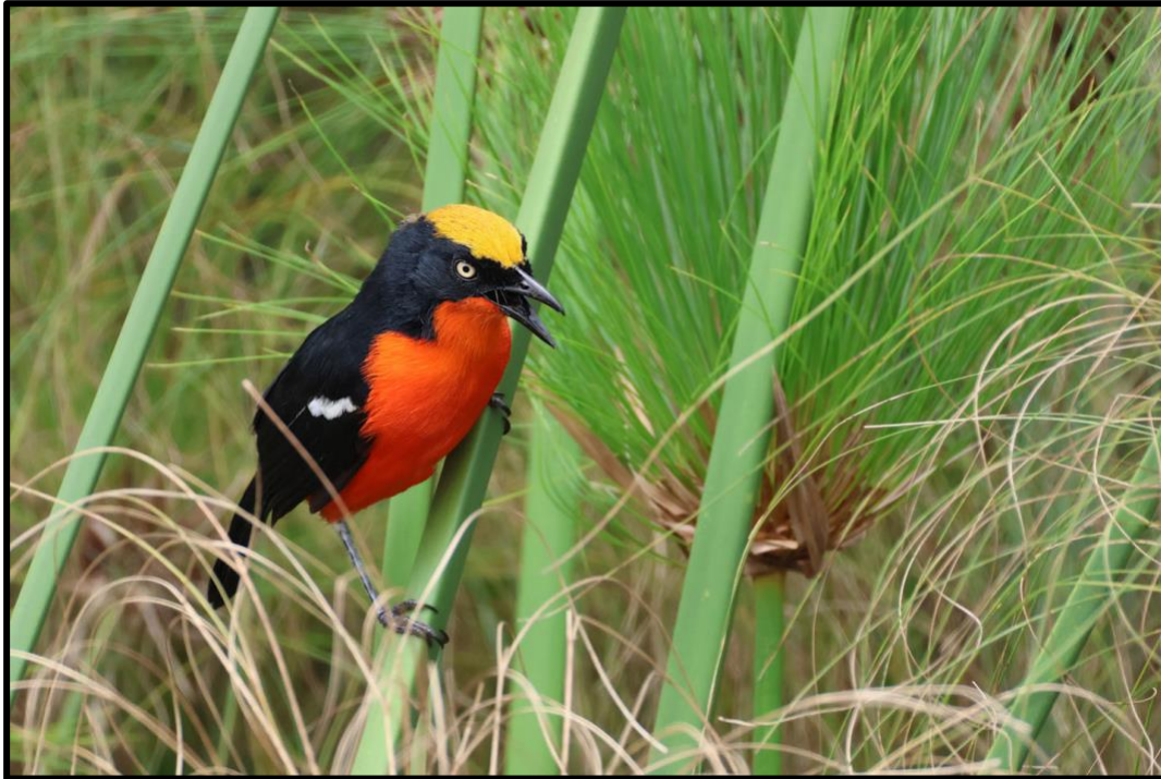
Papyrus Gonolek is a beautiful bushshrike with a peculiar habitat preference.

of these stunning bushshrikes calling right next to the car. We also visited a productive roadside wetland that was full of birds, including Rufous-bellied and Squacco Herons , Spur-winged Goose , Blue-headed Coucal , Blue-billed Teal , Common Moorhen , African Swamphen , Glossy and African Sacred Ibis and a few pairs of exquisite Grey Crowned Cranes . The cranes at this spot seemed quite used to people, allowing for close-up views of them. Birding along the road as we drove was also quite enjoyable. There was always exciting birds to see, and in the process, we managed to add Long-crested Eagle , Grey-backed Fiscal , both Common and Grey Kestrels , Laughing Dove , Marico Sunbird and African Wattled Lapwing .