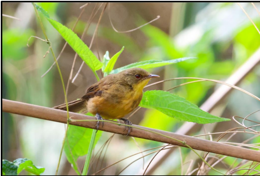
The rare and localized Papyrus Yellow Warbler gave itself up quickly at Lake Bonyoni.

Leaving Lake Mburo and the savanna behind, we journeyed west and quickly entered the rolling hills of farmland and eucalyptus plantations that extend towards Bwindi. The town of Kabale gave us a female Ruaha Chat and our first Western Citril and Bronzy Sunbird of the trip, while a nearby papyrus bed got us more stunning views of Papyrus Gonoleks (including a fledgling). We continued along the network of rough dirt roads in this area, picking up another Ruaha Chat (this one, a male) perched on a telephone line. Near the chat we also found our first Cinnamon-chested Bee-eater , White-tailed Blue-Flycatcher , White-eyed Slaty Flycatcher and Rock Martin of the trip. Around mid-afternoon, we arrived at our next stop: Lake Bonyoni. This massive Rift Valley lake is the second deepest in Africa after Tanganyika, and the pockets of papyrus along its edges are where we searched for the rare Papyrus Yellow Warbler . This elusive bird provided stunning views and gave itself up quite quickly, while the complementary papyrus special found here, Papyrus Canary, would not show at all. Here we also found Black-crowned Waxbill , Mackinnon's Shrike , Green-headed Sunbird , White-tailed Blue Flycatcher and Augur Buzzard .