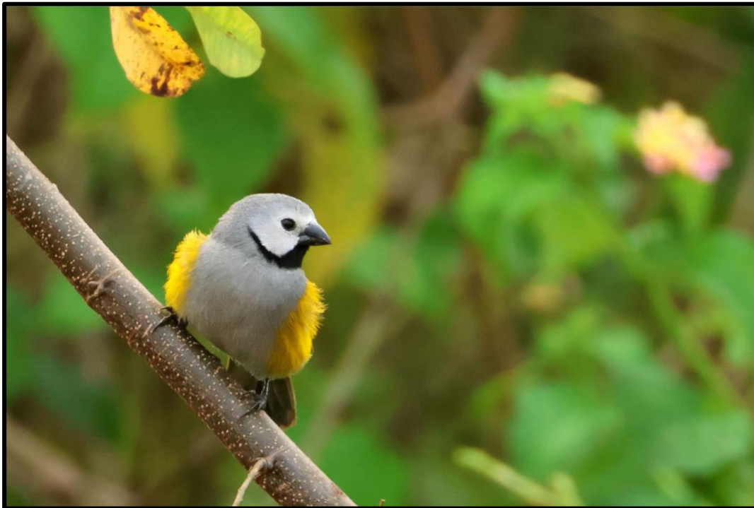
A truly dapper member of the waxbill family: Grey-headed Oliveback

around, among whom were a few handsome Grey-headed Olivebacks , singletons of Bar-breasted Firefinch and Fawn-breasted Waxbill , gorgeous male Yellow-mantled and Red-collared Widowbirds and a pair of stubborn Brown Twinspots that only gave brief flight views. An obliging Brown-backed Scrub Robin made up for the twinspots, as did large numbers of shimmering Copper Sunbirds . After passing through Masindi, we managed to bump into a couple of Black Bishops in the surrounding farmlands, as well as our first flocks of Lesser Blue-eared Starlings and the bizarre Piapiac . Upon reaching our accommodation at Ziwa Rhino Sanctuary, we were greeted by plentiful Bushbuck , Tantalus Monkeys , Warthog and even our main quarry at this location: two groups of White Rhinoceros , foraging around the reception! We then settled in for dinner as we listened to African Scops Owls calling in the distance.