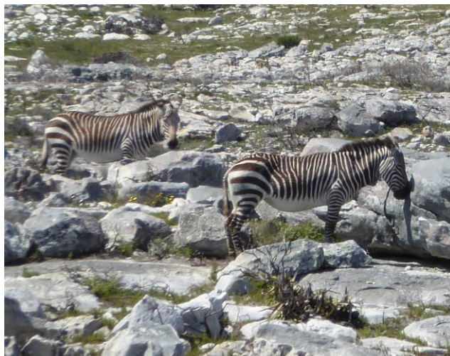
African penguins at Boulders beach, and two of the Cape Mountain zebras on the nature reserve (HC)

We moved on to the open expanses of the Cape of Good Hope Nature Reserve, a mix of vegetated sand dunes with rocky outcrops, where the poor soils meant no trees but plenty of scrub, including patches of proteas. Among some large boulders four Cape Mountain zebras stood stock-still: one of Africa's rarest mammals, with just seven in this area out of a total population of just 230 animals, Geoff said. With their pale bellies and brownish stripes without 'shadow' stripes they were distinctly different from the better-known Burchell's or plains zebra.