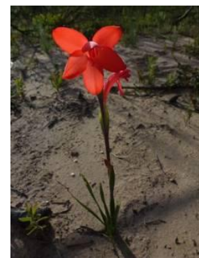
Klaas's cuckoo (HC); Napier Farmstead and Restaurant; Watsonia coccinea (CD)

Elim itself is a distinctive town where the buildings of the Moravian community are mostly the same simple style with roofs thatched with restios. However nowhere was open for lunch, so we needed a rather unwelcome drive along an unmade road to Napier, passing long-horned nguni cattle near to Elim. But the journey was well worth it: the Napier Farmstead and Restaurant was a delight with a menu including homemade butternut squash soup, pies and quiche, and with various local speciality foods for sale. After that we took a longer but metalled road back to Elim, passing and giving a chance to scan several roadside wetlands. Highlights here included two very close blue cranes, white-backed ducks, a harrier hawk and adjacent three-banded and Kittlitz's plover.