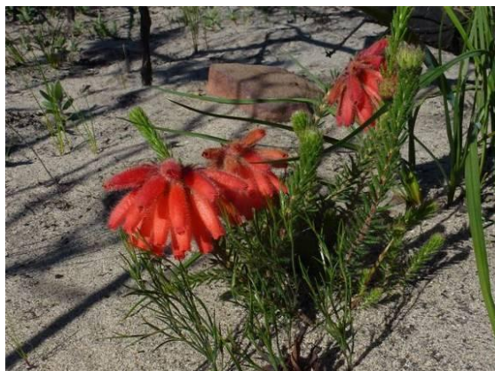
Oxalis polyphylla and Erica cerinthoides under burnt protea scrub at Silvermine (CD)

After an hour back at base, Geoff collected us for our evening meal at the nautically-themed seaside fish restaurant Mariner's Wharf. Very good it was too, with a killer quote from one of the waiters who discovered the family connections in the group: "You're witnessing your grandfather having a tart? It's awesome!"