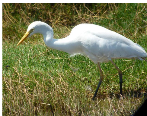
Yellow-billed egret (CD)