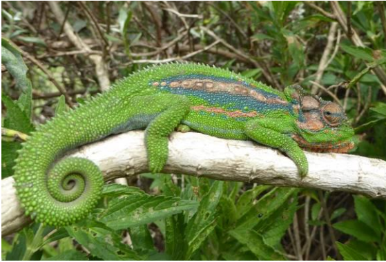
Cape dwarf chameleon, about 6" long, half of which is the tail