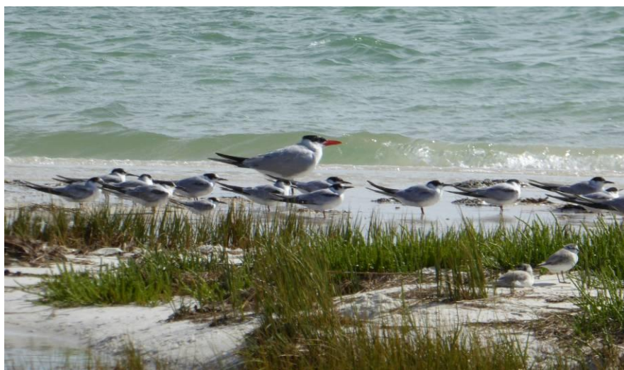
Terns and two white-fronted plovers on the shore of Langebaan lagoon, West Coast National Park (HC)

Moving on, a different harrier hunted over the scrub, the striking-looking black and white of a black harrier. The picnic tables by the National Park's main building were being used so we drove on, pausing to watch southern black koorhaan (a bustard), the second of what Geoff had suggested were our target species, the first being the black harrier. Lunch was at a hilltop viewpoint over the extensive Langebaan coastal lagoon. Growing here were the knee-high white spikes of a chinchinchee, the star-of-Bethlehem Ornithogalum thyrsoides , and a charming little iris Babiana tubiflora . A colourful find was lunate ladybird and there were repeat sightings of several bird of prey species.