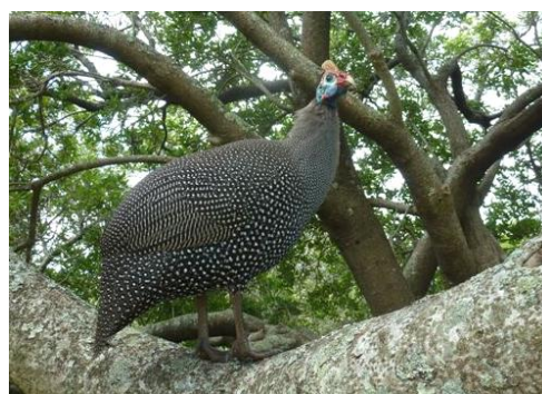
Helmeted guineafowl (CD)