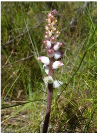
Lachenalia peersii (CD)

After breakfast at Baleens, we spent a 'free morning' in Hermanus. Inevitably this involved some shopping and coffee, but mostly for all of us it meant walking along the seafront and looking for, or at, whales. The best of these were around midday when two southern right whales, probably a mother and calf, were close to shore and the bigger one was regularly breaching. There was quite a crowd of appreciative onlookers. Elsewhere there were gulls, including our first definite grey-headed gulls, and terns, notably Sandwich and swift. The coastal path had an easy walk with information about the wildlife and vegetation plus incredibly tame rock hyraxes. We split up after our 12:30 rendezvous, leaving three behind to continue enjoying Hermanus, and the rest of us took a very short drive to Fernkloof nature reserve where we ate our picnics. For the now quite hot afternoon, we walked through the fynbos vegetation at Fernkloof. Almost immediately there was an orange-breasted sunbird and amazing views of a very tame sugarbird. But the fine show of fynbos flowers was the main attraction. Listing these was helped by a display of labelled, picked flowers behind a door kept locked to keep out the local baboons (which didn't show).