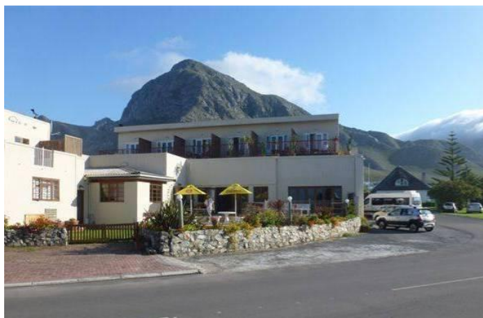
Baleens Hotel on the outskirts of Hermanus

This holiday, as for every Honeyguide holiday, also puts something into conservation in our host country by way of a contribution to the wildlife that we enjoyed. The conservation contribution this year of £40 per person was combined with those from Honeyguide's group in Namibia in November 2015.