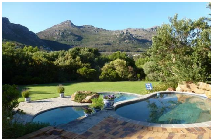
The garden at Tarragona Lodge (CD)

In Hermanus: Baleens Hotel www.baleens.co.za