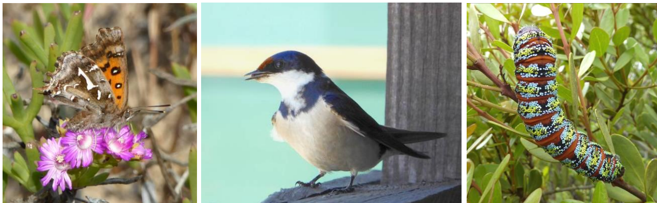
From the West Coast National Park: Silver arrowhead butterfly; white-throated swallow with a nest in the hide; and a caterpillar of the pine emperor moth