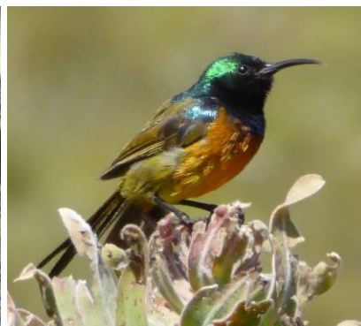
Cape rockjumper at Rooi Els (CD) and orange-breasted sunbird at Harold Porter Botanical Gardens (HC)

Harold Porter Botanical Gardens, where we had lunch outside, was just 10 minutes away. Quick to come to the table for scraps were Cape robin-chats. One of several iron-stained ponds had frogs and bright red dragonflies that proved to be Broad Scarlets. The gardens were beautiful, like a little Kirstenbosch, with lots of wildlife, the most dramatic being a close encounter with a boomslang snake – loud and agitated bird alarm calls from one of the island beds alerted us to its presence, and we had good views of it on the ground and twice climbing shrubs, presumably searching for bird nests. A Cape robin-chat was especially energetic in chasing the snake, making repeated dives at the reptile. Close by there were good views of both male and female orange-breasted sunbirds and a sugarbird fed on the nectar of proteas. Up the hill, the gardens turned to woodland adjacent to natural fynbos, and here we saw African black duck on the river and black saw-wing swallows up with the rock martins and greater striped swallows. There were two migrant spotted flycatchers in the garden as we went down the hill through the gardens and back to the bus.