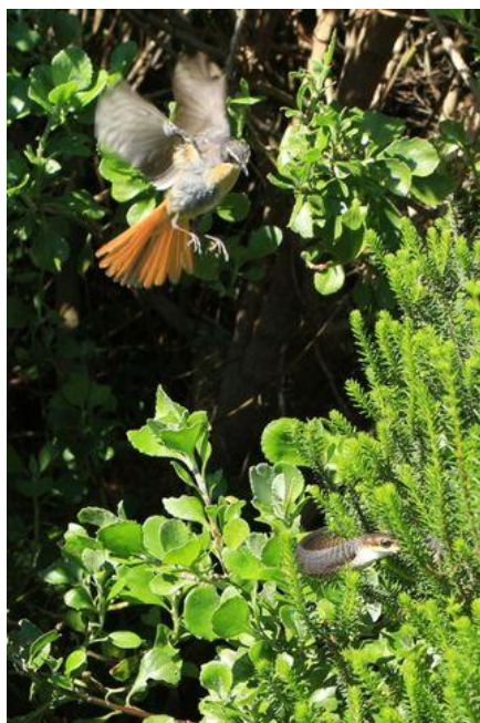
Cape robin-chat mobs a boomslang (GC).

Harold Porter Botanical Gardens, where we had lunch outside, was just 10 minutes away. Quick to come to the table for scraps were Cape robin-chats. One of several iron-stained ponds had frogs and bright red dragonflies that proved to be Broad Scarlets. The gardens were beautiful, like a little Kirstenbosch, with lots of wildlife, the most dramatic being a close encounter with a boomslang snake – loud and agitated bird alarm calls from one of the island beds alerted us to its presence, and we had good views of it on the ground and twice climbing shrubs, presumably searching for bird nests. A Cape robin-chat was especially energetic in chasing the snake, making repeated dives at the reptile. Close by there were good views of both male and female orange-breasted sunbirds and a sugarbird fed on the nectar of proteas. Up the hill, the gardens turned to woodland adjacent to natural fynbos, and here we saw African black duck on the river and black saw-wing swallows up with the rock martins and greater striped swallows. There were two migrant spotted flycatchers in the garden as we went down the hill through the gardens and back to the bus.