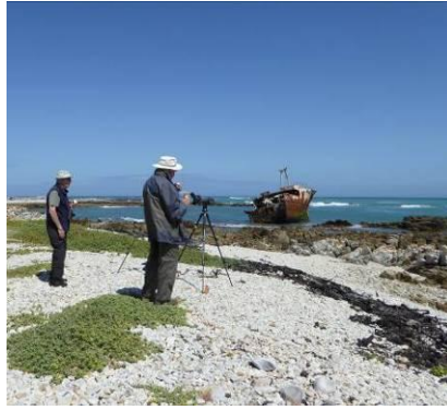
Satyrion carneum on limestone fynbos; Cape Agulhas (HC)

Lunch was at Cape Agulhas, opposite a wreck. I expected the southernmost point of Africa to be bracing, but actually there was a gentle, warm wind today. Well offshore we found two humpback whales breaching, showing pale undersides to tails and flippers and a blow going straight up. Geoff took the bus back to the lighthouse while the rest of us walked along the coast. The low-growing flowers were pretty, notably sheets of the