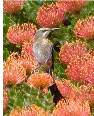
From Kirstenbosch: Southern double-collared sunbird (HC); the tree-top walkway (MC); sugarbird on pincushion protea (MC)

Geoff left us to move the minibus and our picnic lunch near the Ryecroft Gate, where we walked to meet up, seeing along the way striped mouse and a carpenter bee with two broad yellow stripes – a female Xylocopa caffra . Helen found a stick insect in the loos, which she brought out to be studied and photographed by us all, especially as it walked over David. Later study showed it to be a male Thunberg's stick insect Macynia labiata . After lunch we strolled through a different area, where three sweet waxbills settled on the grass. A large leopard tortoise was completely untroubled by human attention. Our route then went into a more wooded, natural area where a stream had Cape river frogs and one corner had a very tame dusky flycatcher. The path led us past strelitzias and coral trees to an area specialising in rare and threatened plants, beyond which we passed a wedding party. After taking in the specialised plants in the conservatory (e.g. desert plants and bulbs) and browsing in the shop, we had an early return for tea and a rest back at Tarragona Lodge, then wildlife checklists and eating out in Hout Bay at Massimo's.