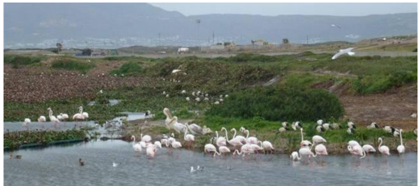
Flamingos, pelicans, ibises and more at Strandfontein (CD)

It was a short drive to the extensive water purification lagoons at Strandfontein, which was mostly stop-start birdwatching using the minibus as a mobile hide as there were huge numbers of birds, often very close. Greater flamingos were in thousands and there were many hundreds of sacred ibises, which were also with gulls feeding on the adjacent rubbish tip. There were several purple swamp-hens, mostly on vast sheets of water hyacinth, and a black crane walked in the open at one point. Black-necked grebes in various plumages swam with little grebes and we found the first three-banded plover for the holiday. Bigger waders were more obvious: avocets, greenshanks, blacksmith lapwings and scores of black-winged stilts. Particularly notable among the wildfowl were maccoa ducks (a stiff-tail) and spur-winged geese.