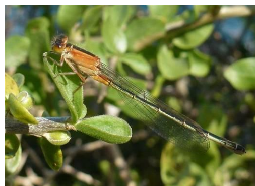
Satyrium carneum , worth the scramble; the Atlantic coast from Chapman's Peak Drive; immature female Tropical Bluetail (CD)

Next stop was a viewpoint with breathtaking views of the coastline. What first looked like a whale in the bay was just a rock, but there was lots to see: a particularly fine plant was the green and cream flowered Albuca capitata 2 . A damselfly settled, allowing photographs, from which an ID of Tropical Bluetail was clinched. Moving along the coast the road dropped down and we joined several other people watching a southern right whale at Simonstown, very close to the Indian Ocean shore. It was an easy walk, over a railway line, and I also spent time pursuing a dragonfly that photos revealed to be a female Two-striped Skimmer.