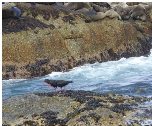
From the boat trip: Cape fur seals and a pair of black oystercatchers