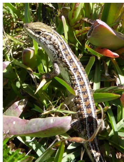
Western three-striped skink (HC)

At Cape Point, some took the funicular to the old lighthouse and the rest of us walked. Right by the start of the path there was a wonderfully tame Cape bunting and the first of several Cape girdled lizards: they have a patterning and texture reminiscent of a tiny crocodile. There were several cape siskins in the natural vegetation and lots of tame red-winged starlings here and around the car park. Painted lady butterflies were numerous, and it was odd how all three butterfly species we saw today were familiar from Europe, the others being cabbage white (what we'd call large white) and geranium bronze, the last now an established alien in much of southern Europe. A huge, striped, hairy caterpillar was destined to be a Cape lappet moth. There were nesting Cape cormorants on the vertiginous cliffs around the lighthouse and a couple of distant Cape gannets offshore.