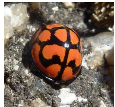
Arum lily frog (CD); Southern rock agama (HC); lunate ladybird (CD)