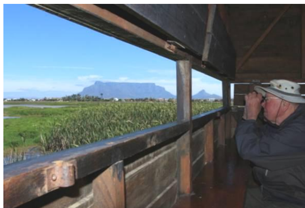
Looking over Rietvlei Nature Reserve (GC)

That left four of us to carry on to the marshes of Rietvlei Nature Reserve, overlooked by Table Mountain. The lagoons had white pelicans, flamingos of two species (greater and lesser), glossy ibises, African spoonbills, hundreds of red-knobbed coots, black-winged stilts and various herons, including yellow-billed egret. Nesting underneath both hides were white-throated swallows. The most numerous small bird was the sparky Levaillant's cisticola, and others included red bishops and two weaver species. There was a chilly breeze over the water around the two hides but much warmer as we made our way back through the vegetated dunes. In an open bush a pin-tailed whydah sat in good view, tail and all; two black-shouldered kites hovered over open areas and two African fish eagles drifted through. Butterflies were silver-bottom browns and other notable insects were scores of syntamid moths called the heady maiden Amata carbera (or possibly the very similar A. alicia ).