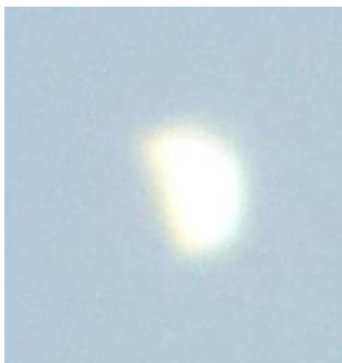
Telescope view of the 'morning star' (CD)

Our departure was slightly delayed as Helen's sharp eyes had noticed a light in the blue, almost cloudless sky, which a telescope view confirmed as Venus with its semi-circle shape visible.