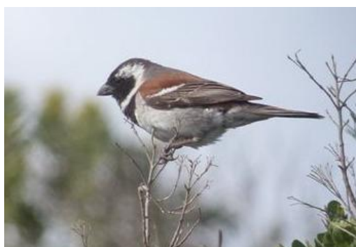
Cape sparrow (CD)