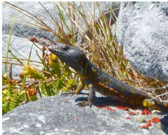
On Table Mountain: waiting for the Cape crag lizard (above) to reappear