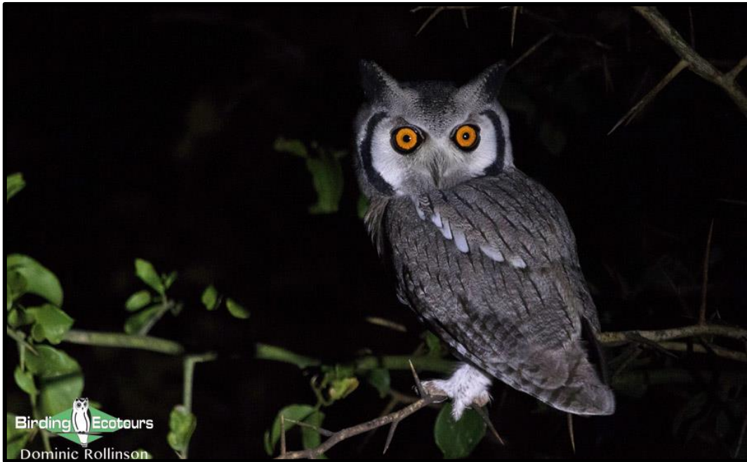
Southern White-faced Owl is one of our most handsome owls and is an Acacia savanna specialist.

Spotted Eagle-Owls around the environmental center. After enjoying some good looks at the roosting male, we headed north toward Dinokeng, arriving at Golden Impalas Bush Resort around lunchtime. After a hearty meal, we relaxed for most of the afternoon, venturing out again in the evening for a stint of owling. We headed straight to the Toyota 4x4 ATV Club campsite near Rust de Winter Game Reserve, where the residents were happy to show us to a couple of roosting African Scops Owls , as well as the local Verreaux's Eagle-Owls that had been in this camp for years. We returned to this site every evening to relish the stellar viewing opportunities of both the biggest and smallest owls in southern Africa! A couple of feisty Pearl-spotted Owlets were also hanging around, making their presence known by their sharp, whistling calls.