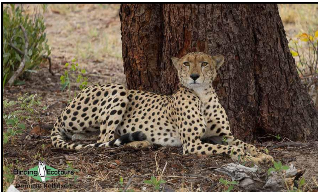
Cheetah near Satara was our only sighting of this elegant cat.

The other focus of this tour was seeing big cats, for which we were based in the famed Kruger National Park for four nights. During our time in the park, we managed to connect with around 40 Lions between various groups, along with five Leopards and three Cheetahs , with the supporting cast of other iconic mammals such as Spotted Hyena , African Savanna Elephant , Common Hippopotamus , Southern Giraffe , Common Warthog , Plains Zebra and various antelope species. We were even lucky enough to see a group of Lions in the process of taking down a Common Warthog , quite a sight to see!