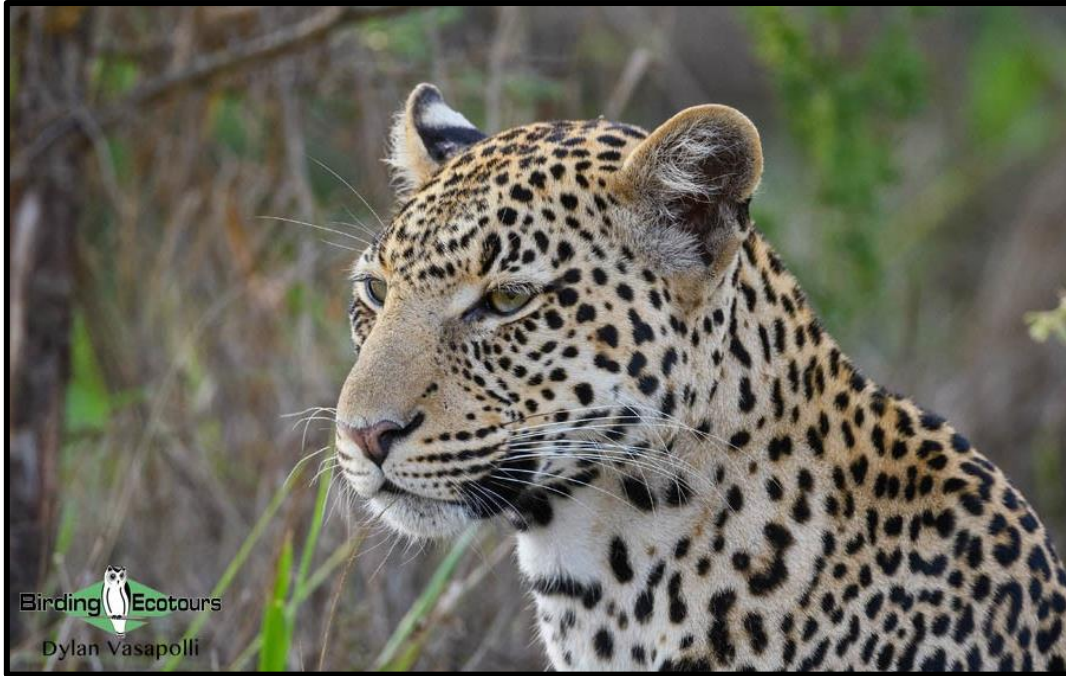
We were treated to multiple Leopard sightings around Skukuza.