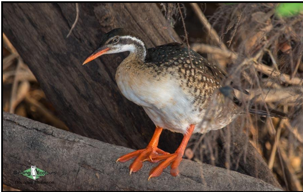
One of three finfoot species, the elusive African Finfoot was seen many times on Lake Mburo.

For the afternoon, we headed back into the park and made our way down to the lake itself for a boat ride along the shoreline. Fringed by clay banks and dense tangles of vegetation, the waterbirding here was excellent for two secretive species: a pair of White-backed Night Herons and a couple of African Finfoots . A small group of Lesser Flamingos flying past was an unusual sighting, while more regular aquatic species seen included Pied , Malachite and Giant Kingfisher , Common Sandpiper , Hamerkop , Striated and Squacco Heron , Carruthers's Cisticola and numbers of African Fish Eagles nesting in the surrounding trees. Levaillant's Cuckoo , Spectacled Weaver , Green Wood Hoopoe and Pale-throated Greenbul were also seen from the boat. Heading back through the reserve after the boat trip yielded many species seen from the morning. Once back at the lodge, we connected with a few overflying Red-headed Lovebirds before settling in for dinner and our final night of the tour.