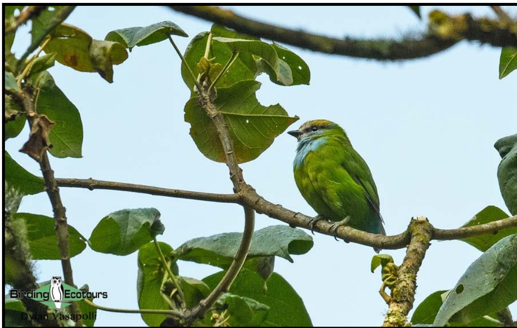
We enjoyed prolonged views of a nesting Grauer's Broadbill at Mubwindi Swamp!

Today we had another full day of forest trail birding in Bwindi, this time doing the famed “ Grauer's Broadbill ” walk down to Mubwindi Swamp. This trail is quite a steep descent into the forest, but fortunately it's a more open section of forest than Buhoma, making visibility better for birding. This was also another high species day, with roughly 70 species seen along this trail, including Albertine Rift targets like Yellow-eyed Black Flycatcher , Dusky Crimsonwing , White-bellied Crested Flycatcher , Strange Weaver , Stripe-breasted Tit , Rwenzori Apalis , Rwenzori Batis , Rwenzori Hill Babbler , Albertine Sooty Boubou , Dwarf Honeyguide and, of course, Grauer's Broadbill . We were treated to one of these emerald gems actively ferrying food to its moss-clad nest, with a noisy nestling begging incessantly.