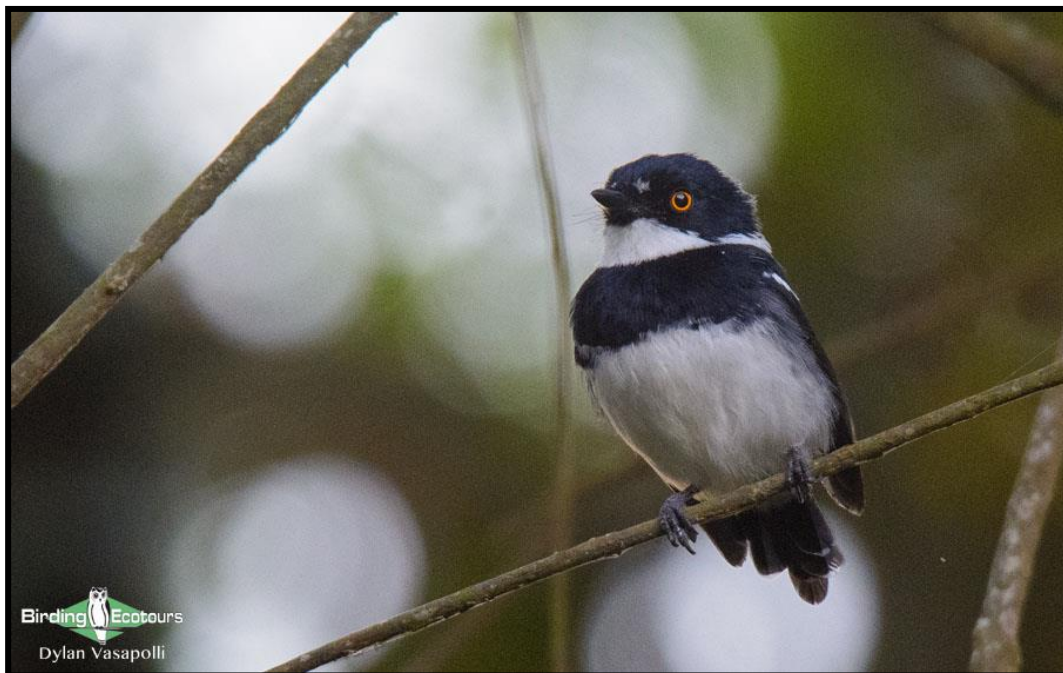
Rwenzori Batis is the largest batis species, and one of the easier Albertine endemics.

Increasing in altitude as we approached Ruhija, we were treated to beautiful vistas over the surrounding hills, with Augur Buzzards and White-necked Ravens soaring about. African Stonechat , Red-throated Rock Martin , Chubb’s Cisticola , Streaky Seedeater and Plain-backed Pipit were also seen on these slopes, and we added Variable Sunbird and Yellow-crowned Canary at our mountainside accommodation. After having lunch and checking in, we went for a late afternoon walk down the “school track” between the town and the forest edge, for our final forest birding session for the day. Being at higher altitude than Buhoma, another suite of species had now become available to us, including Rwenzori Batis , Grey Cuckooshrike , Albertine Sooty Boubou , Archer’s Ground Robin , Chestnut-throated and Mountain Masked Apalis and the strange Grauer’s Warbler . Our last new addition for the day was a Montane Nightjar seen near the school track after dinner.