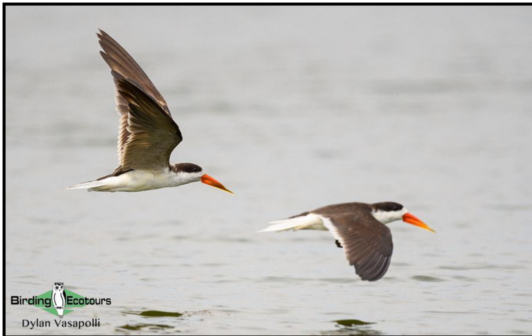
African Skimmers were seen on both the Kazinga Channel and Murchison Falls boat trips.

We capped off the day by doing some savanna birding along the lodge access road which delivered Gabar Goshawk (melanistic form), Blue-spotted Wood Dove , Red-necked Spurfowl , Crested Francolin , Black-lored and Arrow-marked Babbler , Trilling Cisticola , White-browed Scrub Robin , Green-winged Pytilia , Spectacled and Lesser Masked Weaver , Golden-breasted Bunting , Plain-backed Pipit , Village Indigobird , Wattled Starling , Common Scimitarbill , Little Bee-eater , Spot-flanked Barbet and lots of Senegal Lapwings , among the usual suspects.