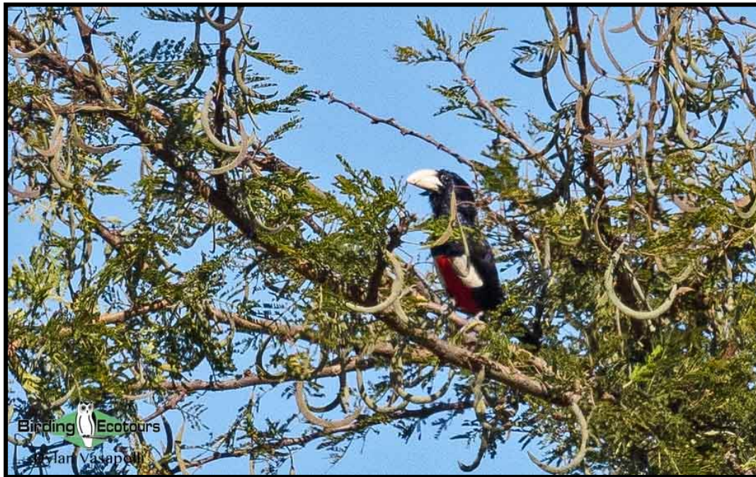
Black-breasted Barbet – Africa's largest barbet species and the main target for any birder visiting Kidepo!

We enjoyed two full days of birding the extensive savannas of Kidepo National Park, right in the northeastern corner of Uganda. This huge reserve is transected by the Narus and Kidepo Rivers, both of which create lush floodplains that crisscross the rolling hills of grassland and stunted tree cover. Some of these hills were capped with bare, granite monoliths adorned with thickets and fig trees. It was near one of these geological formations that we found Kidepo's specialty bird: Black-breasted Barbet . This rare barbet, the largest in Africa, is found in the eastern Sahel, and Kidepo is the most accessible place in the world to try for it. However, it is scarce across its whole range, even in Kidepo, so we were over the moon to have extended views of a pair of them feeding and singing at a moderate distance. The same site also delivered the stunning White-crested Turaco as well as a family of loud Stone Partridges .