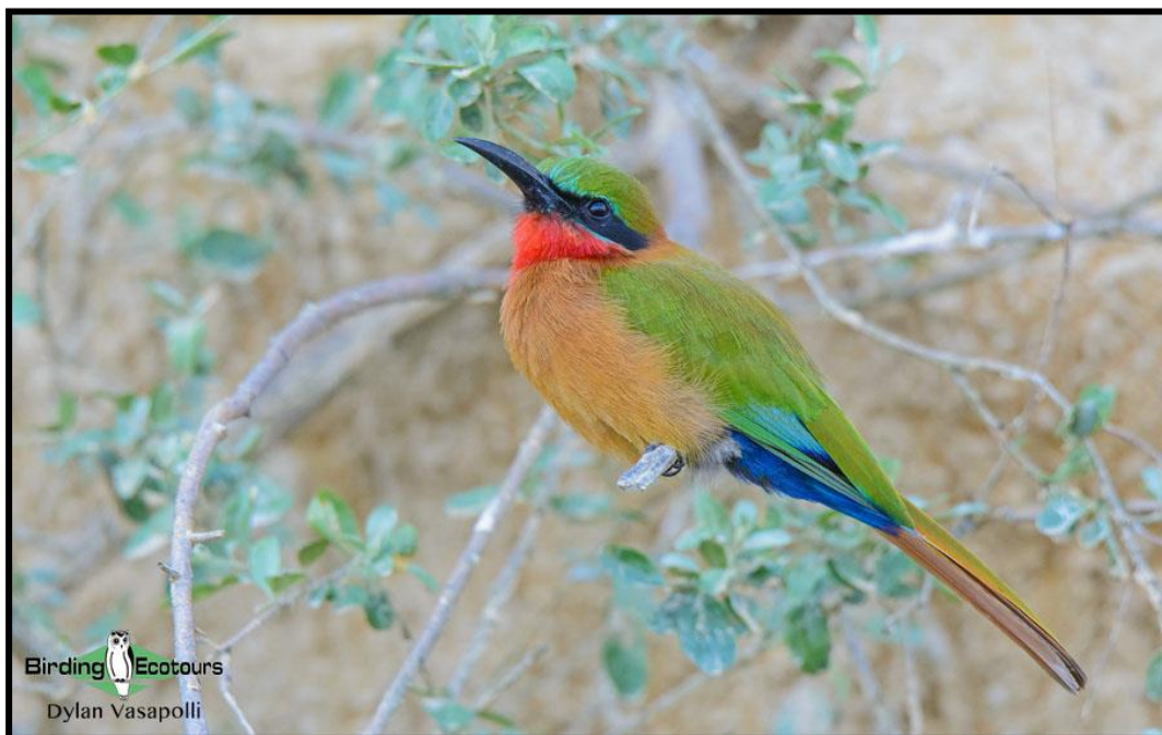
Rainbow-colored Red-throated Bee-eaters were a feast for the eyes!

Being situated on the banks of the Nile meant that waterbirds were more prominent here than at Kidepo, with African Jacana, Spur-winged Lapwing, African Fish Eagle, African Sacred Ibis, Great Egret, Yellow-billed Stork, Giant and Pied Kingfisher and Little Egret all fairly common around the river margins. These were seen particularly well on our midday boat cruise down to the falls themselves, along with other species like African Darter, Grey, Purple and Little Heron, Senegal and Water Thick-knee, African Skimmer, Horus Swift, Great Cormorant, Red-throated Bee-eater, Malachite Kingfisher, Knob-billed Duck and even African Savanna Elephant and Common Hippopotamus. This was followed by one last drive through the reserve in the afternoon, which delivered Mourning Collared Dove, Black-billed Barbet, Northern Puffback, Yellow-rumped Tinkerbird, Tawny Eagle, Common Waxbill, Levillant's Cuckoo, Shelley's Sparrow, Heuglin's Spurfowl and Grey Crowned Crane.