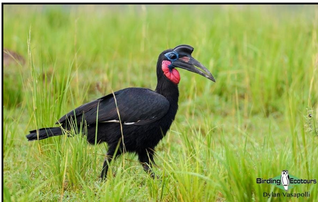
The majestic Abyssinian Ground Hornbill was pleasantly common in Kidepo and Murchison Falls.

Our lodge at Kidepo was set atop one of the granite inselbergs that overlooked the park from the south. The road leading to the lodge cut through some dense stands of broad-leaved woodland, and we were sure to spend some time birding this altogether different habitat from what we had seen in the park. New species such as Spot-flanked Barbet , Brown-rumped Bunting , Yellow-bellied Hyliota , Grey-headed Bushshrike , Green-backed Eremomela , African Thrush , Pale Flycatcher , Western Black-headed Batis , Northern Yellow White-eye , Cardinal Quelea , Yellow-fronted Canary , White-browed Scrub Robin , Foxy Cisticola , Black Saw-wing and the enigmatic Ring-necked Francolin were all seen along this road, with the latter being a major highlight of the trip due to its rarity. A showy White-crested Turaco feeding on the ground at the roadside was also a notable sighting. At night, we were serenaded by Freckled Nightjars singing around our chalets, while Swamp Nightjars called from the distant floodplains.