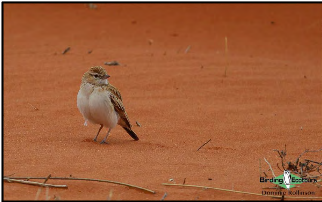
Fawn-colored Larks were seen at the Koa Dunes, alongside Red Larks.

Upon arriving in Pofadder and after checking into our lodging, we went out for a late afternoon drive. The first few kilometers of this road delivered quite a few good species, including Double-banded Courser , Karoo Korhaan , Northern Black Korhaan , Chat Flycatcher , Karoo Chat , Stark's Lark and, best of all, a distant flying group of Burchell's Coursers . South African Ground Squirrels and Yellow Mongooses were welcome mammal distractions along the drive. In the evening, after dinner, we went for a night drive down this same road in an attempt to see Cape Eagle-Owl, but alas, it was not meant to be.