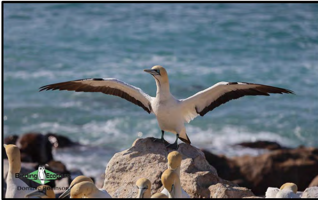
We had lovely looks at thousands of Cape Gannets in Lambert's Bay.

they come and go from fishing trips out to sea. The island is said to support about 15,000 gannets, and is one of only six breeding colonies of Cape Gannet in the world. There is also a large Afro-Australian Fur Seal colony on the rocks beyond the island, and these large seals take advantage of the gannet colony to hunt their fledglings as they leave the nest. After we'd had our fill of the gannets, we went back to our guesthouse and relaxed for the rest of the afternoon, enjoying a fiery sunset over the ocean and a lovely beachside dinner to cap off our last night of the tour.