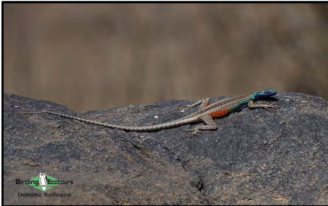
Attractive Broadley's Flat Lizards were seen at Augrabies Falls National Park.

En route, we made a lengthy detour to Augrabies Falls National Park for lunch, as well as to enjoy the spectacular views of the falls, being greeted by stunning Cape Starlings as we arrived. The campsite held a variety of new species for us, such as Namaqua Warbler , Crested Barbet , Golden-tailed Woodpecker , Brubru , Southern Grey-headed Sparrow and Common Reed Warbler , alongside Cardinal Woodpecker , African Hoopoe , Pirit Batis , flocks of Common Waxbills , the broad-browed western race of Cape Robin-Chat and a troop of Vervet Monkeys . The walk down to the falls delivered Black-chested Prinia , Acacia Pied Barbet , Dusky Sunbird and White-throated Canary , whilst at the lookout point overlooking the waterfall, large numbers of Alpine Swifts were feasting upon the masses of blackflies that had emerged from the river and were swarming around it. Brightly-colored Broadley's Flat Lizards clung to the flat granite rockfaces surrounding the waterfall, also in pursuit of the blackflies (the males were also in pursuit of females!).