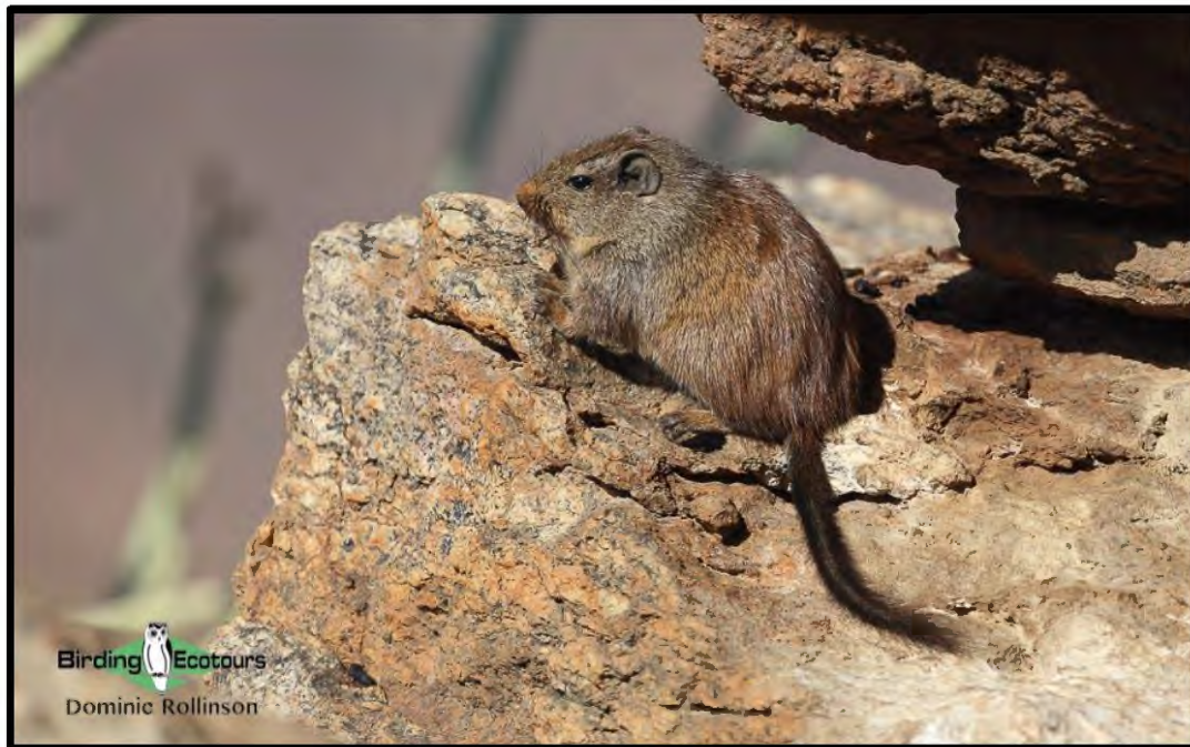
This Dassie Rat struck a good pose at Goegap Nature Reserve.

While birding in Goegap, we also connected with many other Karoo and Namaqualand specials, like Karoo Chat , Ludwig's Bustard , Black-eared Sparrow-Lark , Layard's Warbler (many, including birds carrying food to their nest), Karoo Eremomela (particularly common in this reserve), Grey Tit , Acacia Pied Barbet (a pair breeding near the gate), Pale-winged Starling , Nicholson's Pipit , Dusky Sunbird , Lark-like Bunting and White-throated Canary . Other wildlife highlights included reptiles like Red-sided Skink , Southern Rock Agama , Bibron's Gecko and Namaqua Sand Lizard , and a family of Dassie Rats (including five babies) near the visitor's center.