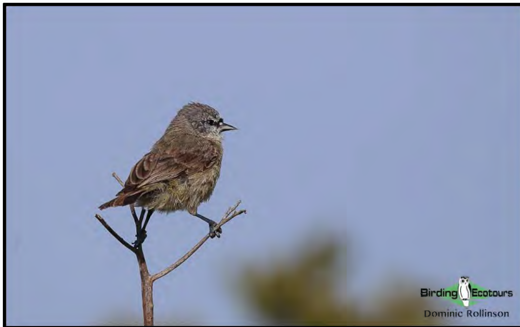
The cute Cape Penduline Tit in West Coast National Park.

After having breakfast in the Geelbek hide, we moved across to the Abrahamskraal hide, situated on the edge of a small, reed-lined freshwater pool. On the way to the hide, we picked out Long-billed Crombec and had stunning roadside views of a Cape Longclaw . Within the vicinity of the hide itself, we found our first Karoo Scrub Robin , had a pair of South African Shelducks flying past, and got mouth-watering views of a singing Southern Black Korhaan walking in the road. Crowned Lapwing , Cape Shoveler , Yellow Canary , Jackal Buzzard , Bokmakierie and Red-knobbed Coot were also seen from the hide. Continuing our journey northward along the western arm of the lagoon road, we managed to find an adorable Cape Penduline Tit and added Malachite Sunbird to our day list before reaching the start of the Postberg section of the park and the end of the peninsula.