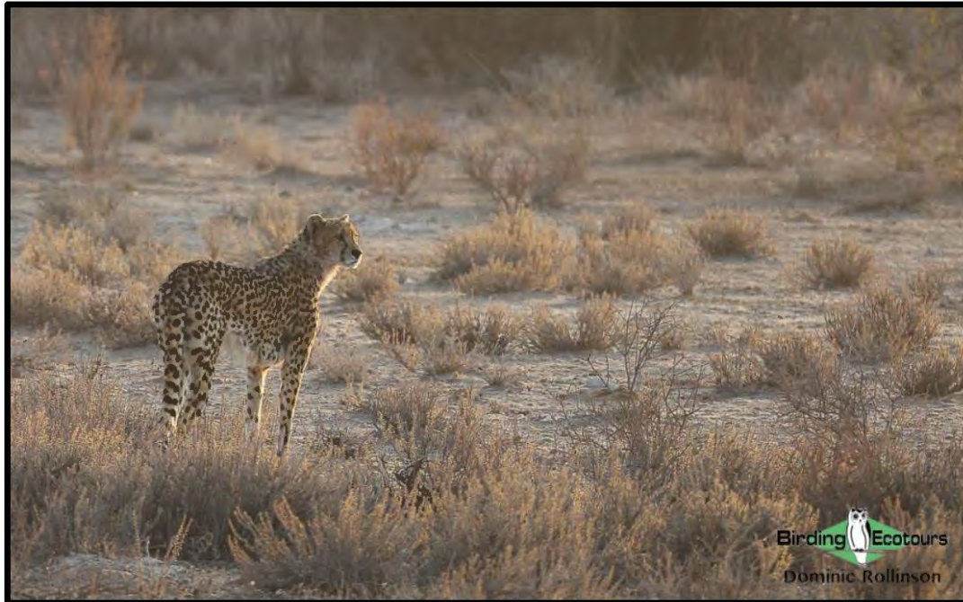
Cheetah posed well for us in the Kgalagadi Transfrontier Park.

African Ground Squirrel , whilst outside the park we managed to find elusive species such as Bat-eared Fox and Aardwolf .