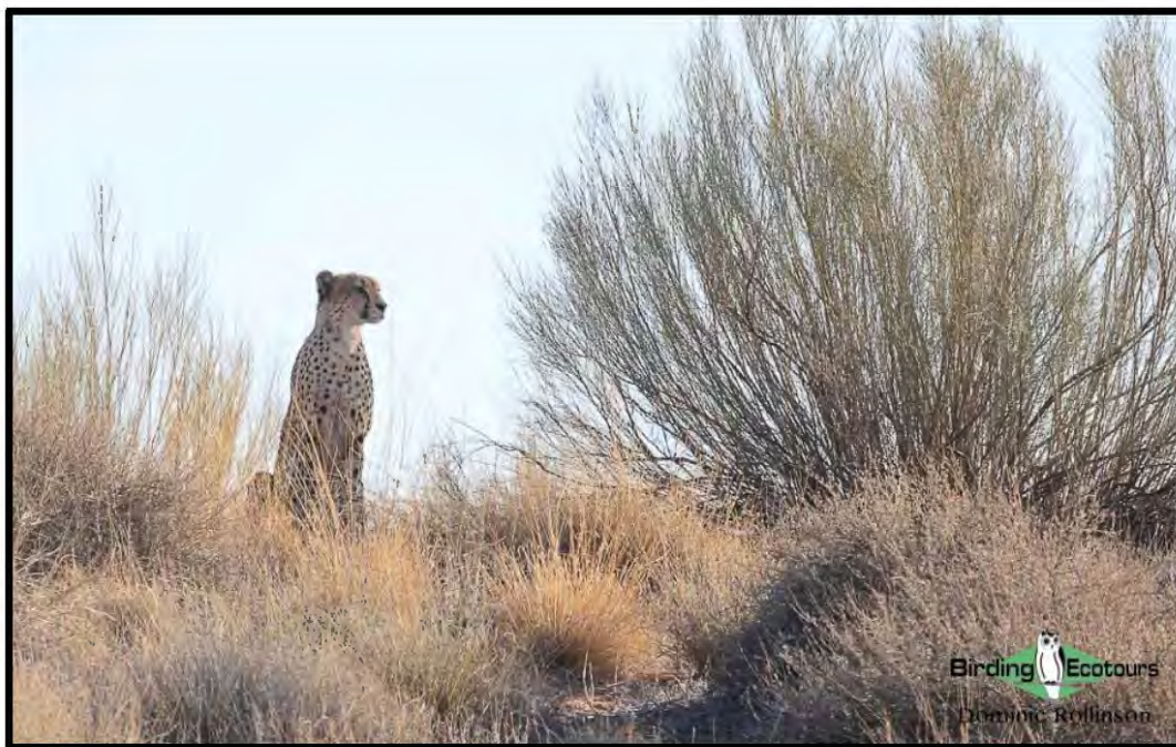
This Cheetah was seen surveying the area from atop a dune in the Kalahari.

Cheetah , presenting themselves within the first ten kilometers of the drive. We also caught up with some of the more common birds in the park along this initial stretch of road, such as White-browed Sparrow-Weaver , Kalahari Scrub Robin , Cape Starling , Fork-tailed Drongo and Marico Flycatcher . Throughout the park, all these species were very common, and we had smaller numbers of Yellow Canary , Black-chested Prinia , Pririt Batis , Chestnut-vented Warbler , the subcoronatus race of Southern Fiscal , the shockingly vivid Crimson-breasted Shrike and the thick-billed western race of Sabota Lark . Decent numbers of Namaqua Sandgrouse were seen flying overhead to their watering points in the early morning, whilst a single male Burchell's Sandgrouse was seen very well at Kij Kij waterhole, soaking his specialized belly feathers to take water back to his chicks. Other singletons observed in the reserve included Crowned Lapwing , Fawn-coloured Lark , Pearl-breasted Swallow , an unexpected Buffy Pipit , a distant Kori Bustard and a roosting Southern White-faced Owl , expertly spotted at its well-hidden daytime roost by our ranger.