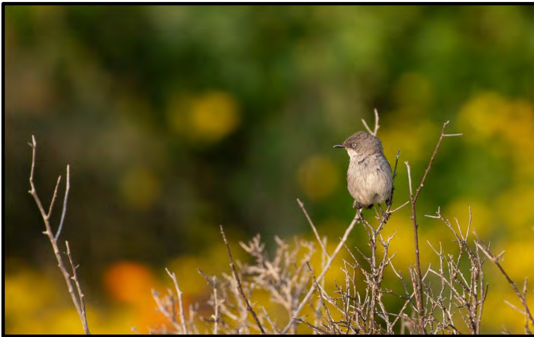
Layard's Warbler with a backdrop of flowers.

Thereafter, we made our way back to Pofadder, stopping on the outskirts of town for Short-toed Rock Thrush . We swiftly connected with a female perched nonchalantly on the fence posts between the houses, later joined by sunbathing White-backed Mousebirds and a foraging White-throated Canary . We paid a visit to a reservoir where Sclater's Larks are known to drink, where we found more Grey-backed Sparrow-Larks , Yellow Canaries , Scaly-feathered Weavers , Lark-like Buntings and Ring-necked Doves , but unfortunately, no larks. However, we did get a great sighting of a pair of Bat-eared Foxes running in the distance, which is a real treat to see during the daytime. The distant croaking of Karoo Korhaans helped to keep us entertained during the lark stakeout, and we managed to get lovely views of three of these bustards calling a bit further down the road. We also found a pair of lively Yellow-bellied Eremomelas , another Stark's Lark and a hunting Chat Flycatcher .