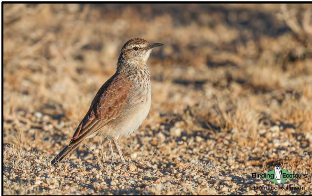
Karoo Long-billed Lark was seen well near Nababeep.

We then returned to our hotel for lunch and a much-needed rest break, enjoying the Rock Martins drinking from the pool in low, swooping flights, before heading out again in the late afternoon. This time, we headed west of Springbok towards the village of Nababeep and onwards to the stunning Spektakel Pass, making roadside stops as we went. The floral displays here were mind-blowing, with this season being the best floral season in decades, and we enjoyed walking around enjoying and photographing the flowers and taking in the incredible views. The birding in the general area was good too, and we soon found Orange River White-eye , African Red-eyed Bulbul , Cape Starling , Karoo Eremomela , Karoo Long-billed Lark , Karoo Chat , Ground Woodpecker and Layard's Warbler , along with species we had previously seen like Rufous-eared Warbler and Ant-eating Chat .