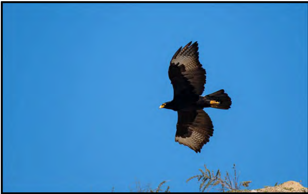
The striking Verreaux's Eagle in Langebaan (photo, tour participant, Jake Zadik).

food, we took a quick stroll around the eucalyptus stands behind the house, which revealed Pearl-breasted Swallows , a showy male Cardinal Woodpecker and Rock Martins flying around the treetops. A trio of vibrant African Hoopoe in hot pursuit of one another saw us off as we left Geelbek and proceeded back to Langebaan. After leaving the park, we paid a visit to the Langebaan Quarry, situated on the outskirts of town, and home to a pair of magnificent Verreaux's Eagles , which have bred here for many years. We were fortunate enough to see one of these majestic raptors perched on top of the quarry, as well as seeing it gliding effortlessly, on immense wings, across the quarry. Other birds seen in the quarry included Pied Starling , Brown-throated Martin , Rock Kestrel , African Black Swift , Southern Fiscal , Black-headed Heron and Lesser Swamp Warbler .