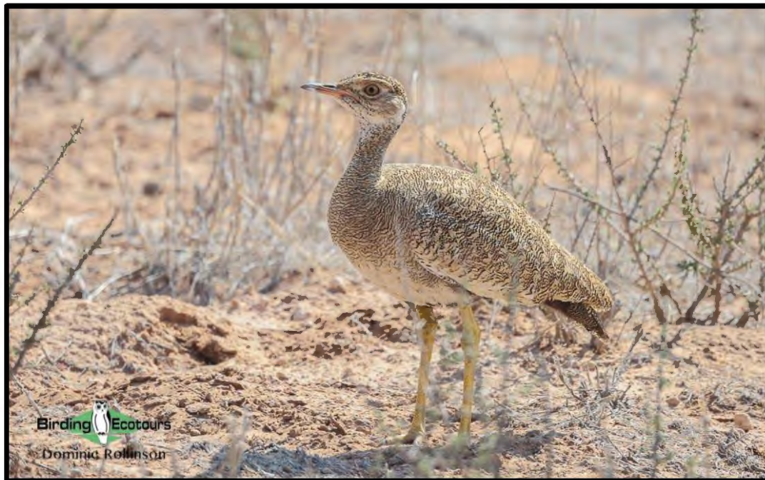
Northern Black Korhaans (such as this female) were numerous in the northern sections of this tour.

After getting back to camp around 03:30 p.m., we had a brief break and then went back to Twee Rivieren camp for a quick walk-around, getting us Marico Sunbird , Lark-like Bunting and lovely views of a singing Gabar Goshawk .