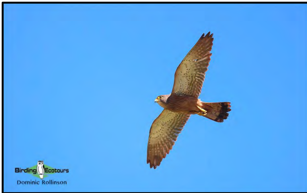
Rock Kestrel was widespread and abundant throughout western South Africa.

We made a brief roadside lunch stop in some strandveld near Silwerstroomstrand, where we got stunning views of the tricky Cape Clapper Lark and started coming to grips with species that are characteristic of this new habitat, such as Chestnut-vented Warbler and White-backed Mousebird . Not long after seeing our first snake of the trip, we found a massive black Mole Snake buried under a low shrub close to the road at this spot. This was also around the time when we started noticing the glowing swathes of orange, yellow and white flowers that carpet the landscape at this time of year - a trademark feature of springtime in the western parts of South Africa. We got a chance to indulge ourselves in the glorious blooms at Tienie Versveld Wildflower Reserve further along the west coast road. Despite the bustling tourists, we also managed to eke out a couple of new birds for the trip, namely the diminutive Cloud Cisticola (a mere speck in the sky as they performed their high 'cloud-scraping' display flights), the striking Cape Longclaw , and looks at more common species like Spur-winged Goose , Rock Kestrel , Capped Wheatear , Large-billed Lark , Red-capped Lark , African Pipit and Greater Striped Swallow . A soaring Lanner Falcon was also a welcome find here.