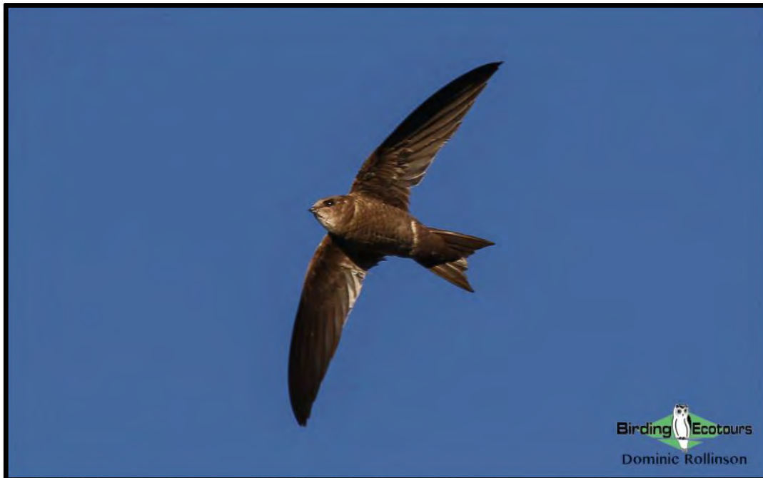
Bradfield's Swift took some finding but eventually we saw them well in Pofadder.

We had a slightly later morning today in order to enjoy a sit-down breakfast at the hotel, but still managed to get some good birding done in the interim. A pair of Bradfield's Swifts came flying overhead just before breakfast, once again alongside Little Swifts , and the hotel garden's resident Long-billed Crombecs , Karoo Thrushes , African Red-eyed Bulbuls , White-backed Mousebirds and a visiting Bokmakierie bid us farewell as we departed Pofadder and headed east towards Upington.