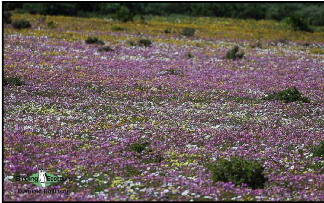
The fantastic floral displays were a major highlight of this tour.

We then dropped off Kathleen and Ron at the airport, before shooting out to Strandfontein Sewage Works for a quick whizz around, which added the likes of Southern Pochard and Fulvous Whistling Duck while the drive back to the airport added a House Crow - our final new bird for the trip. This then ended a thoroughly enjoyable and productive two weeks in western South Africa with fantastic floral displays and some top-notch bird and mammal sightings. Thanks to all the participants for making this tour the success it was.