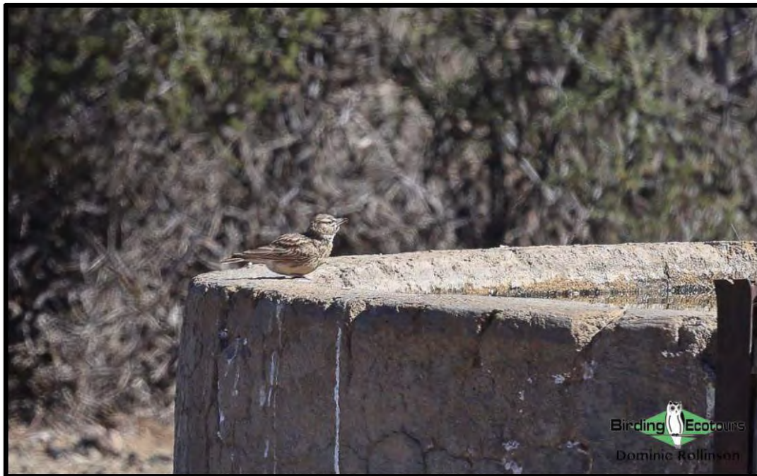
A record shot of the Sclater's Lark which we saw near Brandvlei.

We then started on the long drive south to Brandvlei, managing to get another Pygmy Falcon en route. About 10 kilometers north of Brandvlei, we stopped at a water trough next to the road in search of Sclater's Lark , which we didn't find here, but the leaking reservoir did attract White-throated Canary, Cape Sparrow, Lark-like Bunting, Red-headed Finch and a single Namaqua Dove . We moved on to another spot east of Brandvlei to keep trying for the larks, once again at a water trough. The drive there produced Northern Black Korhaan, Namaqua Sandgrouse , and a lone Black-eared Sparrow-Lark . Upon arriving at the trough, a small brown bird had just landed next to a puddle alongside the reservoir. A brief glance at it through the binoculars revealed it to be a Sclater's Lark , which then flew across the road and landed on a trough on the other side of the car. It drank for a few minutes and then took off and flew for miles until it was out of sight. We exchanged high fives and were relieved not to have to sit and wait at any more drinking troughs.