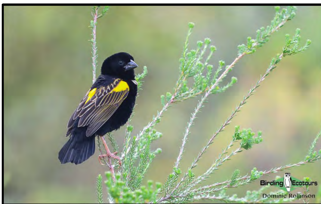
Yellow Bishop in the fynbos of Harold Porter Botanical Garden.

We then made our way to the picturesque Harold Porter Botanical Gardens for a picnic lunch and a lovely walk around, where we got in touch with species like Cape Batis, Brimstone Canary, Bar-throated Apalis, Olive Thrush, Yellow Bishop and African Dusky Flycatcher , in addition to many previously mentioned species from Rooi Els. A troop of feisty Chacma Baboons also kept us entertained and guarding our lunch packs!