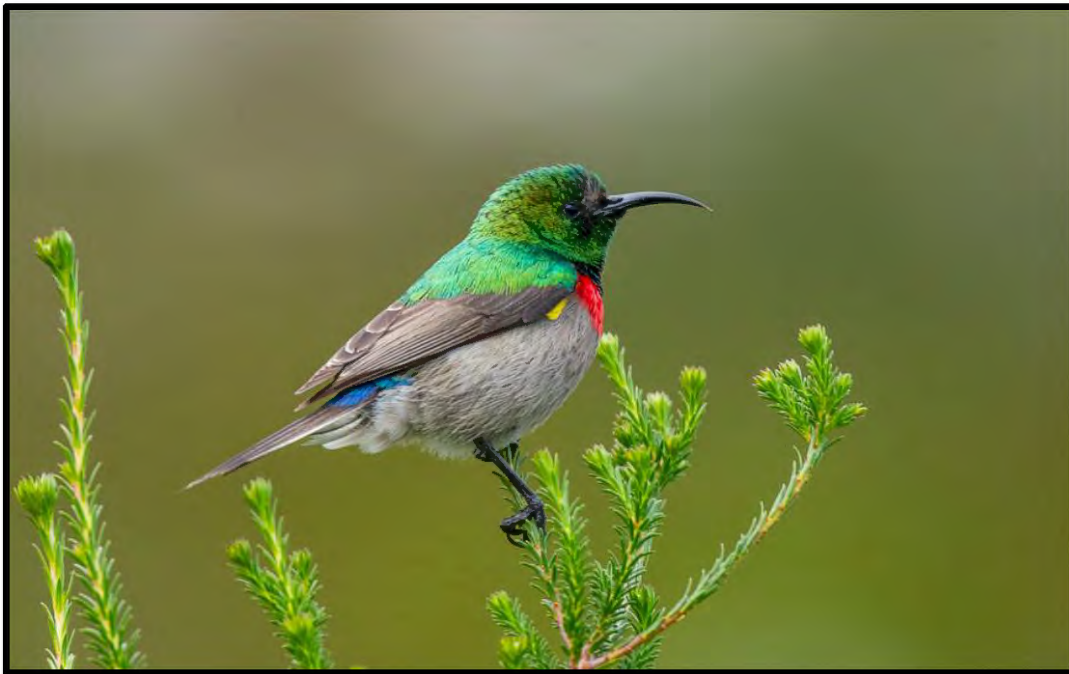
Southern Double-collared Sunbirds were common in Kirstenbosch Botanical Garden.

After a great breakfast at our lodge, we headed out for a walk through the magnificent Kirstenbosch National Botanical Garden. With splendid weather and an empty garden due to it being early on a Sunday morning, we got to enjoy the many avian delights of the garden in relative peace. Some of the highlights included the resident pair of Spotted Eagle-Owls roosting at their nest site, displaying Brown-backed Honeybirds performing their aerial pursuit display flights, multiple Black Sparrowhawk flybys, a high-flying pair of Booted Eagles and an African Harrier-Hawk also performing its vocal display flight. We were treated to a plethora of species during our time in the gardens, such as Forest Canary , Cape Canary , Brimstone Canary , Cape Batis , Sombre Greenbul , Southern Boubou , Speckled Mousebird , Sweet Waxbill , African Olive Pigeon , Amethyst and Southern Double-collared Sunbirds , Olive Woodpecker , Fork-tailed Drongo , African Dusky Flycatcher , Common Buzzard , Bar-throated Apalis , White-necked Raven and the ever-present Hadada Ibis and Egyptian Geese .