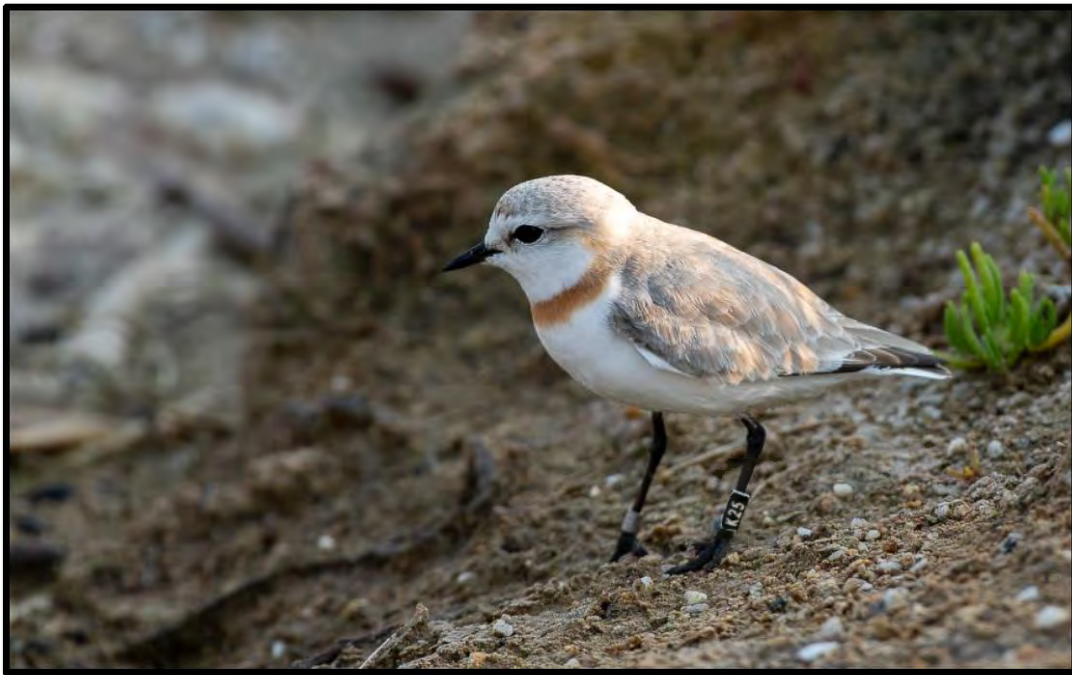
As always, Chestnut-banded Plovers were numerous in Velddrif.

about an hour north of Langebaan, situated near the mouth of the Berg River. The expansive wetland formed here by the river, as well as the multiple salt works around the mouth create prime habitat for a variety of coastal birds. Kliphoek salt pans, in particular, was quite rewarding, giving us plenty of Chestnut-banded Plovers (some with chicks), as well as Three-banded Plover , Common Sandpiper , Ruff , Black-crowned Night Heron , African Spoonbill , Cape Shoveler , Cape Teal , Red-billed Teal , South African Shelduck , Glossy Ibis , Common Tern , Large-billed Lark , Red-capped Lark , Karoo Scrub Robin , Pearl-breasted Swallow , Banded Martin , White-throated Swallow , Black-winged Stilt and Pied Avocet . We further enjoyed large flocks of Black-necked Grebes , close views of African Marsh Harrier , the resident Red-necked Phalarope and, surprisingly, the vagrant Pink-backed Pelican that has been moving around the Cape since 2021. We also had a brief visual here of the adorable Bush Karoo Rat .