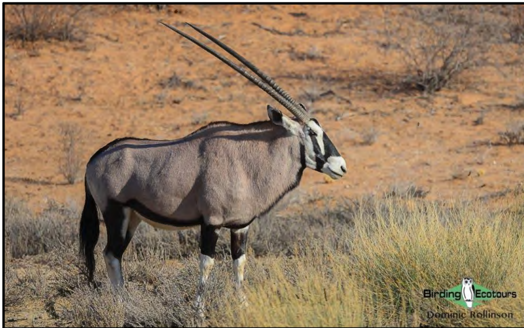
Attractive Gemsbok are abundant in the Kalahari.

Our earliest breakfast yet was had this morning, allowing us to get to the gate to the Kgalagadi Transfrontier Park at Twee Rivieren by 7 am, in order to meet our safari guide, Ian, who would be taking us out on a six-hour open-top game drive up the Nossob riverbed. This, along with the Auob riverbed, forms the lifeblood of this dry, semi-desert park, as animals and birds are concentrated along its course, attracted by the promise of water, food and shelter from the unforgiving Kalahari sun.