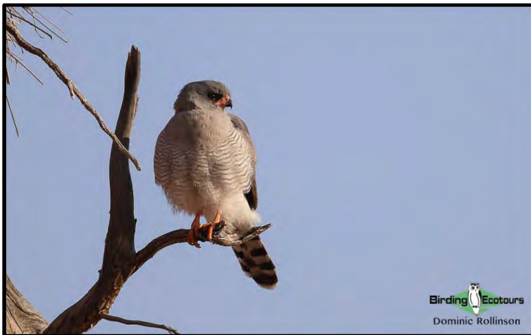
Gabar Goshawk was one of the more abundant raptors seen in the Kalahari.

We had another wonderful safari drive into the park today, this time going up the other main road in the park that runs northwest from Twee Rivieren along the Auob riverbed. The first stretch of the drive reintroduced us to the same suite of common thornveld birds we saw yesterday, with Ant-eating Chat and South African Shelduck being new additions to our park list. We had a few noteworthy Gabar Goshawk sightings before our first new bird of the trip for the day, a Common Scimitarbill sunning itself on top of a tall camel-thorn. Chat Flycatchers were more common along this riverbed than the Nossob from yesterday, but still never approached the numbers of ubiquitous Marico Flycatchers .