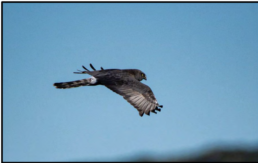
Black Harrier was seen on several occasions while up the west coast.

A late afternoon drive towards Jacob's Bay, just north of Langebaan, proved to be particularly fruitful, delivering a stunning Black Harrier flying alongside our vehicle for a kilometer or two. One or two roadside stops along the way delivered Cape Long-billed Lark , Sickle-winged Chat , Ant-eating Chat , Wattled and Pied Starlings , Yellow Canary , Blue Crane , Pearl-breasted Swallow , Spotted Thick-knee , Southern Masked Weaver , Grey Tit , and Karoo Lark , amongst many species seen earlier. The rocky shoreline of the Mauritzbaai section of town gave us great views of the sought-after Antarctic Tern , accompanied by White-fronted Plovers , Greater Crested Terns and Crowned Cormorants . Driving back to Langebaan gave us one more Southern Black Korhaan , along with Black-winged Kite and Rock Kestrel , to end off another brilliant day of birding.