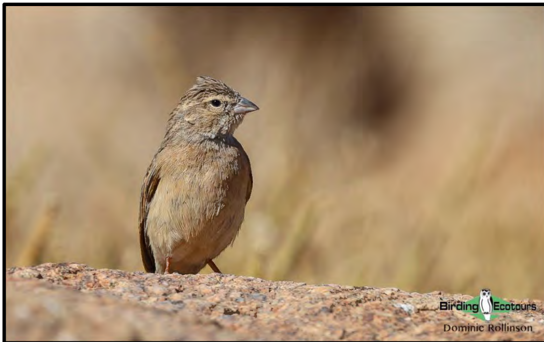
Nomadic Lark-like Buntings were rather widespread on this birding tour.

We departed our lodging early this morning in order to get to the coastal town of Port Nolloth, about an hour and a half west of Springbok. Our priority here was to find the highly localized Barlow's Lark , only found in a narrow strip of coastal dunes in South Africa and southern Namibia. We managed to find a couple of these larks performing their aerial display flights, with a few briefly perching as well. The low, open scrub on the dunes here also played host to Karoo Scrub Robin , Grey-backed Cisticola , Cape Long-billed Lark and the charismatic Tractrac Chat , whilst small groups of Lark-like Buntings , a pair of Namaqua Sandgrouse and a single Black Harrier , all gave us brief flybys.